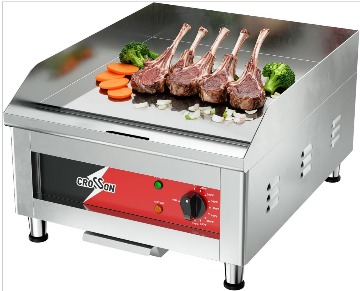
Image: The CROSSON Electric Countertop Griddle, showing the internal heating elements and control panel.