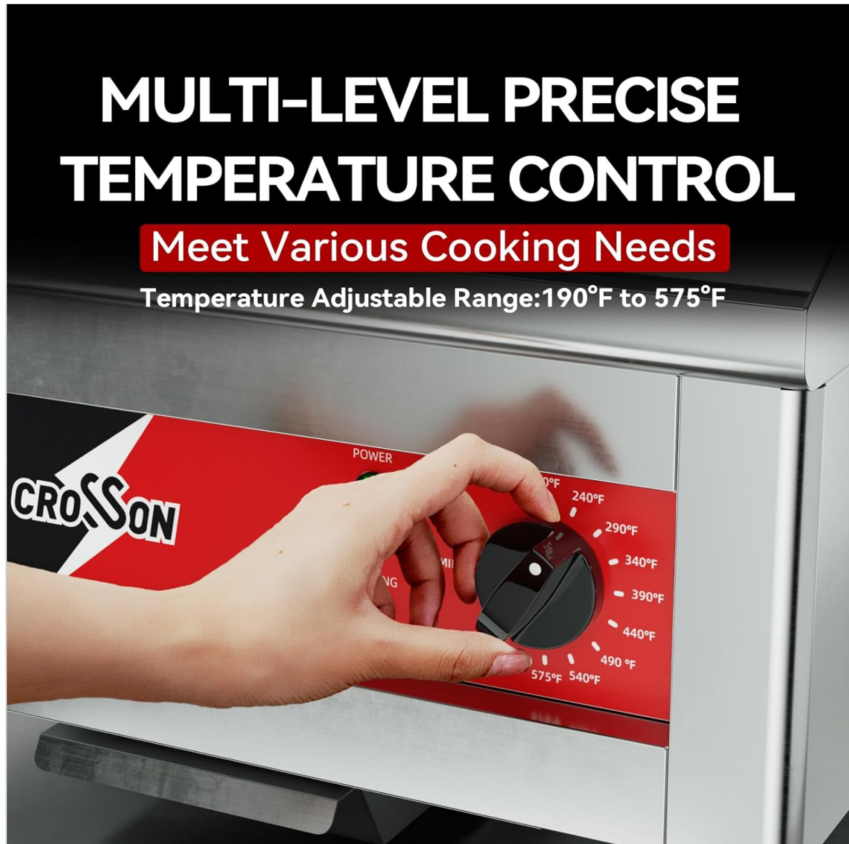
Image: A hand adjusting the precise temperature control knob, showing temperature settings from 190°F to 575°F.