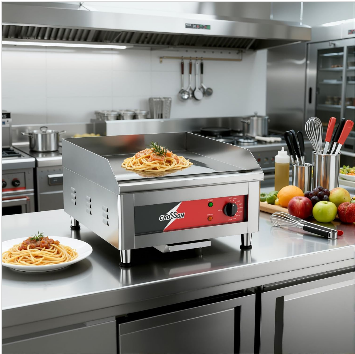
Image: The CROSSON Electric Griddle in use, cooking pasta on its chrome-plated surface within a kitchen environment.