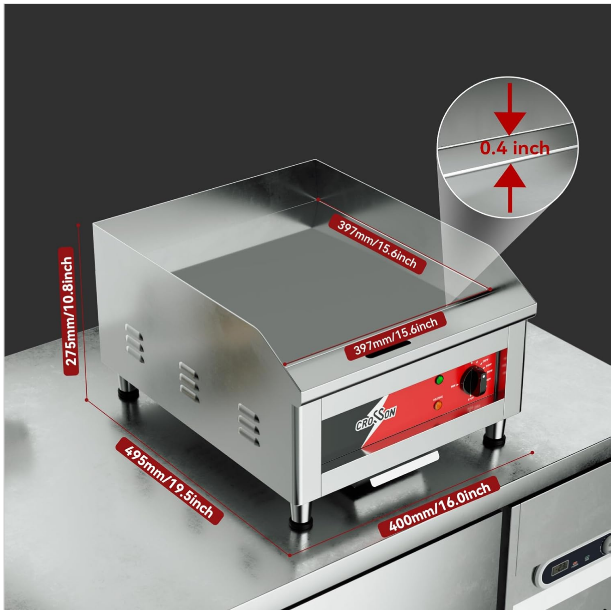
Image: A diagram illustrating the precise dimensions of the griddle in inches and millimeters.