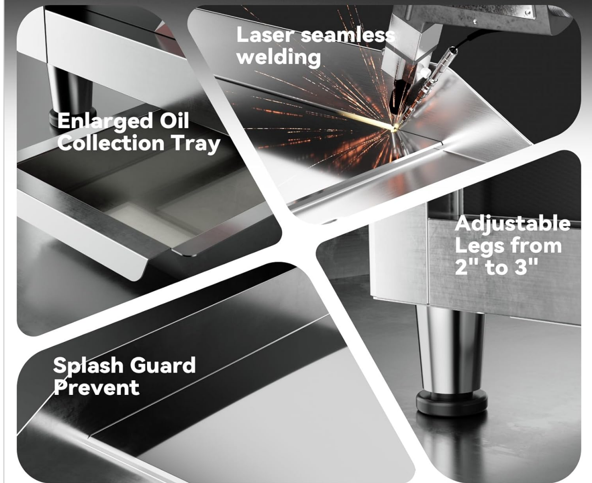
Image: Close-up details of the griddle's user-friendly design, highlighting the enlarged oil collection tray, laser seamless welding, adjustable legs, and splash guard.