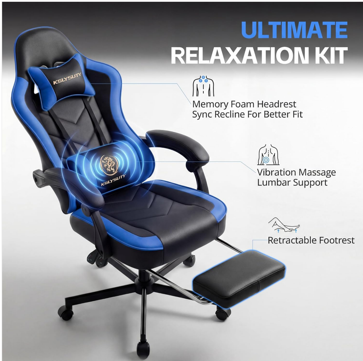
Figure 4: Relaxation Kit Features

To deploy the footrest, pull it out from beneath the seat. To retract it, push it back in until it is fully stored. The footrest provides additional support for your legs when reclining.