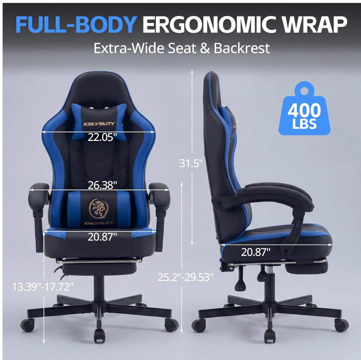
Figure 5: Chair Dimensions