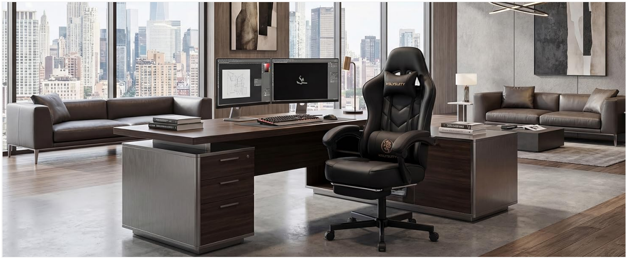
Figure 3: Recline Adjustment and Armrest Synchronization