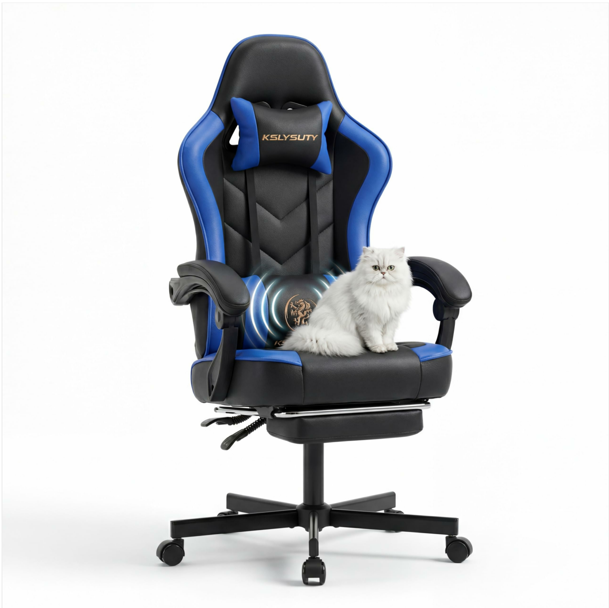
Figure 1: Kslysuty GF-GMC8556 Ergonomic Gaming Chair (Blue Leather)