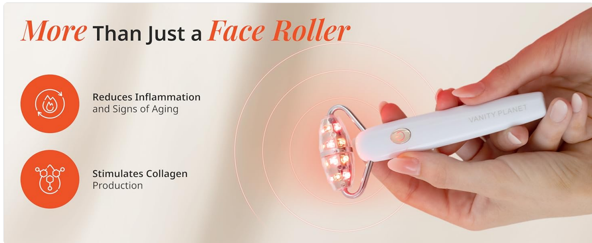
Image: The device is shown with text indicating it reduces inflammation, signs of aging, and stimulates collagen production.

Image: Diagram illustrating the benefits of LED therapy, including promoting collagen production, lymphatic drainage, boosting oxygen flow, improving skin tone, and reducing wrinkles.