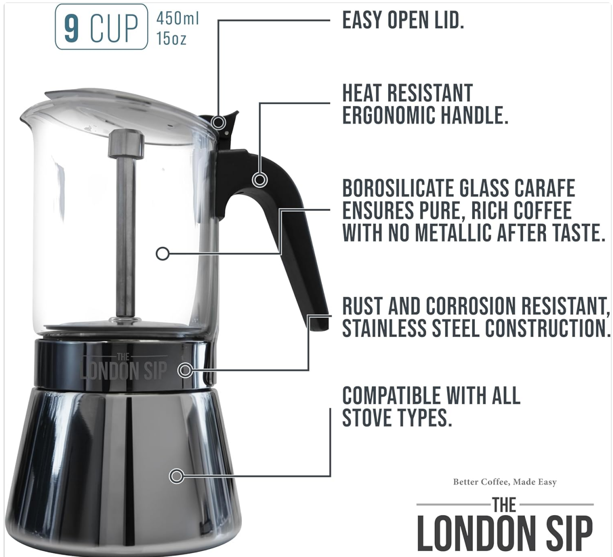
Figure 2: The London Sip Stovetop Espresso Maker fully assembled and ready for use.