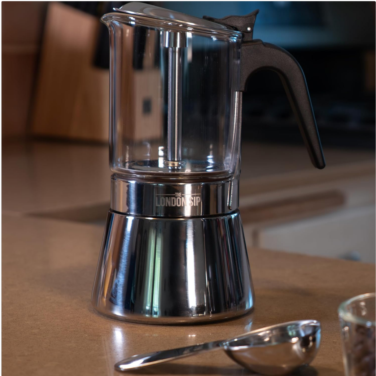
Figure 1: Exploded view of the London Sip Stovetop Espresso Maker, highlighting its key components: easy open lid, heat resistant ergonomic handle, borosilicate glass carafe, rust and corrosion resistant stainless steel construction, and compatibility with all stove types.

The London Sip Stovetop Espresso Maker consists of three main parts: