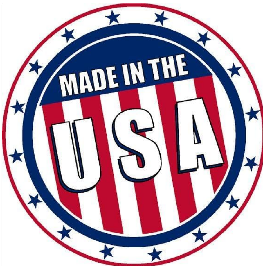
Image Description: A circular logo featuring the text "MADE IN THE USA" with a design reminiscent of the American flag, signifying the product's country of manufacture.

The product is manufactured in the USA, indicating adherence to quality standards.