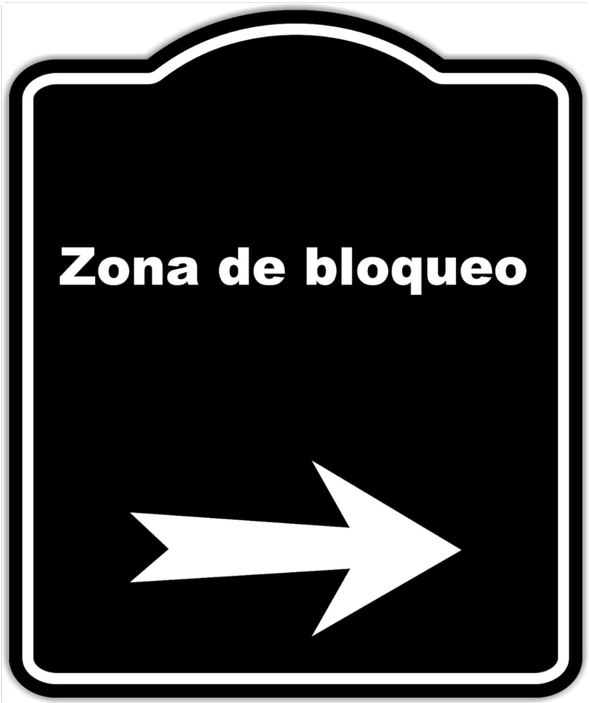
Image Description: A black sign with a white border. The text "Zona de bloqueo" is prominently displayed in white at the top, with a white right-pointing arrow below it. This image shows the primary design of the sign.