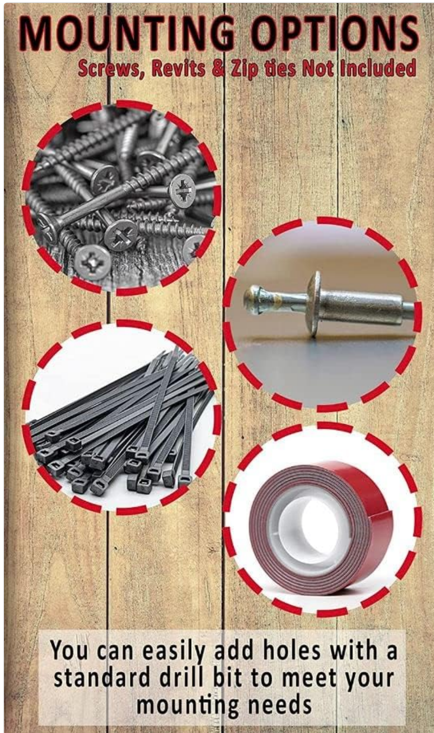
Image Description: This image displays four common mounting options: screws, rivets, zip ties, and double-sided adhesive tape. A caption explains that these items are not included and that users can easily add holes to the sign using a standard drill bit to suit their mounting needs.