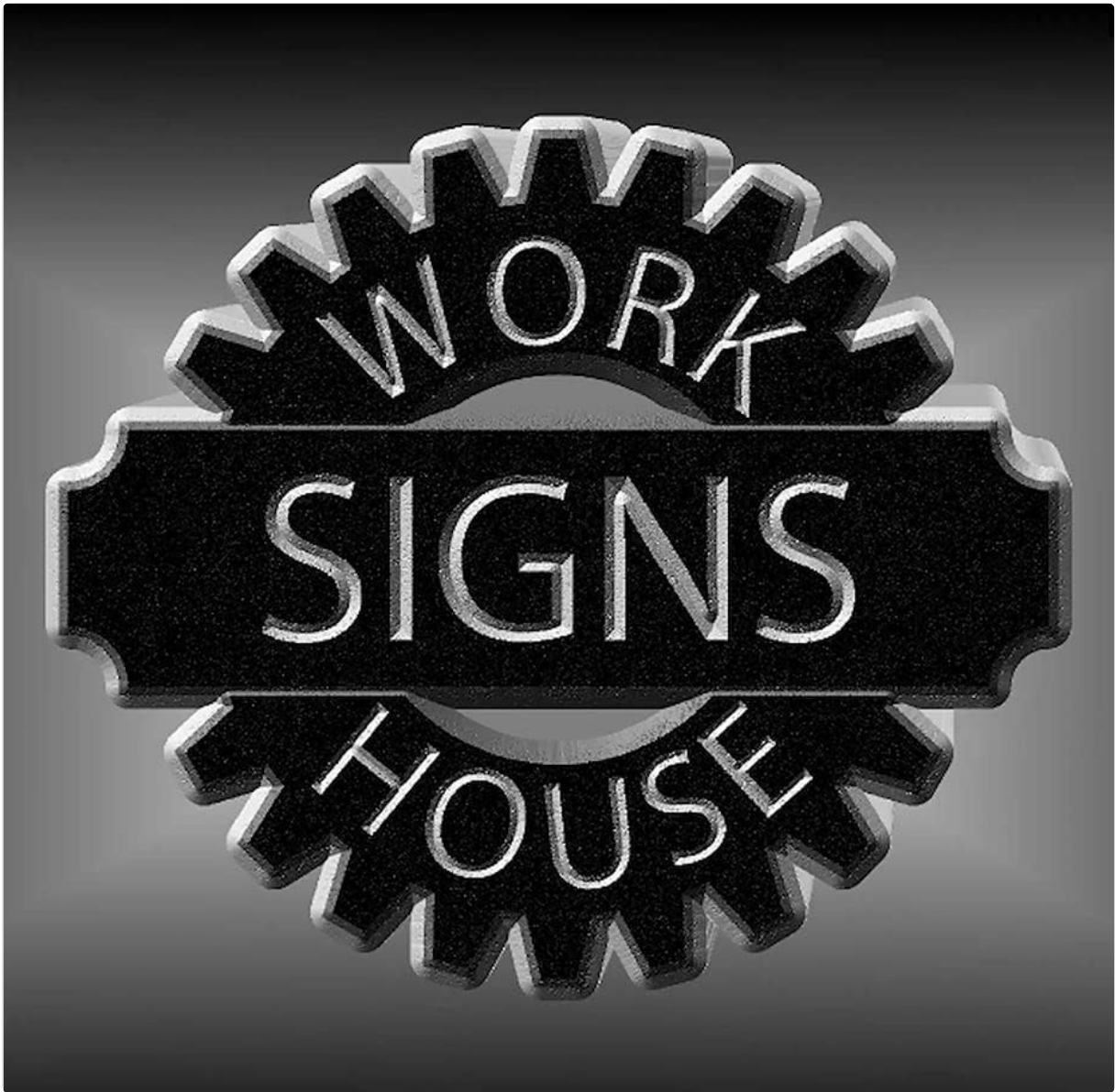
Image Description: The Work House Signs brand logo, depicted as a gear with the words "WORK SIGNS HOUSE" integrated into its design.