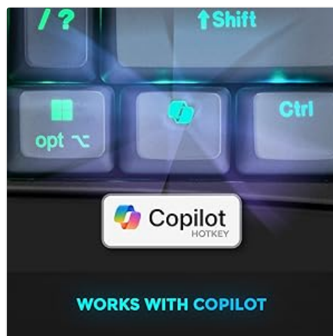
Image: Works with Copilot. A close-up of the keyboard showing the dedicated Copilot hotkey.