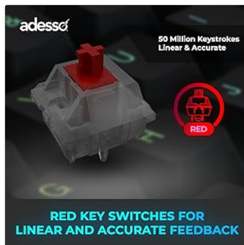
Image: Red Key Switches for Linear and Accurate Feedback. A close-up view of the red mechanical switches, emphasizing their linear and accurate response.