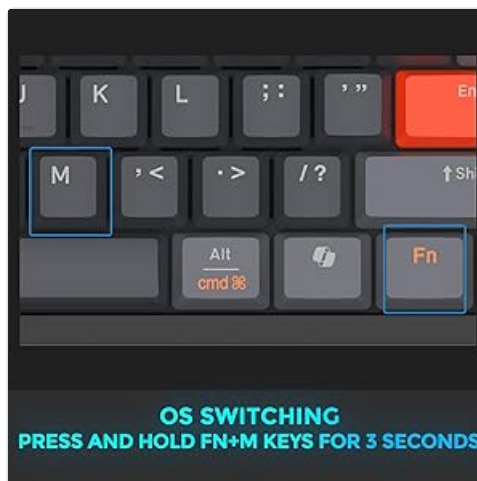
Image: OS Switching. The image highlights the 'Fn' and 'M' keys, indicating their use for switching operating system layouts.