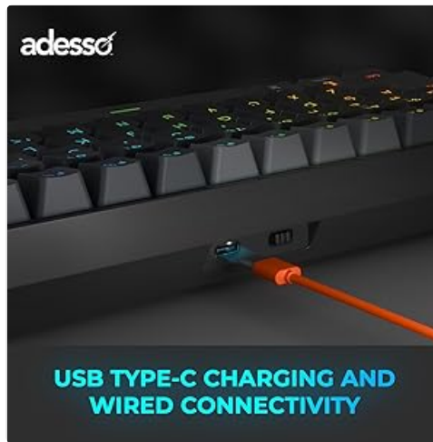
Image: USB Type-C Charging and Wired Connectivity. The image shows the USB-C port on the side of the keyboard with a cable connected, indicating charging and wired connection capability.