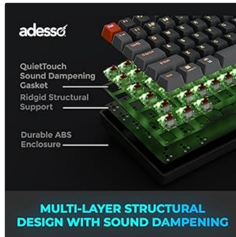
Image: Multi-Layer Structural Design with Sound Dampening. An exploded view of the keyboard's internal layers, highlighting the gasket structure and sound dampening material.