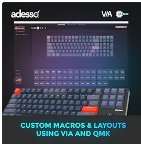
Image: Custom Macros & Layouts Using VIA and QMK. The image displays the VIA software interface with a keyboard layout, illustrating customization options.