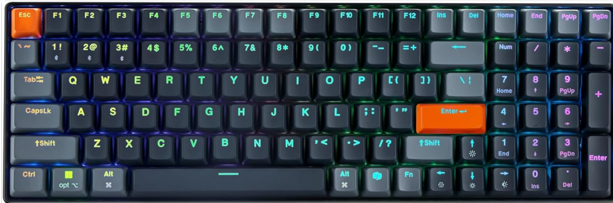
Image: Top-down view of the ADESSO EasyTouch 1200 mechanical keyboard, showcasing its compact layout and vibrant RGB backlighting.

Thank you for choosing the ADESSO EasyTouch 1200 Mechanical Keyboard. This manual provides detailed instructions for setting up, operating, and maintaining your keyboard. The EasyTouch 1200 offers versatile connectivity options (wired, wireless, Bluetooth), multi-OS compatibility, illuminated keys, and a Copilot AI hotkey for enhanced productivity.