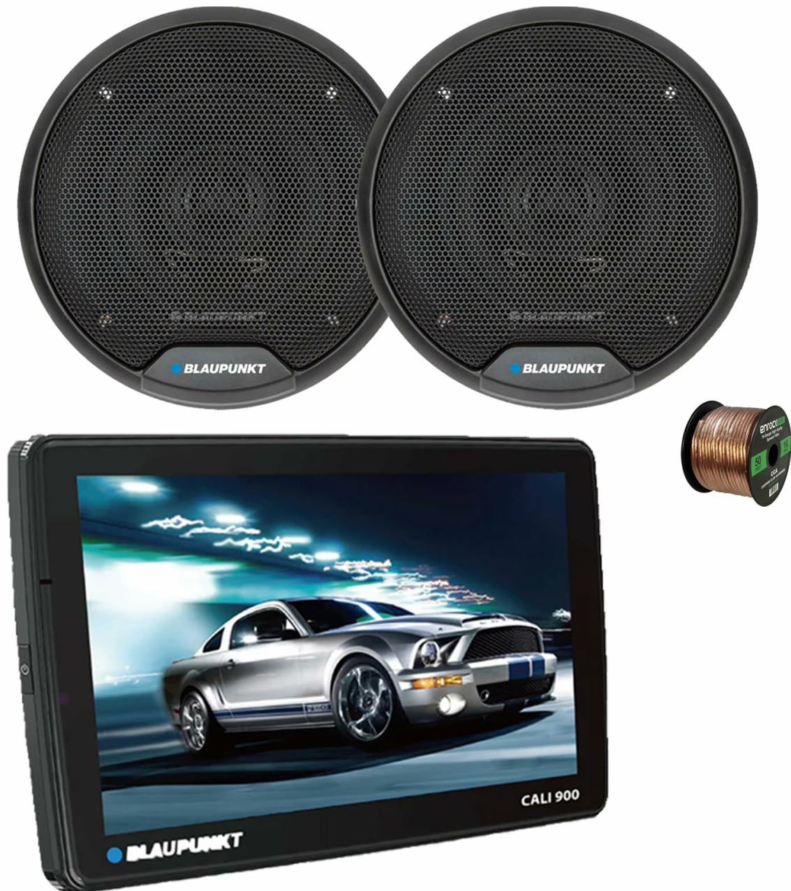
Image 1.1: Blaupunkt CALI 900 Receiver. This image shows the front view of the CALI 900 receiver with its 9-inch QLED touchscreen display, featuring a car image on the screen.