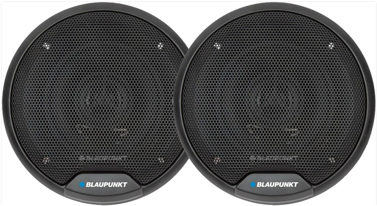
Image 4.3: Blaupunkt BPS-E653 6-inch Car Speakers. This image shows a pair of the BPS-E653 speakers with their protective grilles.