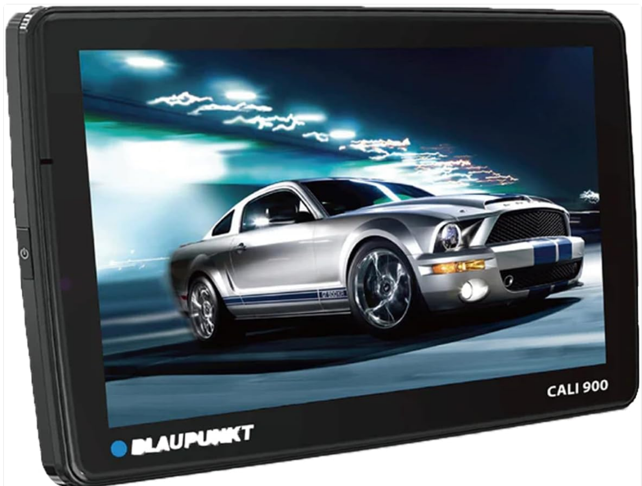
Image 4.1: Front view of the Blaupunkt CALI 900 Receiver. This image displays the sleek design of the receiver's front panel and large touchscreen.