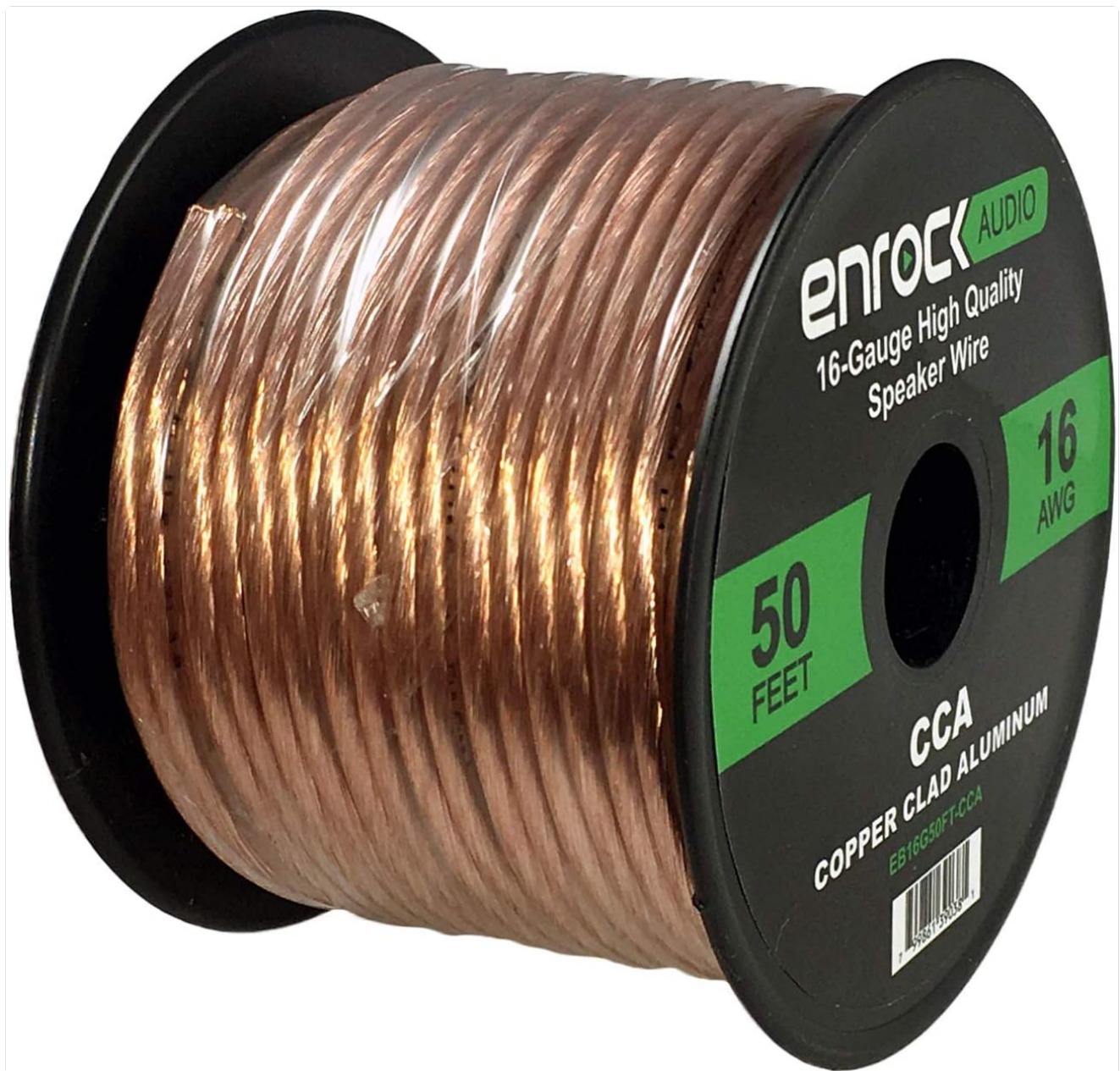
Image 5.1: 16-Gauge Speaker Wire. This image shows the spool of 16-gauge speaker wire included for connecting your speakers.