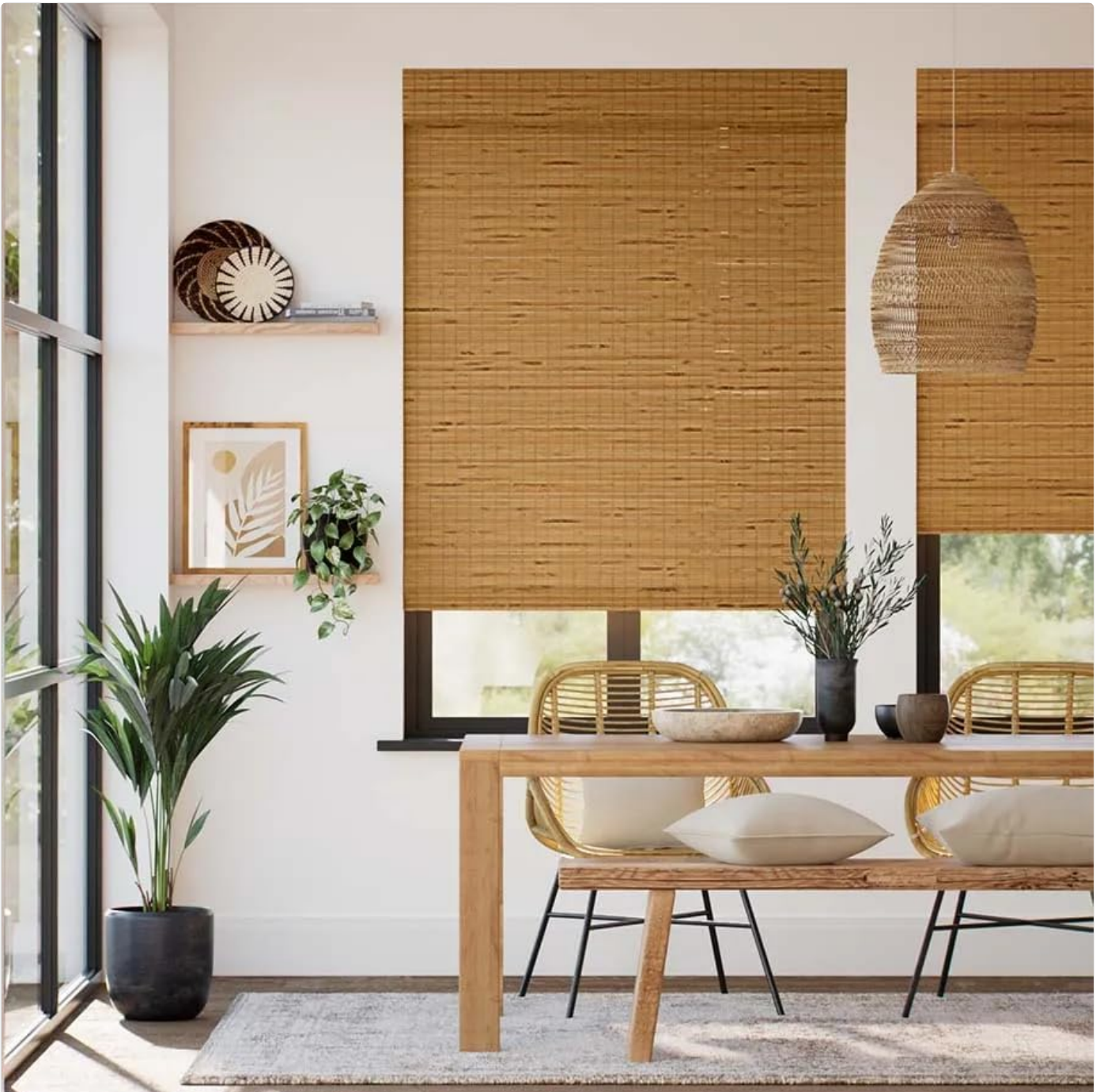
Image: Two SelectBlinds Classic Cordless Woven Wood Shades installed in a modern living area, demonstrating their aesthetic appeal and functionality.