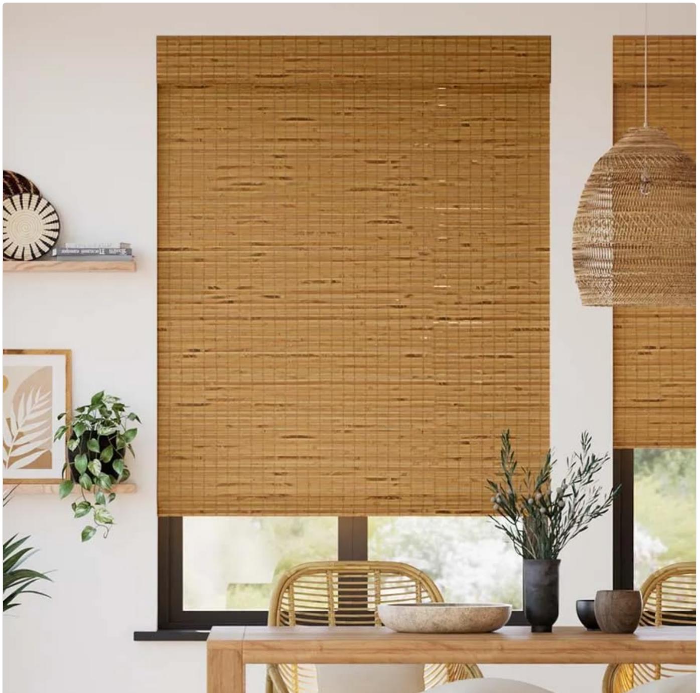
Image: A SelectBlinds Classic Cordless Woven Wood Shade in Primrose color, installed in a dining room setting, showcasing its natural texture and light filtering.