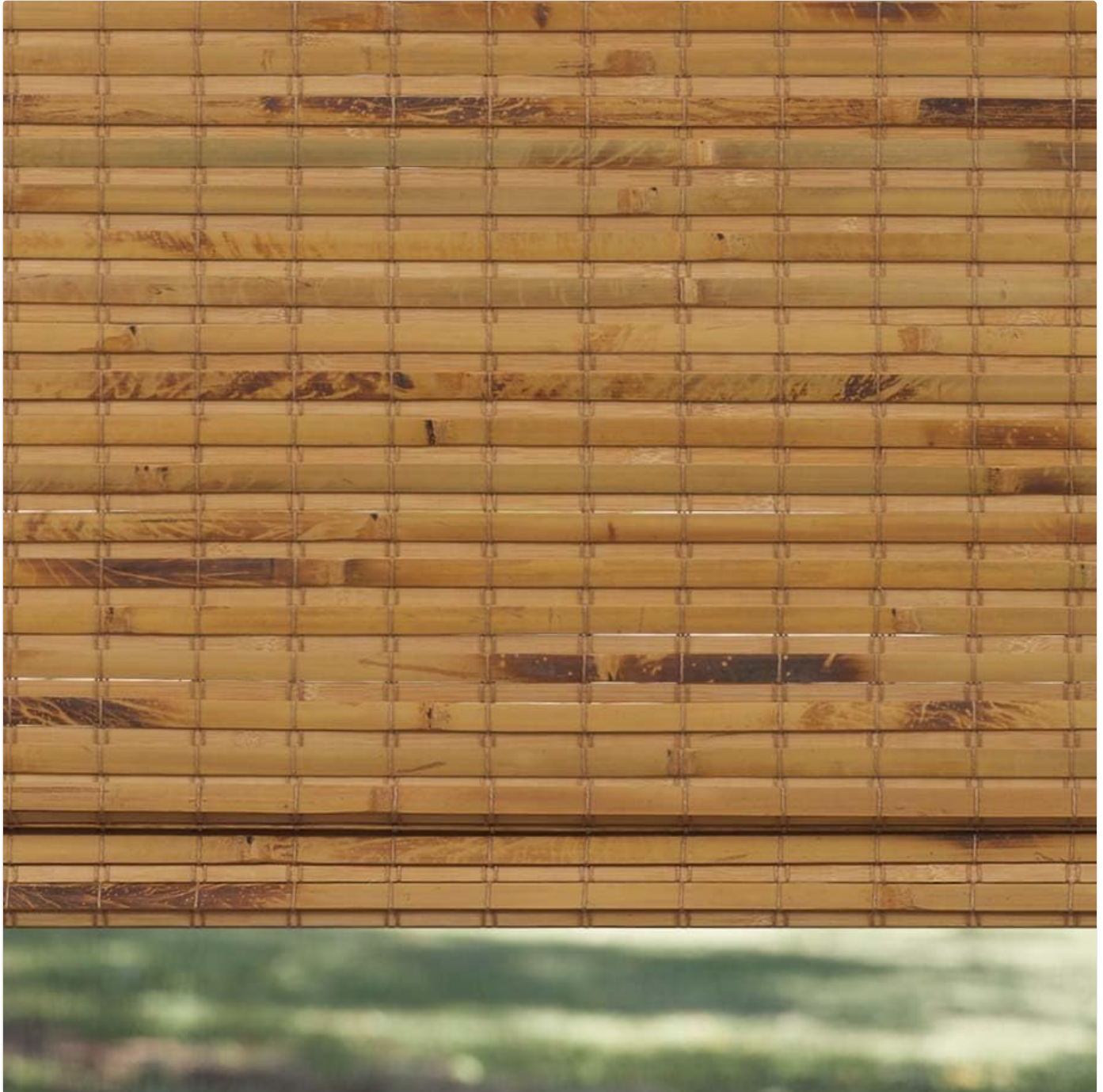
Image: A detailed close-up of the woven wood material, highlighting the natural variations and texture of the bamboo and reeds.