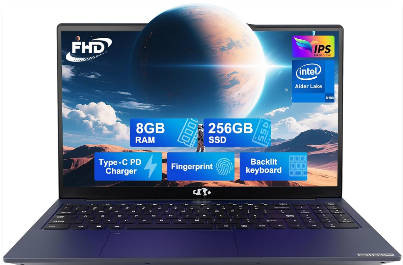
The NIMO 15.6 IPS-FHD Laptop, featuring its vibrant display and ergonomic design.

This manual provides essential information for setting up, operating, maintaining, and troubleshooting your NIMO 15.6 IPS-FHD Laptop. Designed for students and home users, this laptop combines performance with portability, featuring an Intel Pentium 4 Cores N100 processor, 8GB RAM, and 256GB SSD. Key features include a backlit keyboard, fingerprint security, and Wi-Fi 6 connectivity, ensuring a smooth and efficient user experience.