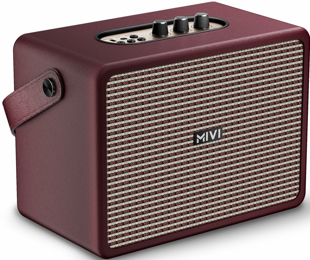
Figure 1: Mivi SuperBox Classic Speaker.