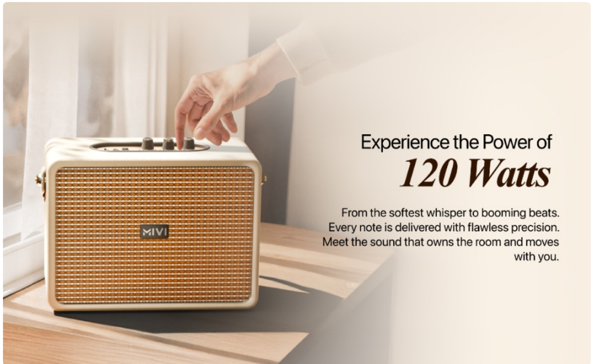
Figure 2: Overview of Mivi SuperBox Classic features.

Bringing you timeless craft with tomorrow's clarity.