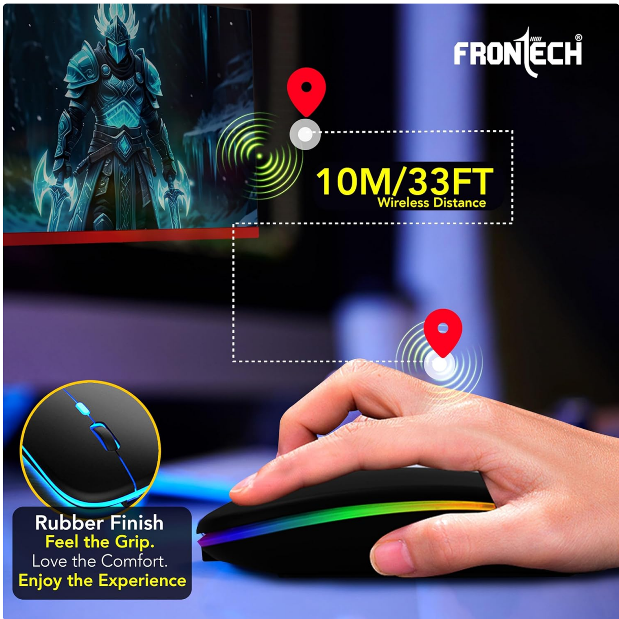
Image: The FRONTECH Wireless Mouse with an overlay indicating a wireless operating distance of 10 meters (33 feet).