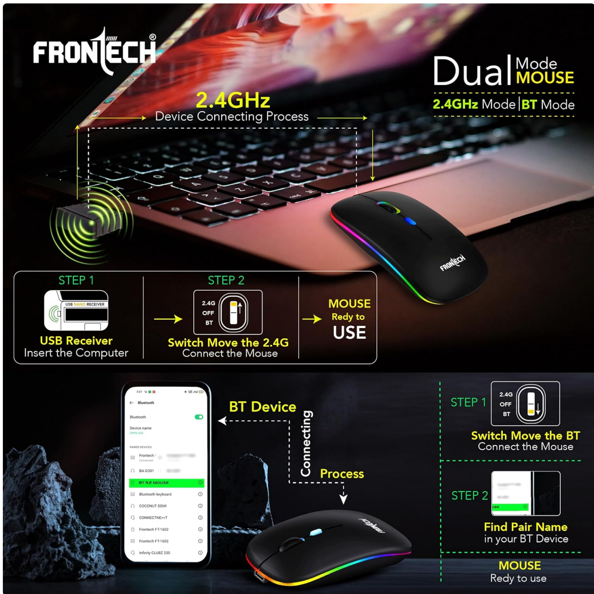
Image: A visual guide illustrating the connection process for both 2.4GHz wireless mode and Bluetooth mode. For 2.4GHz, insert the USB receiver and switch the mouse to 2.4G mode.