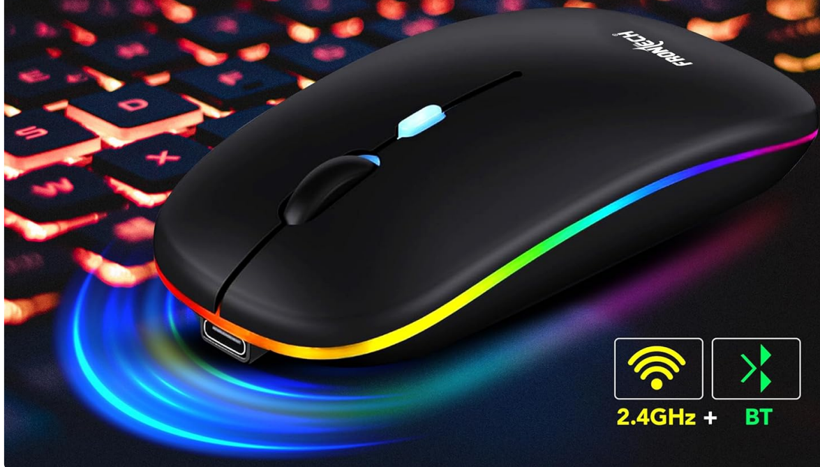
Image: The FRONTECH Wireless Mouse MS-0057, showcasing its RGB lighting and indicating 2.4GHz and Bluetooth connectivity.