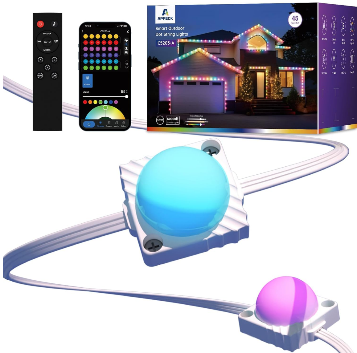
Image 1.1: APPECK Permanent Outdoor Lights 50ft, showcasing the lights, remote control, and smartphone app interface.