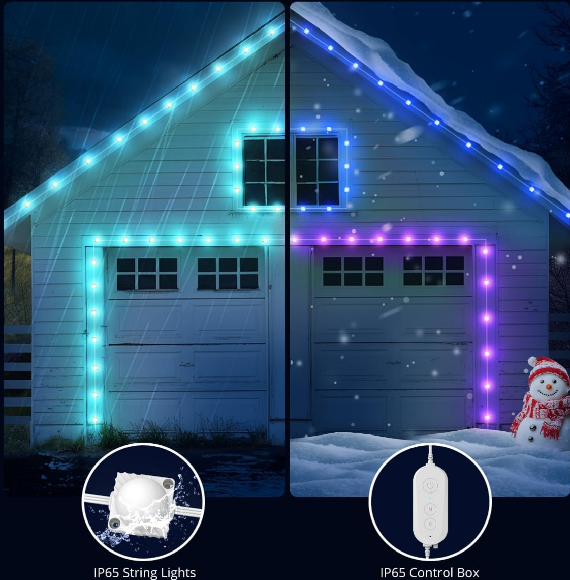
Image 6.1: Reliability and durability features, highlighting IP65 waterproof rating and wide operating temperature range.

Video 6.1: Demonstrates the IP65 waterproof capabilities of APPECK Smart Outdoor Dot String Lights.