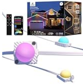
Image 5.2: App interface showing different modes for color change, scene customization, and music sync.