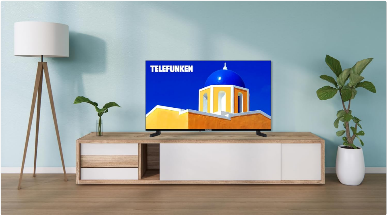
Figure 4.2: Front view of the Telefunken 40DTFV735 Smart TV. This shows the full display area and the brand logo at the bottom center.