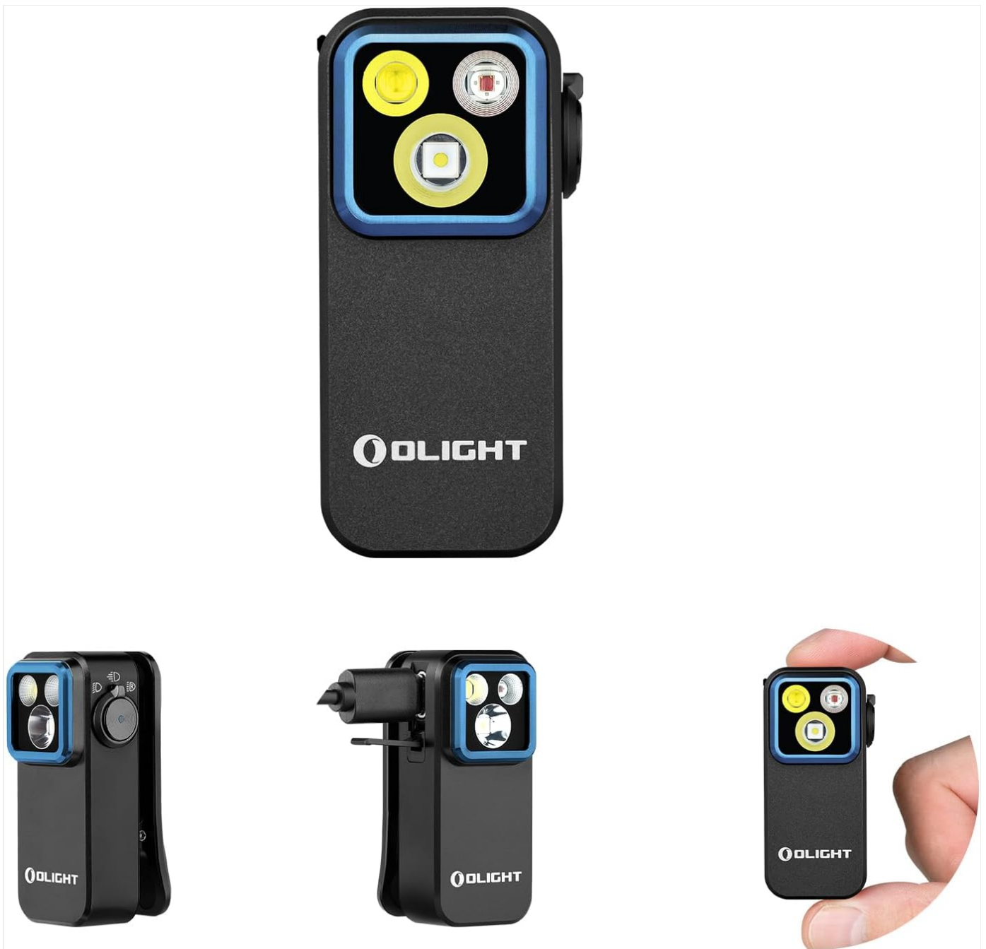
Image: Various views of the Oclip Pro, showcasing its design and compact form factor.