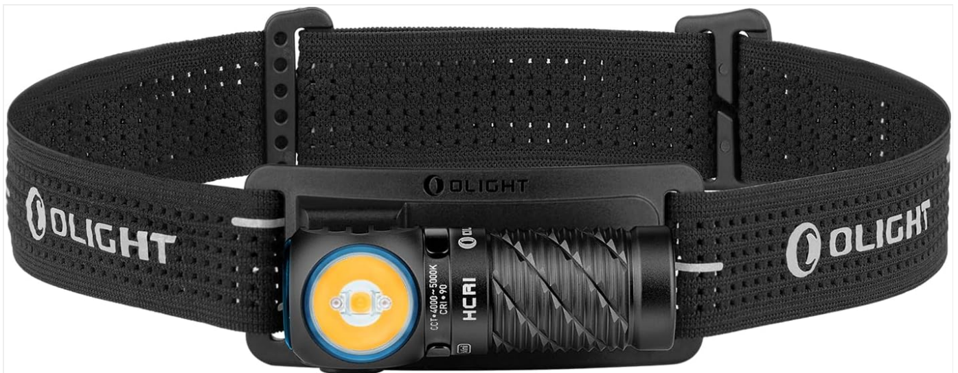
Image: The OLIGHT Perun 3 Mini headlamp attached to its elastic headband, ready for use.

This manual provides detailed instructions for the safe and effective use of your OLIGHT Perun 3 Mini rechargeable headlamp and OLIGHT Oclip Pro EDC flashlight. Please read this manual thoroughly before operation and retain it for future reference.