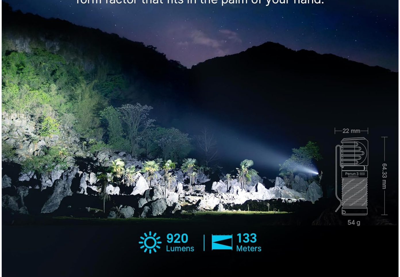
Image: Key specifications of the Perun 3 Mini, highlighting its compact size, lumen output, and beam distance.

Need a serious light without the bulk? The Perun 3 Mini delivers up to 920 lumens in a light form factor that fits in the palm of your hand.