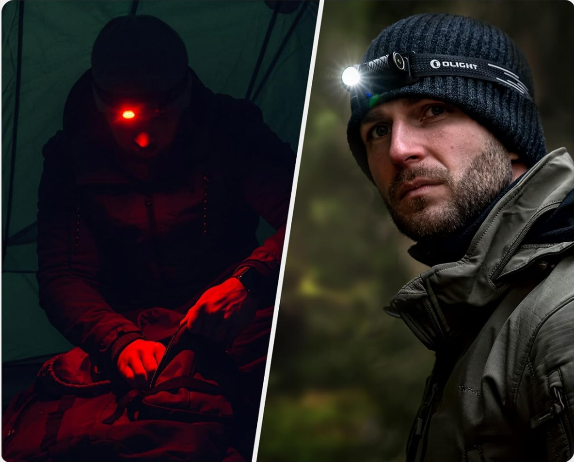
Image: The Perun 3 Mini in use, demonstrating both white light for general tasks and red light for night vision preservation.

White light for work and daily routines, red light to preserve night vision