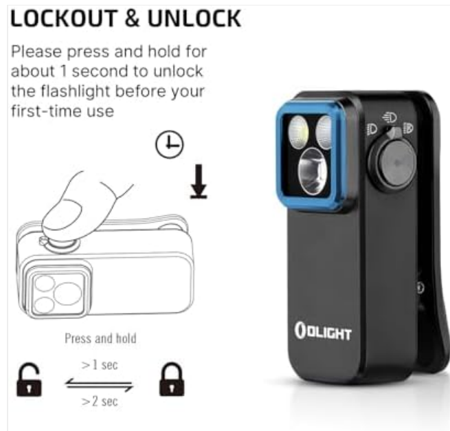
Image: Instructions for unlocking the Oclip Pro by pressing and holding the button for 1 second.