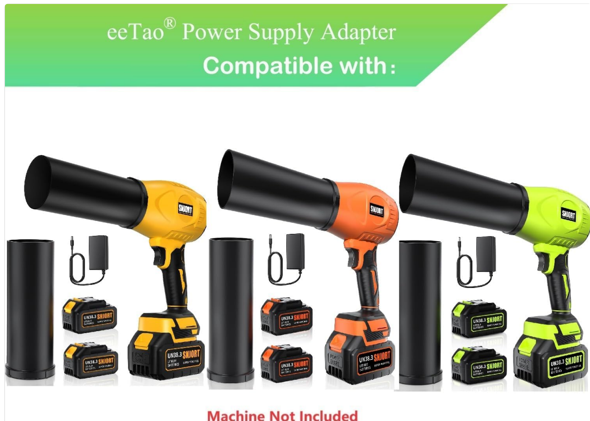
Image 1.1: The eeTao replacement charger shown alongside various SNJORT S7MAX Max+ cordless leaf blowers and

This manual provides instructions for the safe and efficient use of your eeTao Replacement Charger. This power supply adapter is designed to charge 21V UN38.3 LITHIUM batteries for SNJORT S7MAX Max+ Cordless Leaf Blowers.