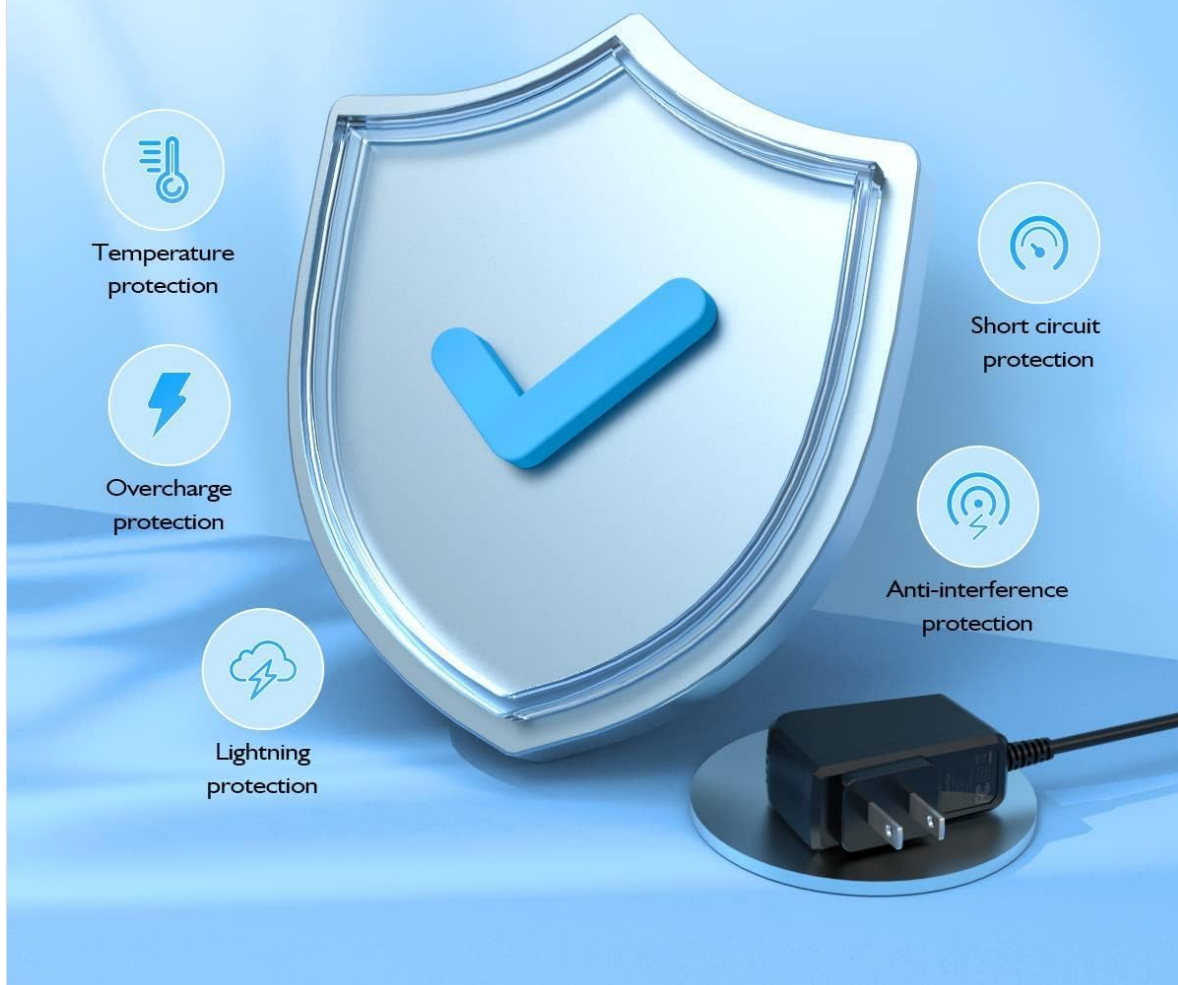
Image 2.1: An illustration highlighting the multiple security protection features integrated into the eeTao charger, such as temperature, overcharge, lightning, short circuit, and anti-interference protection, ensuring safe charging.

Multiple professional protection, so that fast charge more safe