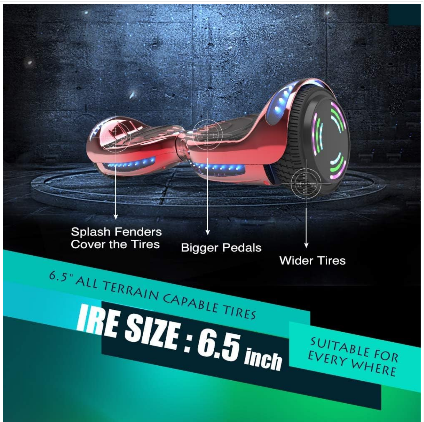
Figure 4: Detailed view of the 6.5-inch all-terrain wheels and footpads.