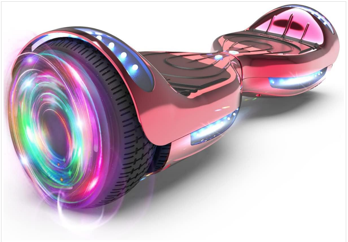
Figure 1: SUNDERWELL Electric Hoverboard Model LBW12A (Chrome Red)