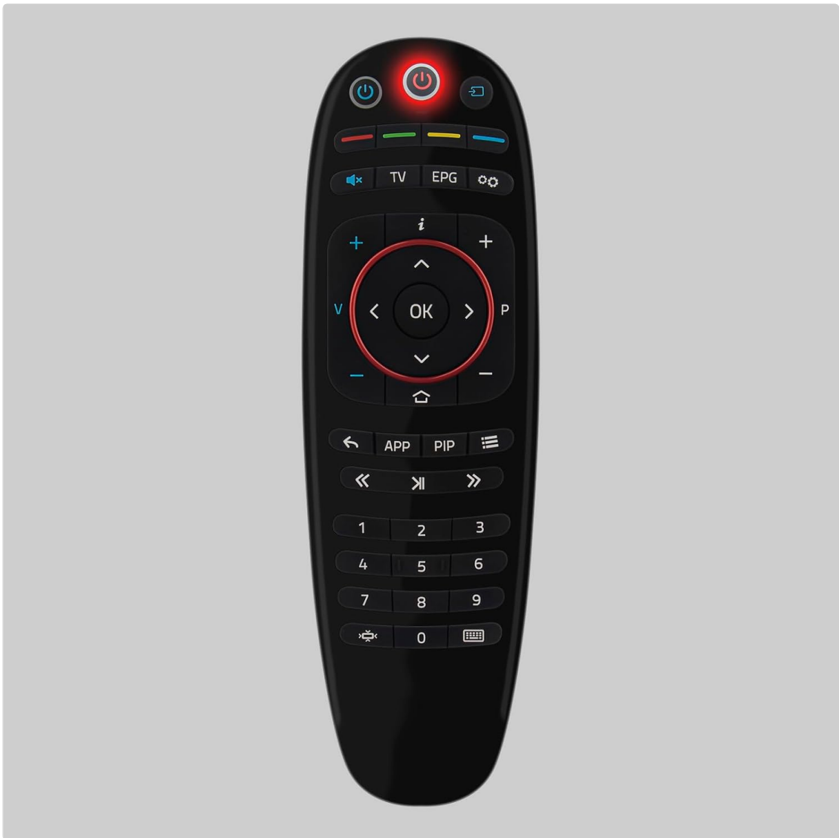
Figure 3.2: Remote control button layout. Familiarize yourself with the button positions for common functions.