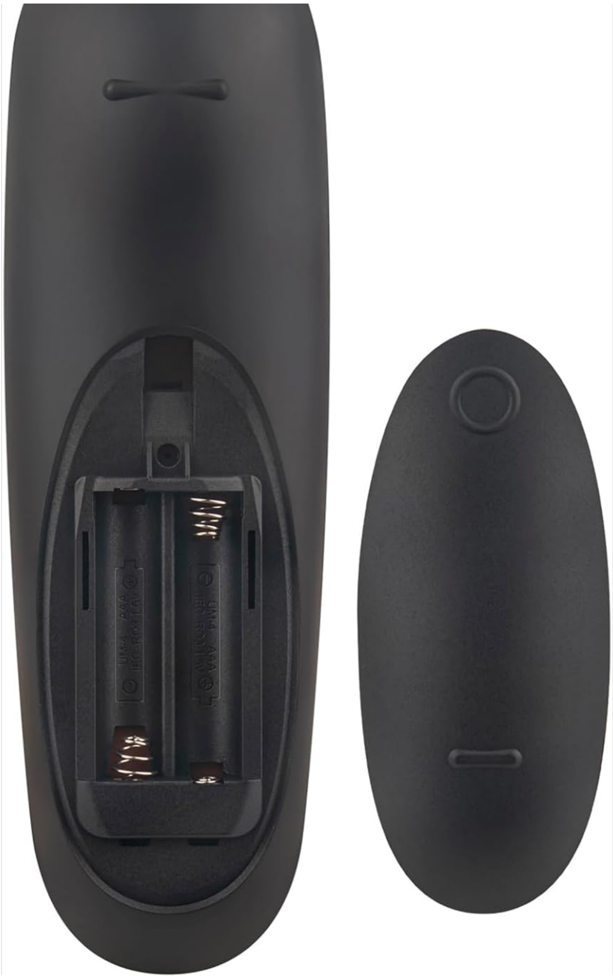
Figure 2.1: Battery compartment with batteries. Ensure correct polarity when inserting batteries.