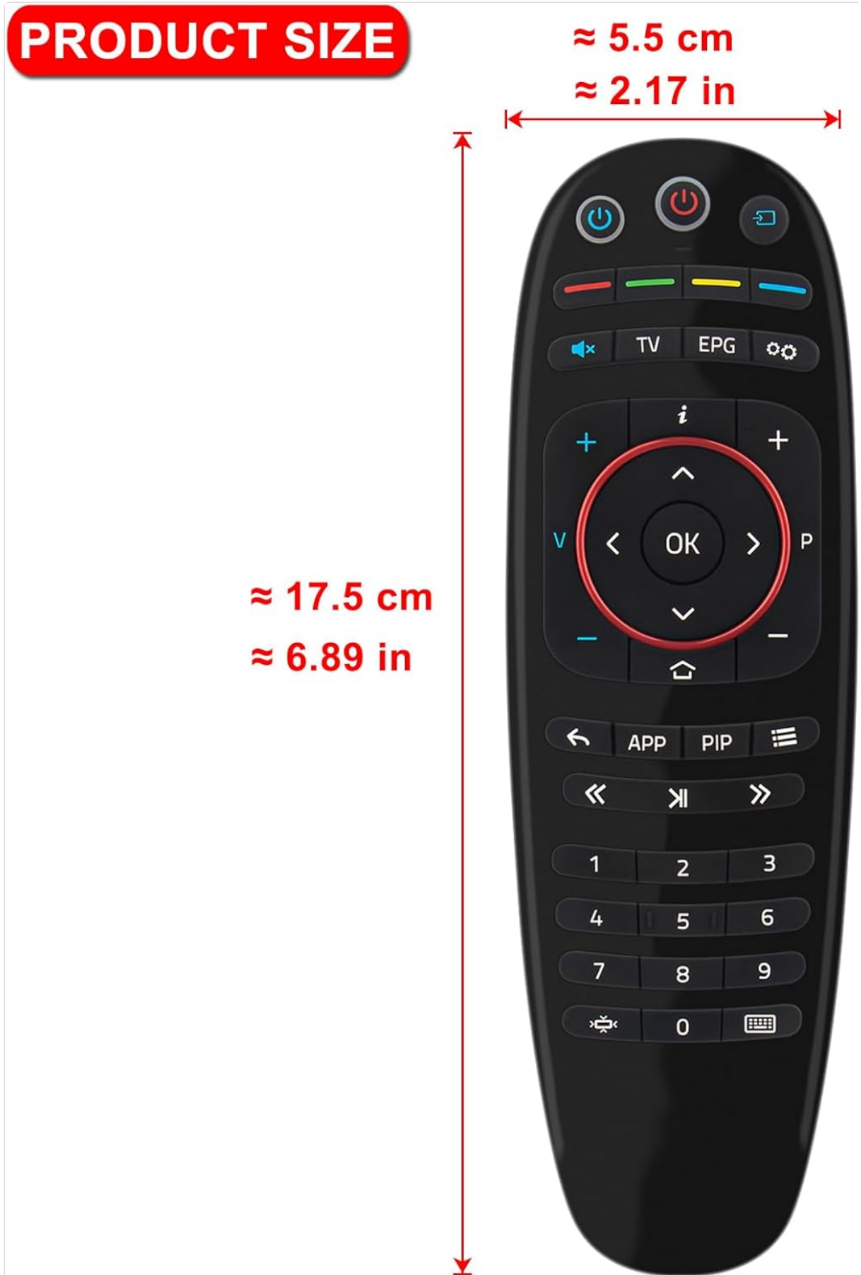
Figure 6.1: Remote control dimensions. Approximately 17.5 cm (6.89 in) long and 5.5 cm (2.17 in) wide.