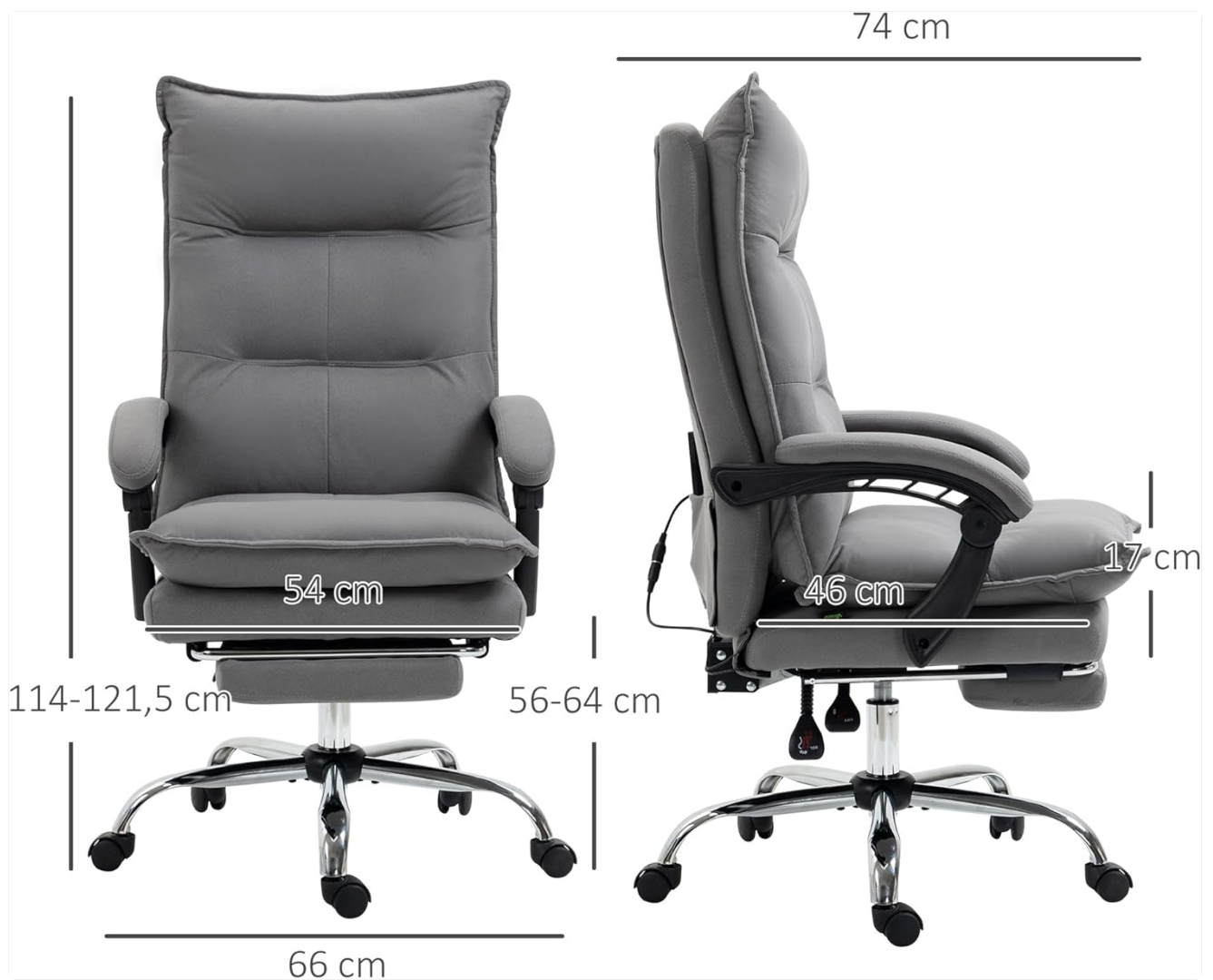
Diagram illustrating the chair's dimensions.