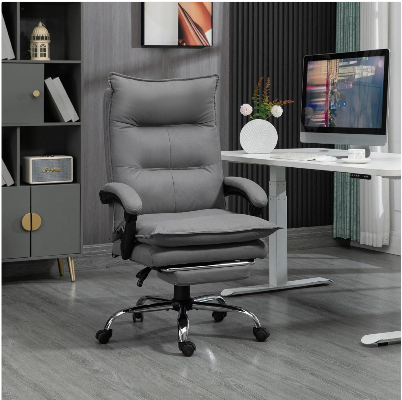
The Vinsetto Heated Massage Office Chair, designed for comfort and support.