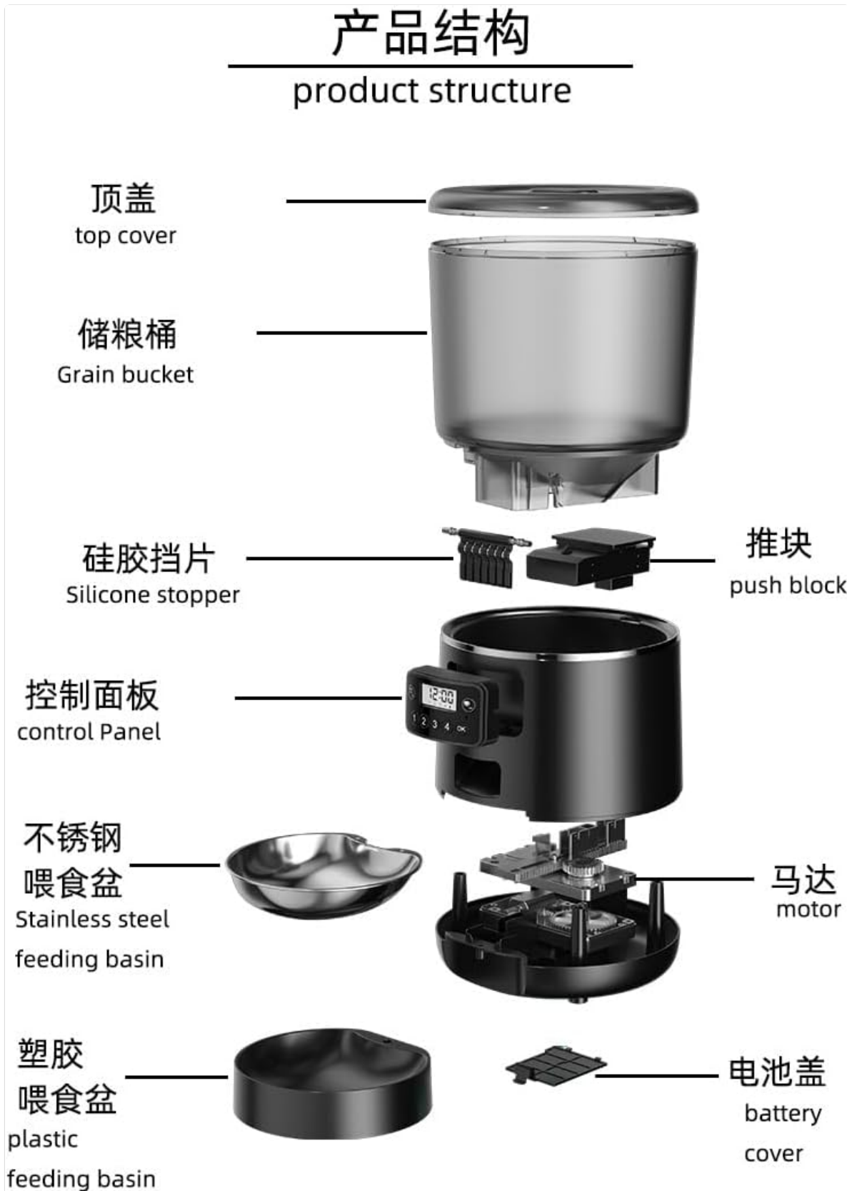
Image 2.1: Exploded view illustrating the various components of the pet feeder, including the top cover, grain bucket, control panel, and feeding basins.