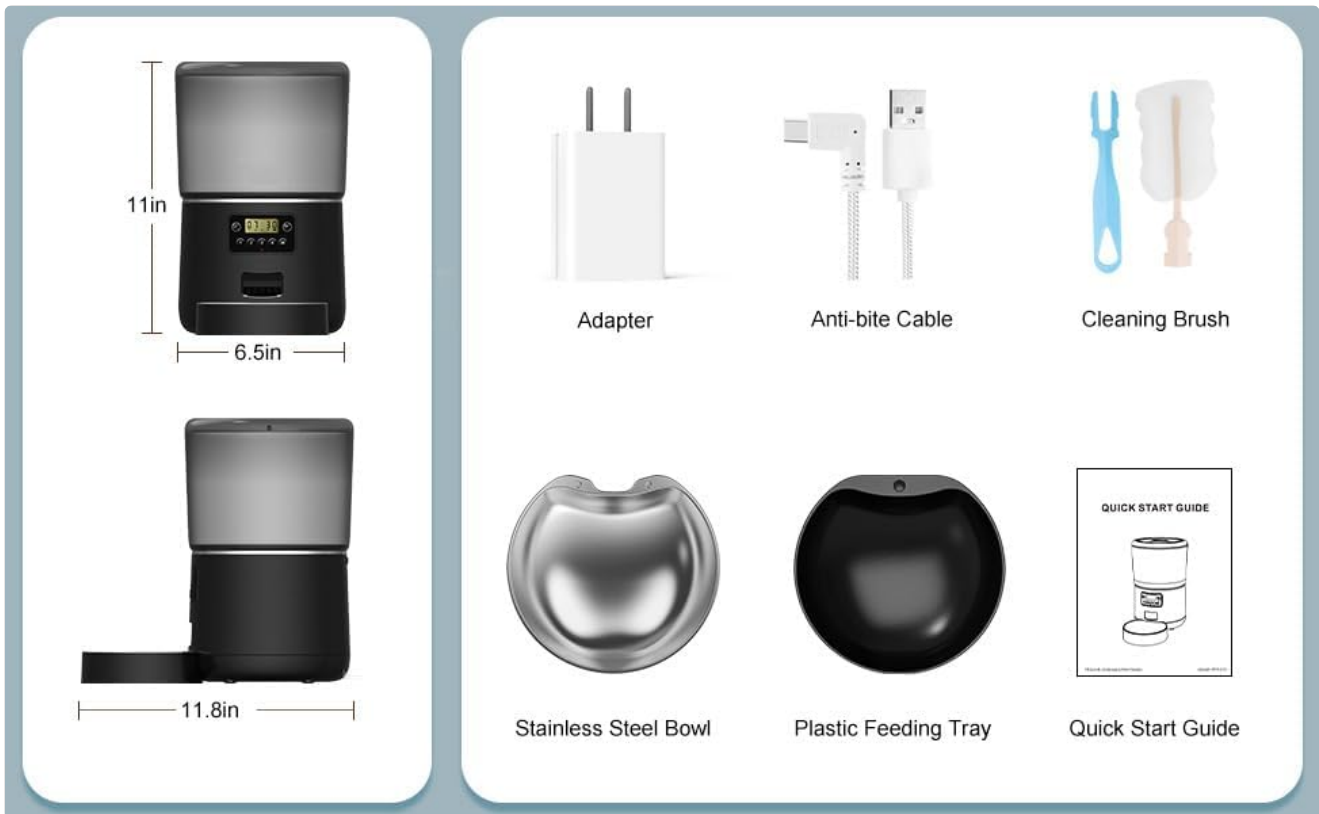
Image 2.2: A visual representation of the accessories included with the pet feeder, such as the power adapter, cable, cleaning brush, and two types of feeding bowls.