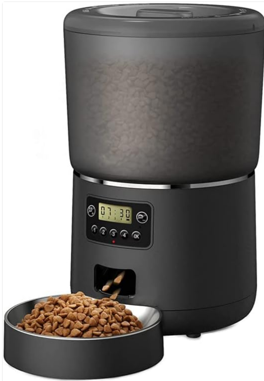
Image 1.1: The Generic Automatic Pet Feeder PFF010, showing its main components and a full food bowl.