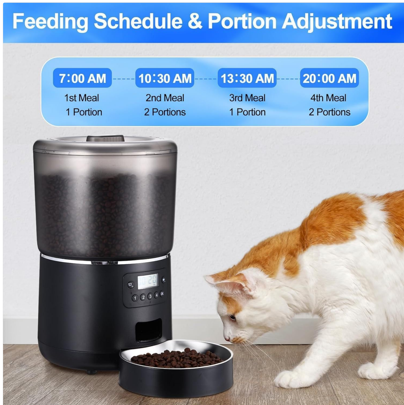
Image 4.1: Example of a programmed feeding schedule, showing four meals at different times with varying portion sizes.

The feeder allows for up to 4 daily meals. Each meal can have a customized portion size.