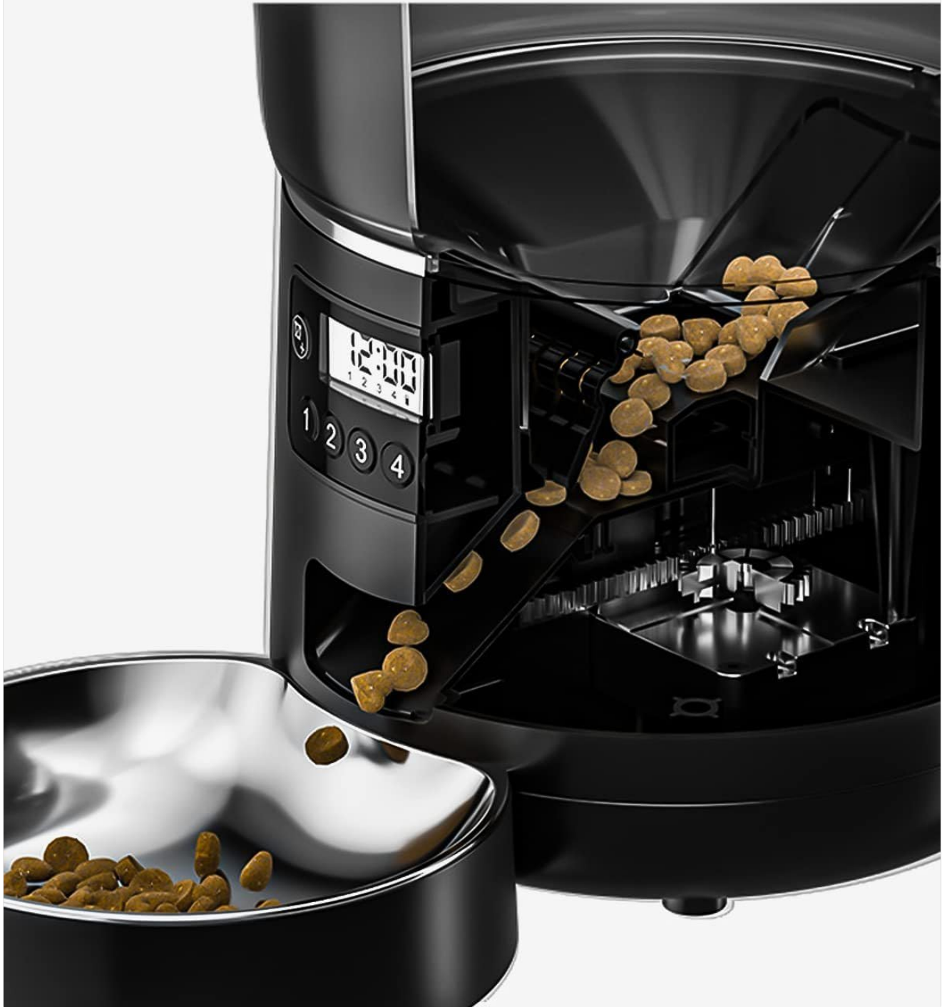
Image 6.1: The internal 45-degree steep slope design, engineered to ensure smooth food delivery and prevent jamming.

Smooth food delivery, No food jams, Safe feeding