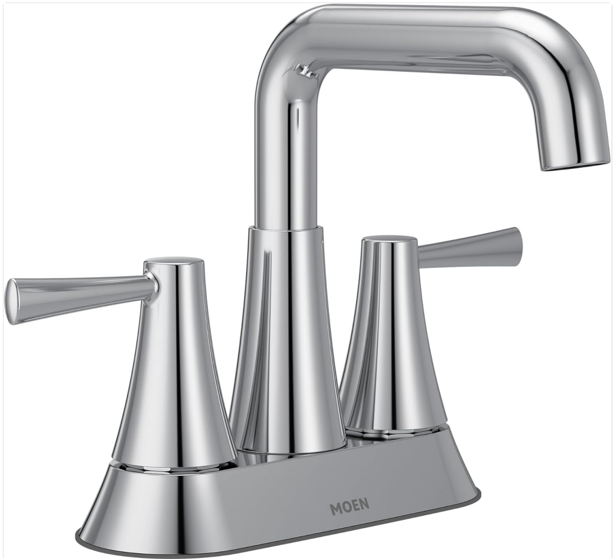
Image 1: Moen Ronan Chrome Two-Handle Centerset Bathroom Faucet with its components.