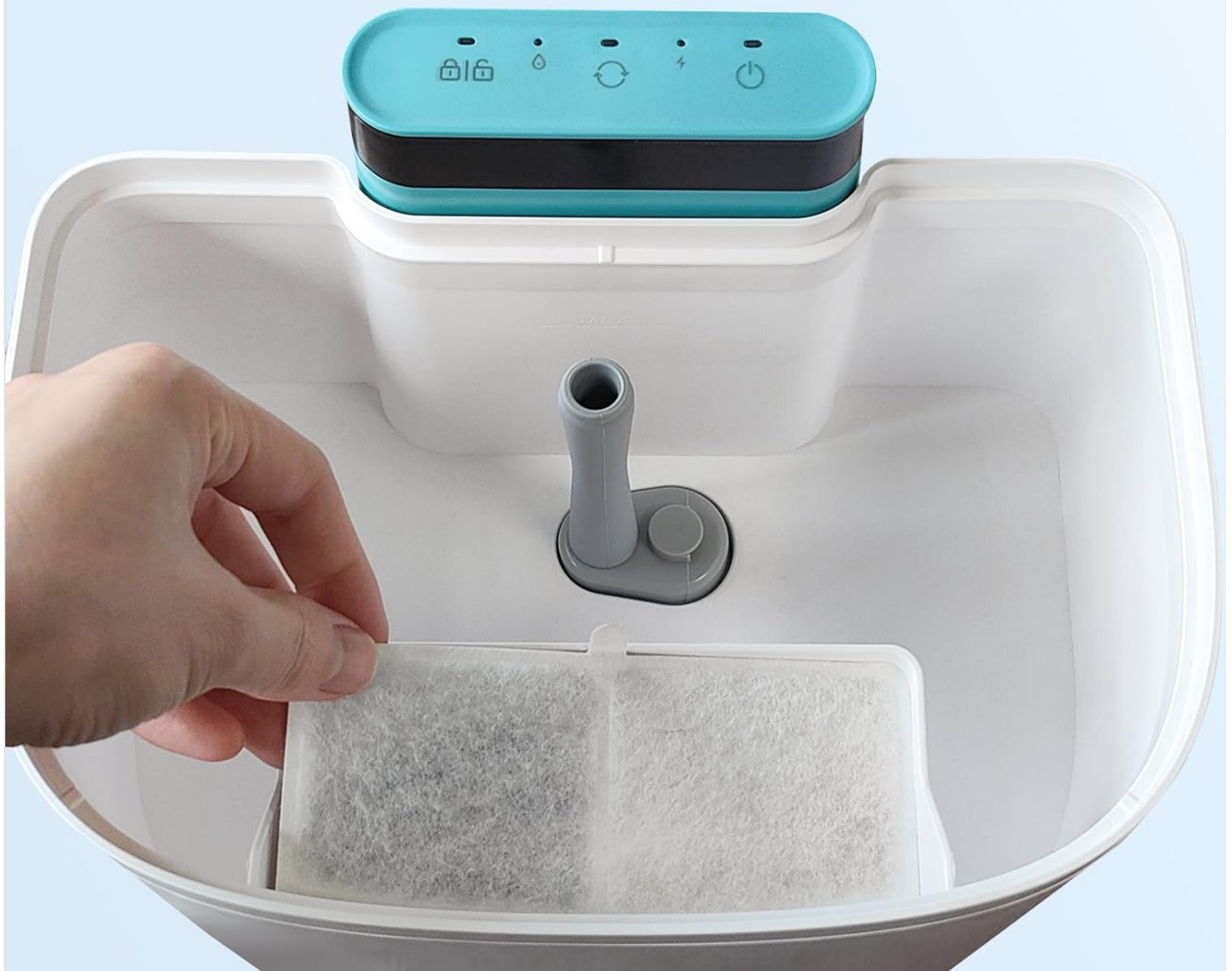
Figure 4: Filter Replacement. The image shows a hand carefully removing or inserting a filter into the fountain's filter slot. The accompanying text advises replacing the filter within 2-3 weeks for optimal performance.