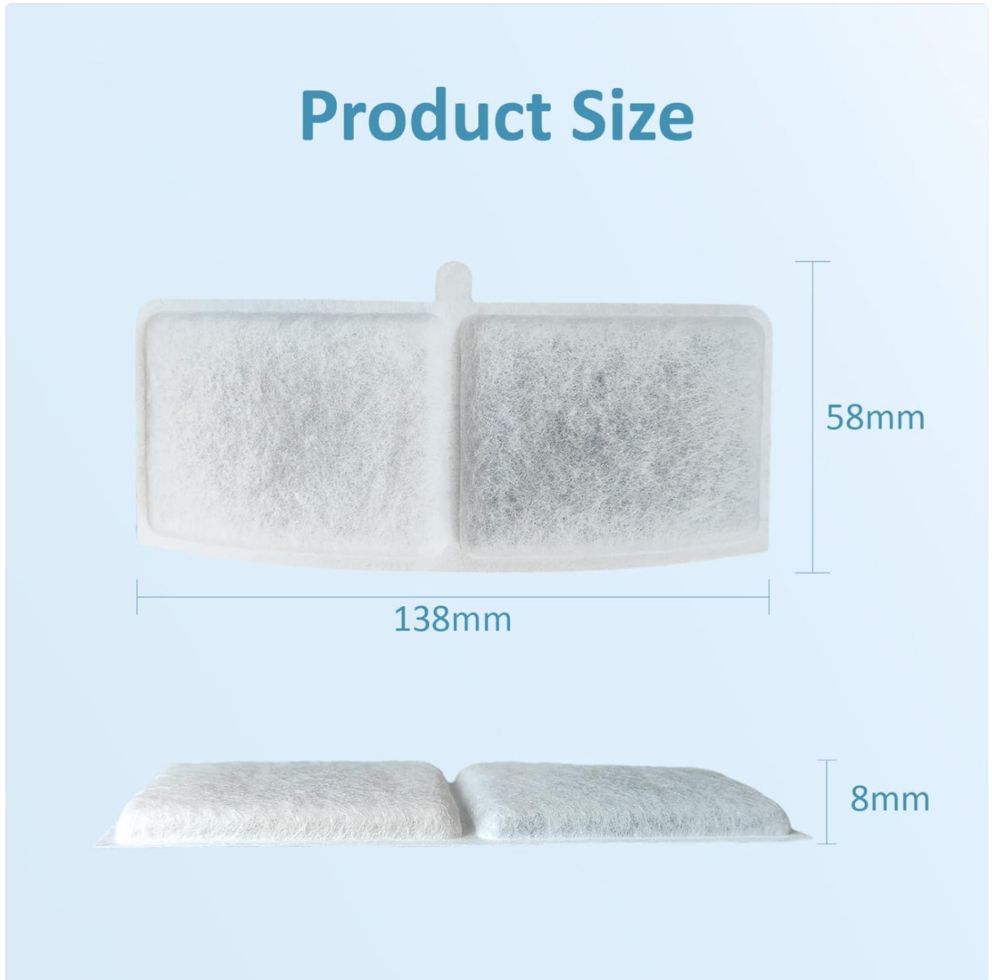
Figure 5: Product Dimensions. This image provides a detailed view of the filter's measurements, indicating a length of 138mm, a width of 58mm, and a thickness of 8mm.

Key specifications for the PET LAYSON M1/M1 Pro compatible replacement filters: