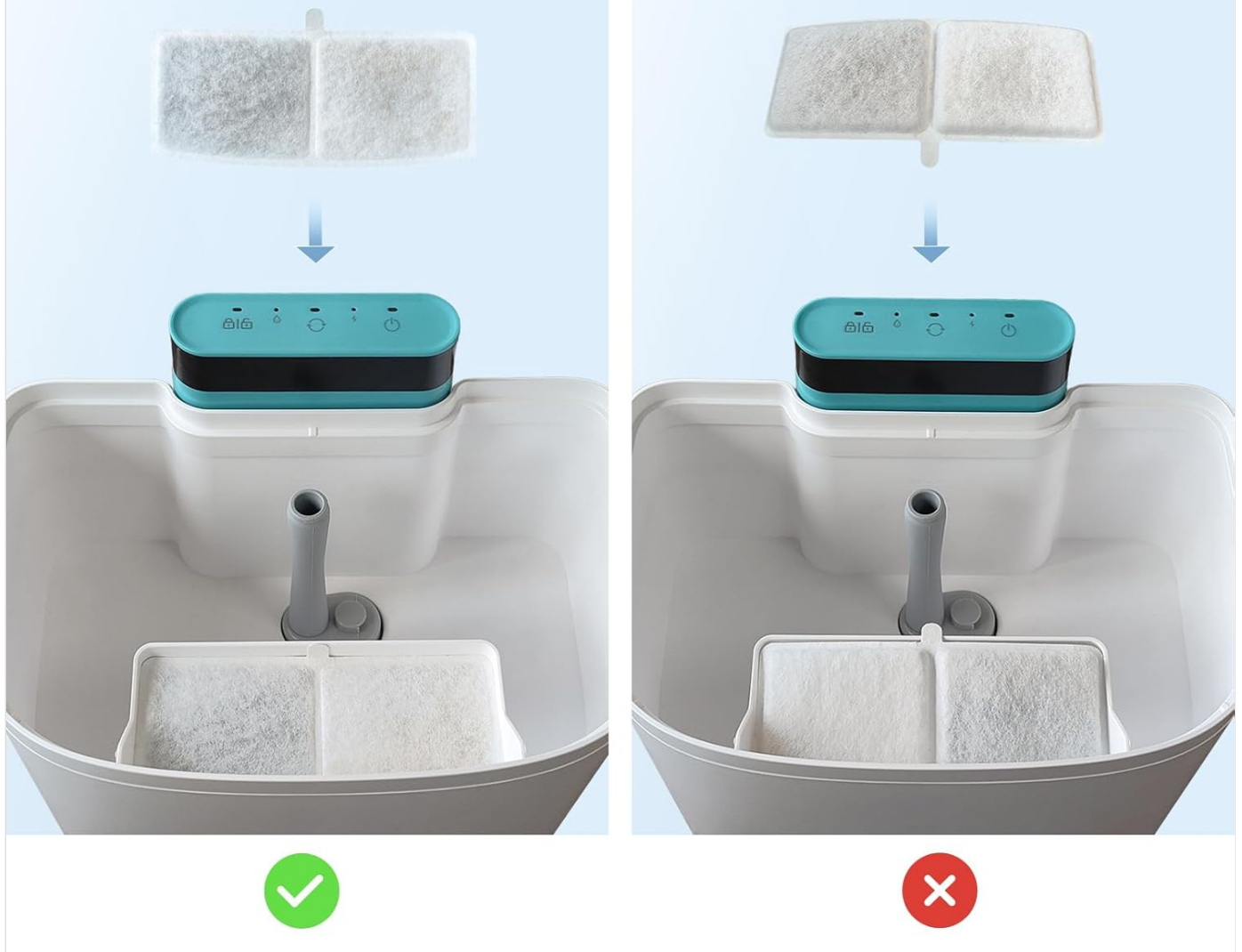
Figure 2: Correct Filter Orientation. This image displays two setups: one with the filter correctly installed (left, indicated by a green checkmark) and one with the filter incorrectly installed (right, indicated by a red 'X'). Ensure the filter is placed with the correct side facing up as shown in the 'correct' example.

After installation, refill the fountain with fresh water and plug it back in. The fountain is now ready for use with the new filter.