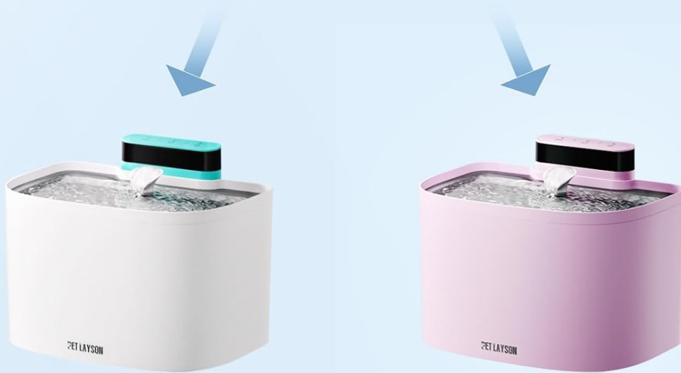
Figure 6: Compatible Models. This image clearly indicates that the filter is compatible with the PET LAYSON M1 and M1 Pro pumpeless cat water fountains, both 2.6L/88oz capacity, shown in white and pink variations.