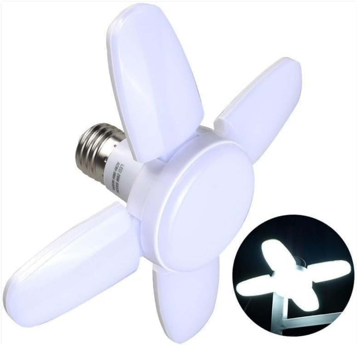
Figure 3: The lamp with its LED petals fully unfolded, demonstrating its wide illumination capability. The central light source is also visible.

Warning: Do not install in enclosed fixtures as this may reduce the lamp's lifespan due to heat accumulation. Ensure adequate ventilation.