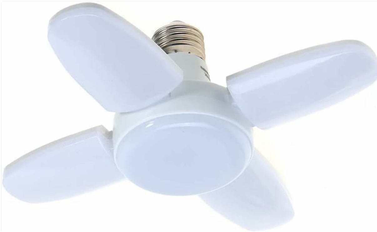
Figure 1: The Generic 28W Foldable LED Petal Lamp, showcasing its compact folded state and its fully expanded, illuminated form. This image illustrates the product's design versatility.

This manual provides comprehensive instructions for the safe and efficient use of your Generic 28W Foldable LED Petal Lamp, Model LZ001. This innovative lamp features four adjustable LED panels and a central light, designed to provide versatile and energy-efficient illumination. It operates at 28W, emitting a 6500K cool white light, and is compatible with standard E27 sockets and 110/220V electrical systems. Please read this manual thoroughly before installation and operation.