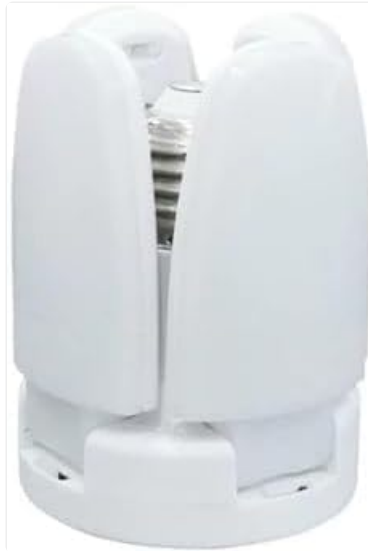
Figure 2: The lamp in its folded configuration, ready for installation into an E27 socket. This compact form allows for easy handling.