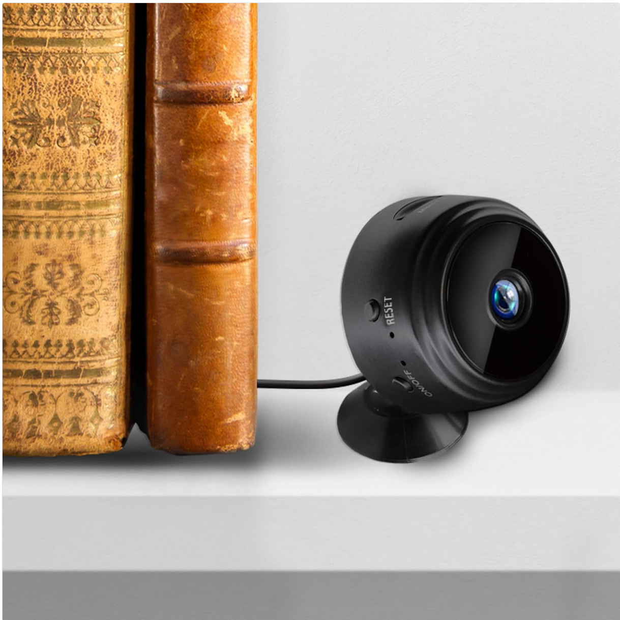
Figure 3.5: The compact design of the camera allows it to blend discreetly into various indoor environments, such as on a bookshelf.