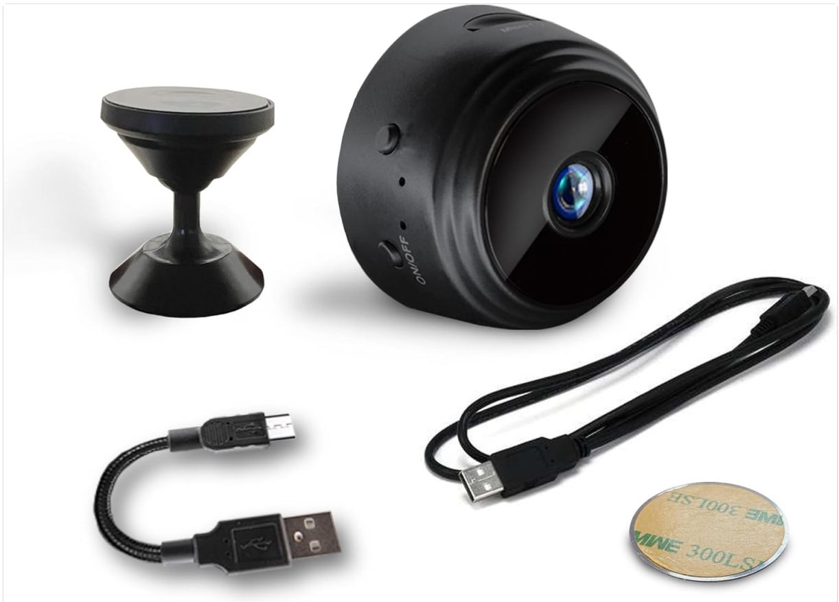
Figure 2.1: The XTREME Mini Security Camera shown with its included stand and charging cable. A Micro SD card is not included and must be purchased separately for local recording.