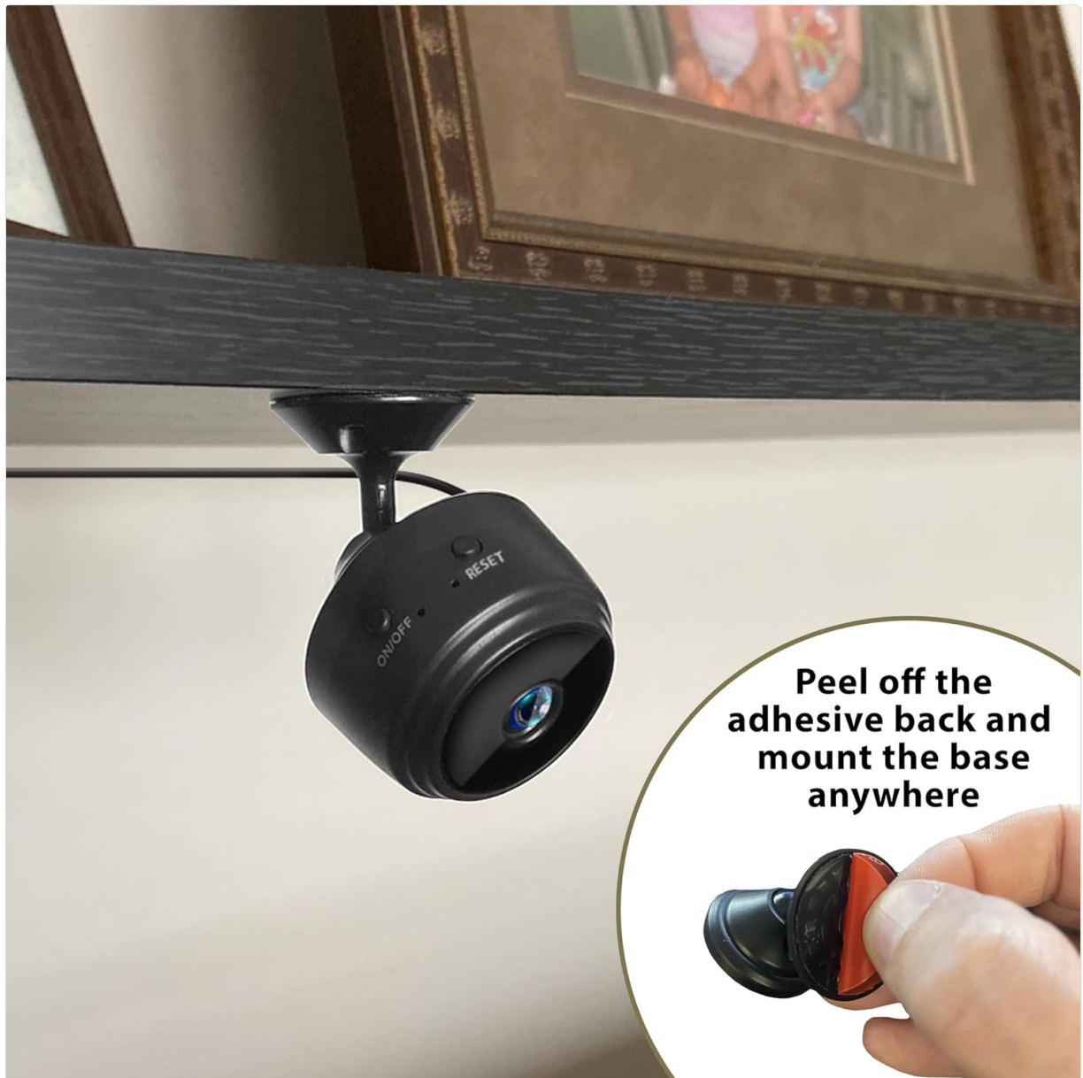
Figure 3.4: The camera's stand can be mounted using an adhesive back, allowing for secure placement on various surfaces like shelves or walls.