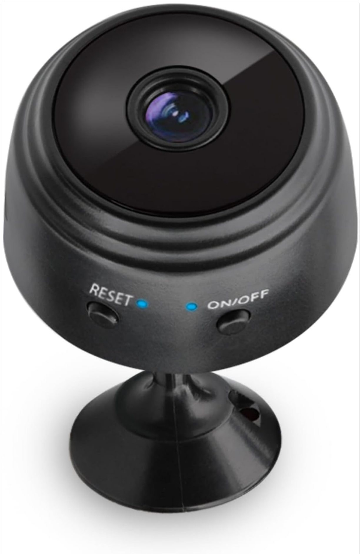
Figure 3.1: Front view of the XTREME Mini Security Camera. Visible components include the camera lens, Reset button, and On/Off button with indicator lights.