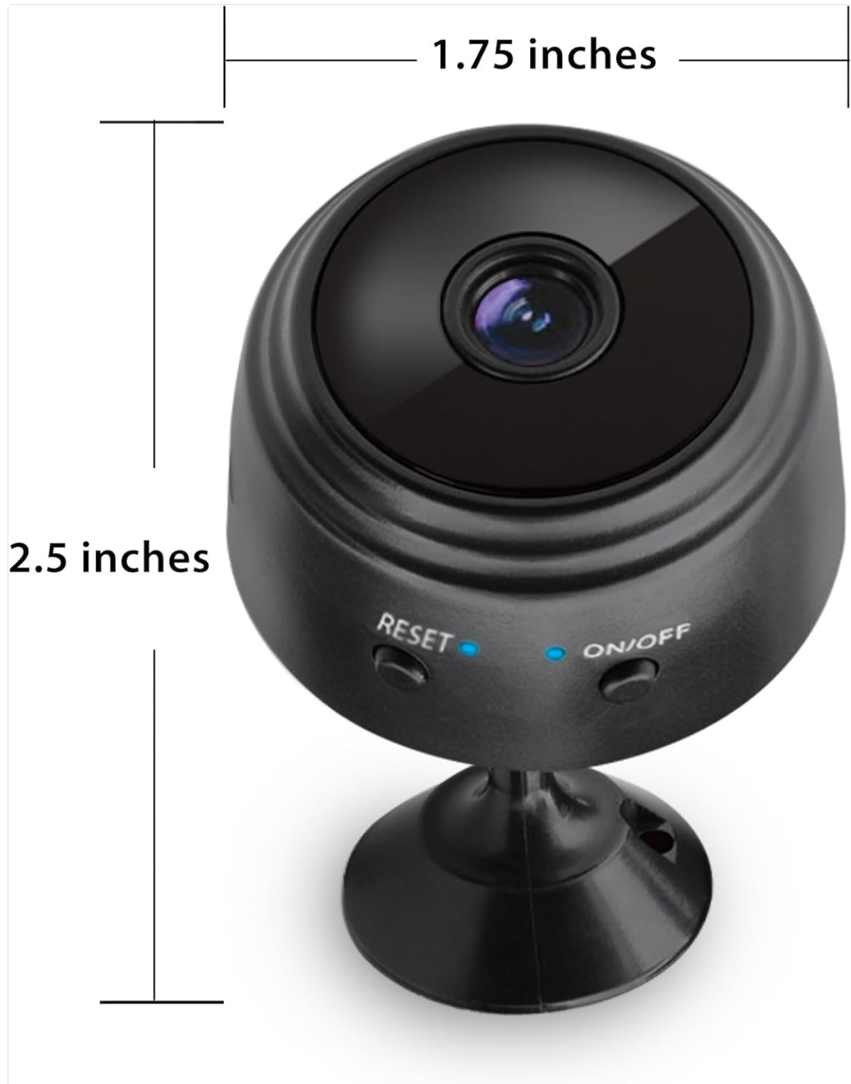
Figure 3.2: The XTREME Mini Security Camera measures approximately 2.5 inches in height and 1.75 inches in width, indicating its compact size.

The camera features a compact design, measuring approximately 2.8 x 2.6 x 4.6 inches (L x W x H) and weighing 4.8 ounces. It comes with a stand that allows for versatile placement on flat surfaces or wall mounting.