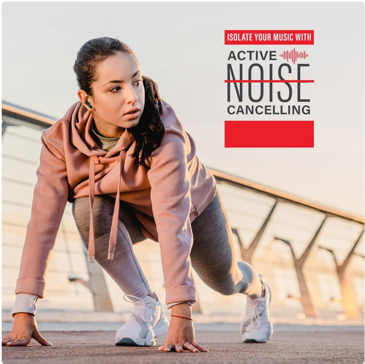
Image: A woman in athletic wear stretching outdoors while wearing Xtreme Bluetooth Earbuds. The image features text overlay "ISOLATE YOUR MUSIC WITH ACTIVE NOISE CANCELLING", emphasizing the ANC feature for focused listening during activities.