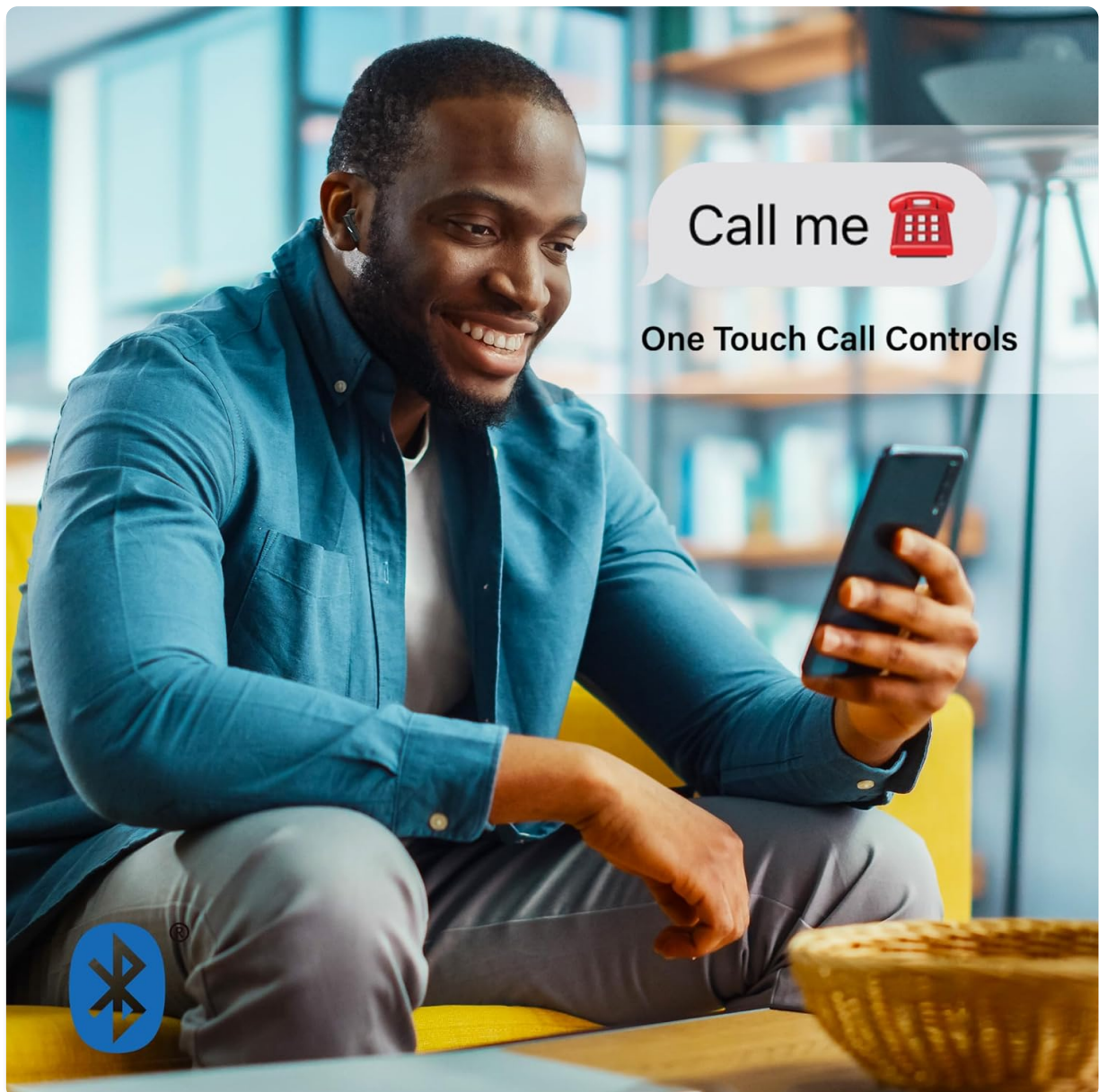
Image: A man smiling and looking at his phone while wearing Xtreme Bluetooth Earbuds. A speech bubble above his head says "Call me" with a phone icon, illustrating the one-touch call controls feature.