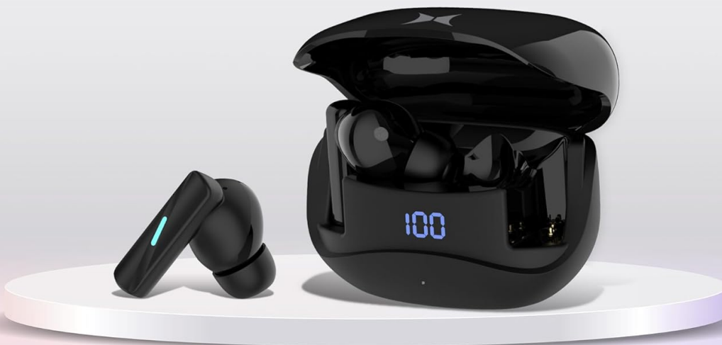
Image: Xtreme Bluetooth Earbuds and Charging Case. The image shows the earbuds resting in their open charging case, which features an LED display indicating '100' for full charge. Key features like Bluetooth connectivity, playtime, True Wireless Stereo, comfort design, play/pause & calls, and charging case functionality are highlighted around the product.

Charging Case Recharge earbuds on-the-go