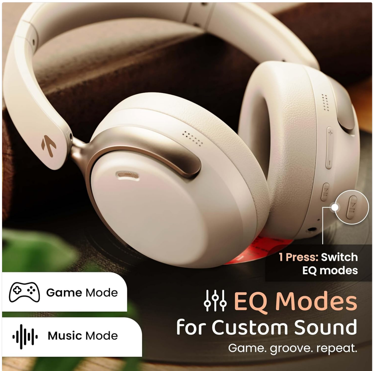
Image: GOBOULT Soniq headphones illustrating the EQ modes for custom sound, including Game Mode and Music Mode.