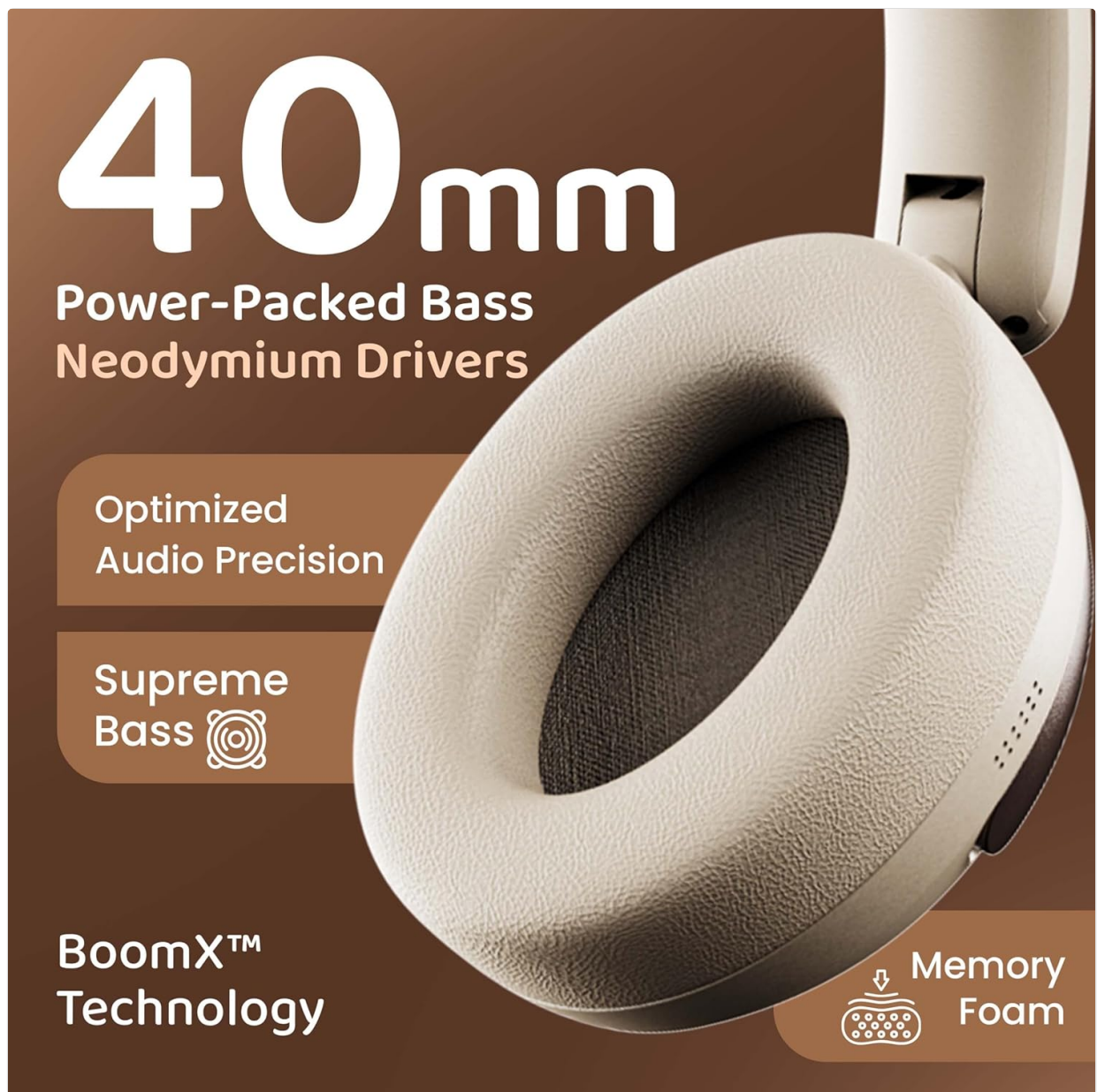
Image: Close-up of the GOBOULT Soniq headphone earcup highlighting the 40mm power-packed bass neodymium drivers with BoomX™ Technology and Memory Foam.