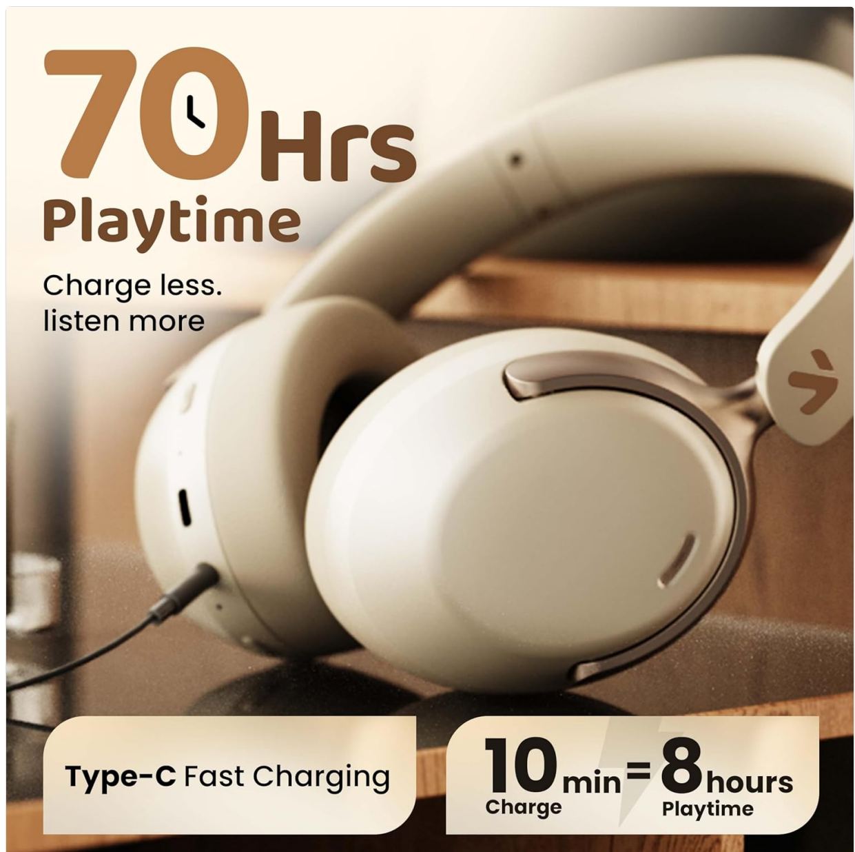
Image: GOBOULT Soniq headphones connected via Type-C cable, illustrating 70 hours playtime and fast charging capability.