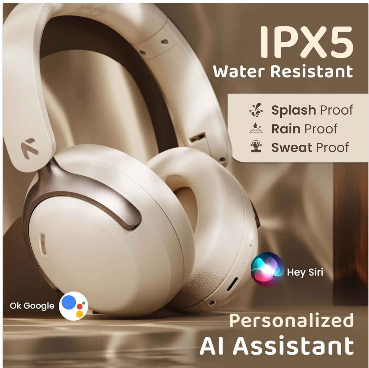
Image: GOBOULT Soniq headphones with icons for Google Assistant and Siri, indicating personalized AI assistant support.