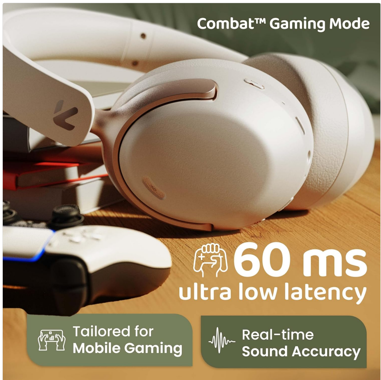
Image: GOBOULT Soniq headphones highlighting Combat™ Gaming Mode with 60ms ultra-low latency, tailored for mobile gaming and real-time sound accuracy.