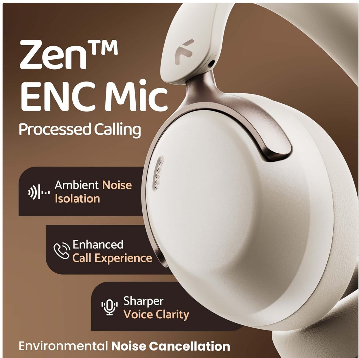
Image: Close-up of the GOBOULT Soniq headphone earcup highlighting the Zen™ ENC Mic for processed calling, ambient noise isolation, enhanced call experience, and sharper voice clarity.