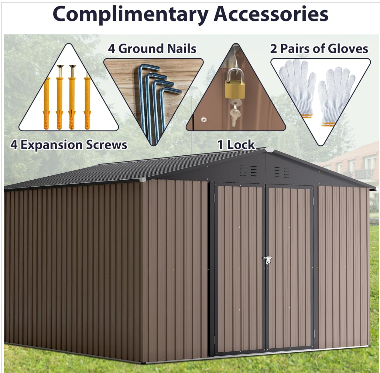
Image 3.1: Included accessories: 4 ground nails, 4 expansion screws, 2 pairs of gloves, and 1 padlock. These items are provided to assist with assembly and security.

Before beginning assembly, verify that all components listed below are present and undamaged. If any parts are missing or damaged, contact customer support.