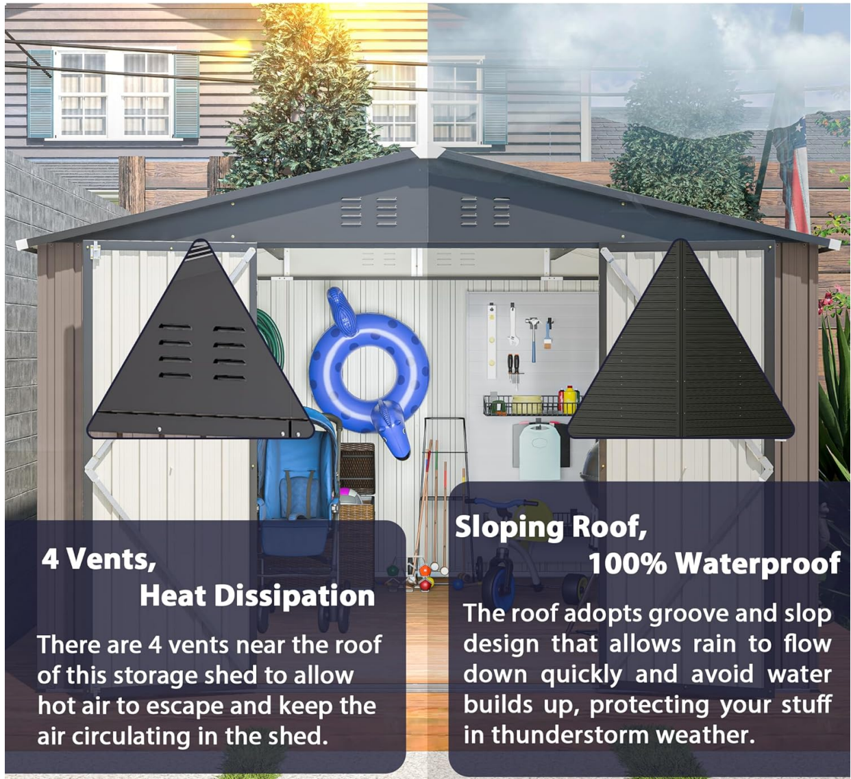
Image 5.2: A visual representation highlighting the shed's four vents for heat dissipation and the sloped roof design, which ensures 100% waterproof protection by allowing rain and snow to drain quickly.