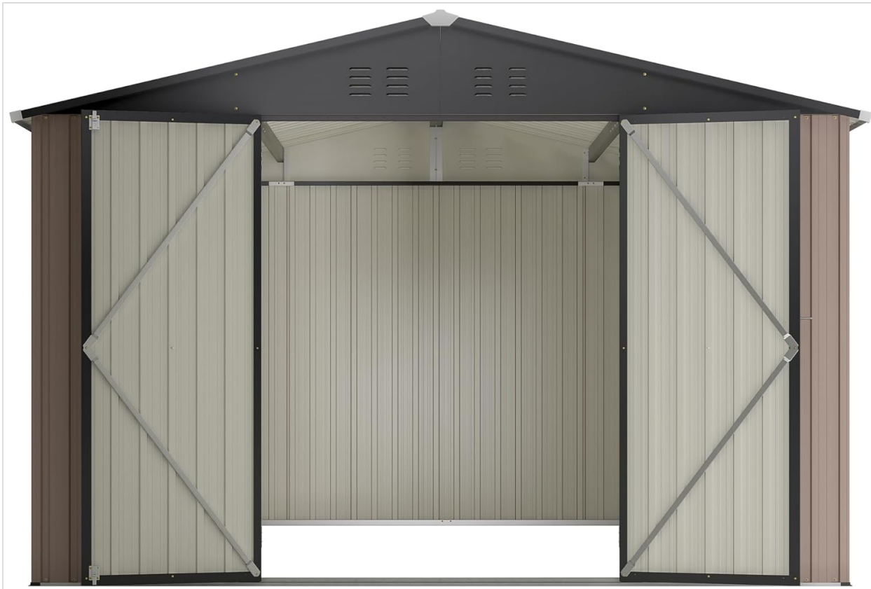
Image 5.1: The shed with its double doors fully open, providing wide access to the interior for storing large items like lawn equipment or bicycles.