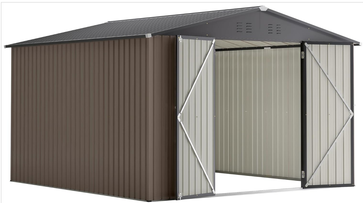
Image 1.1: The cattino 10x10 FT Outdoor Storage Shed, shown with its double doors open, revealing the spacious interior. The shed features a brown exterior with a dark gray sloped roof.

This manual provides comprehensive instructions for the assembly, operation, and maintenance of your cattino 10x10 FT Outdoor Storage Shed. Please read this manual thoroughly before beginning assembly or use to ensure proper installation and safe operation. Retain this manual for future reference.