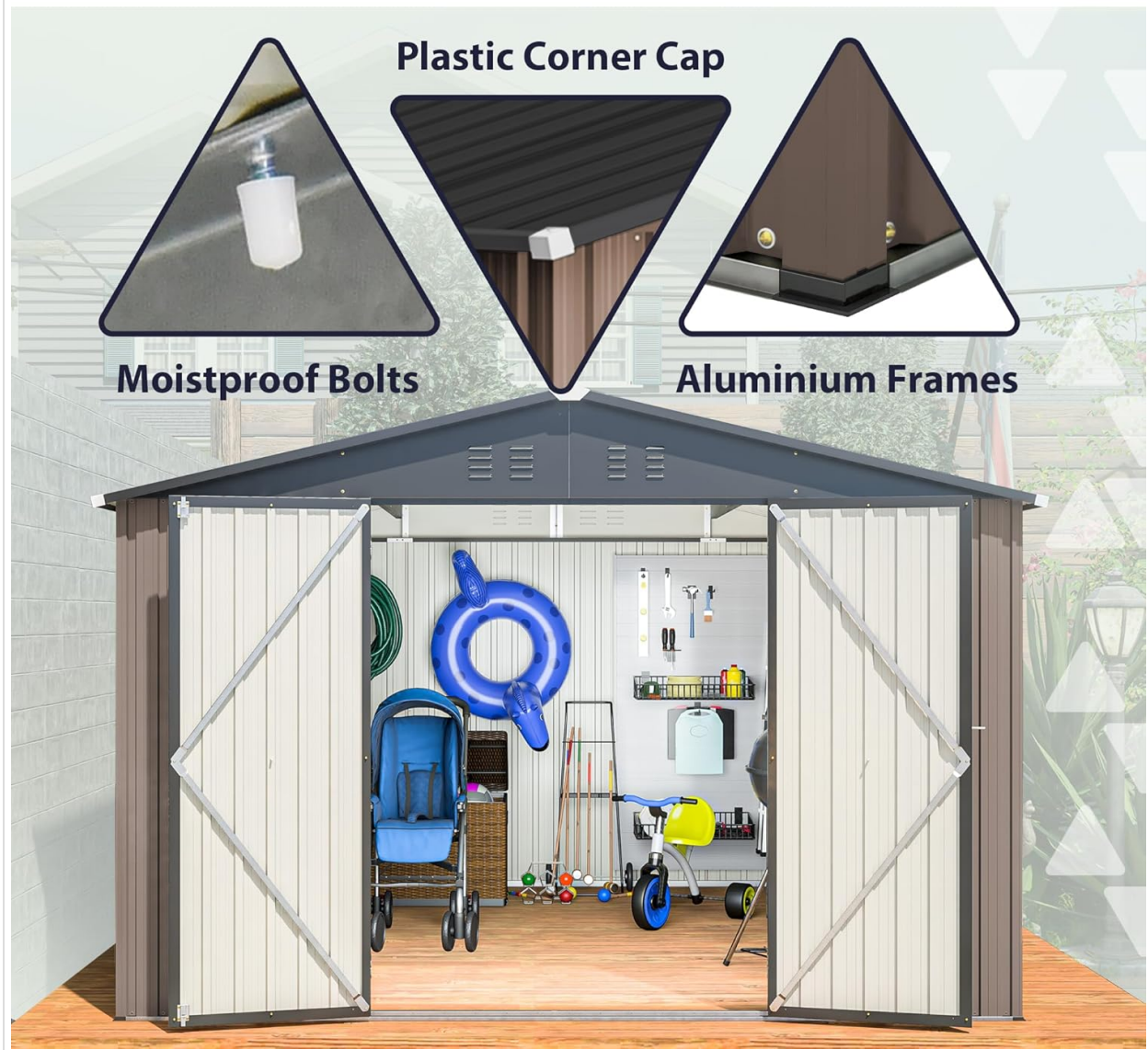
Image 8.1: Close-up details of the shed's construction, highlighting features such as plastic corner caps, moistproof bolts, and aluminum frames, which contribute to its durability and weather resistance.