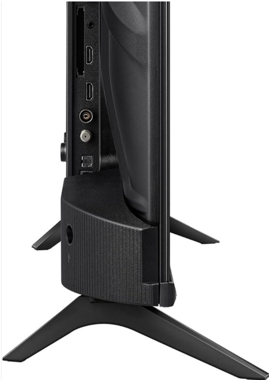
Image: A side profile of the Hisense 40E4QT TV, highlighting the conveniently located side-mounted input ports.