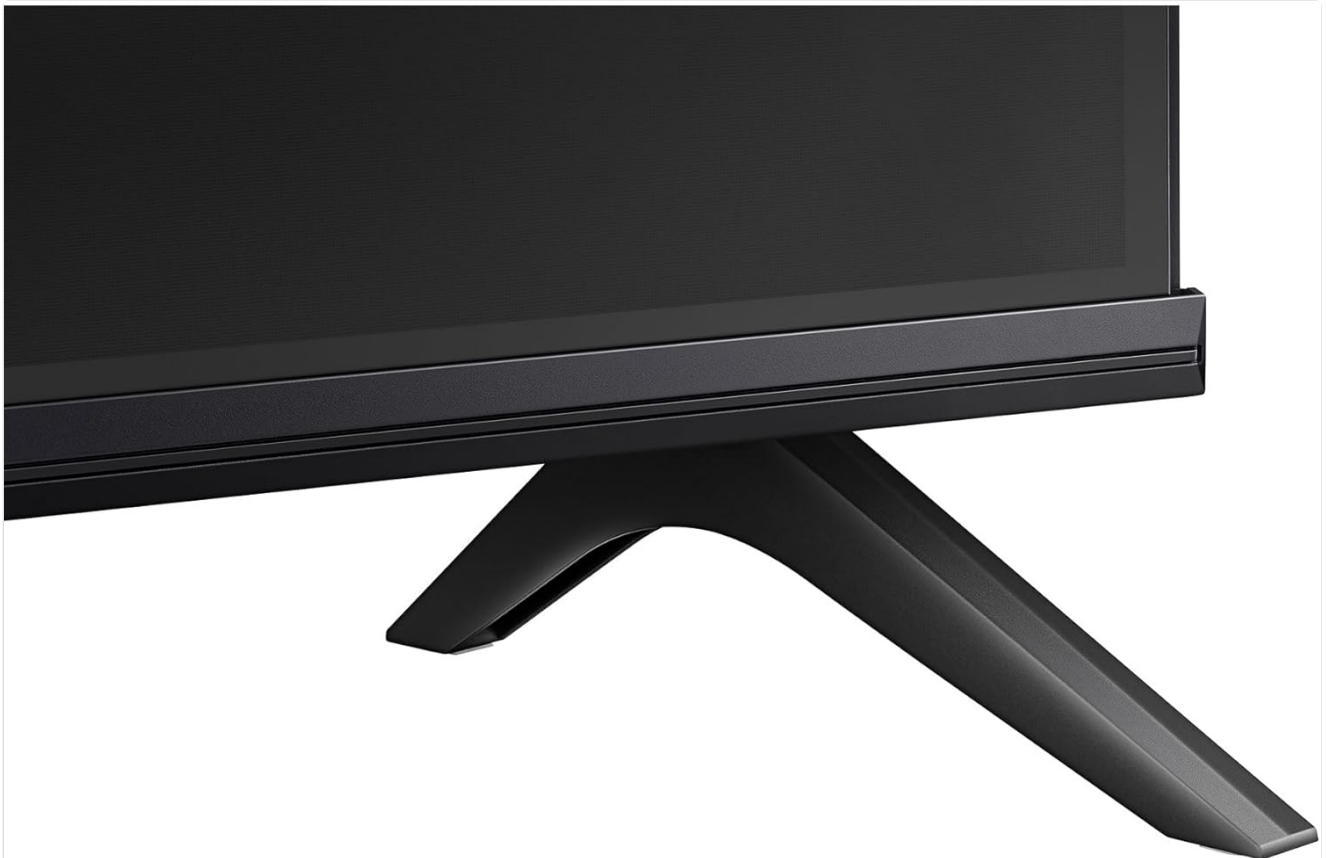
Image: Close-up view of the TV stand, illustrating how it connects to the television base.

Place the TV face down on a soft, clean surface. Align each stand with the corresponding slots on the bottom of the TV and secure them with the provided screws.