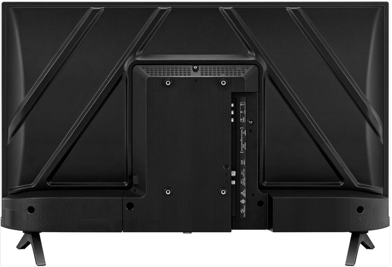
Image: The back panel of the Hisense 40E4QT TV, displaying the arrangement of HDMI, USB, Ethernet, and other input ports.