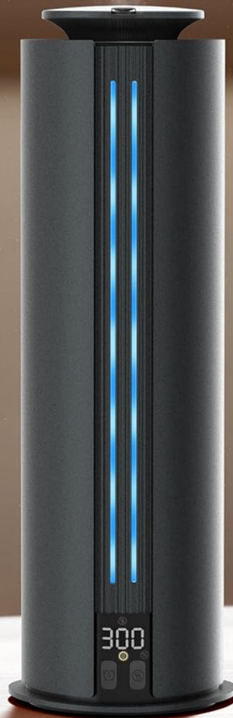
Image: The diffuser showing its button interface for direct control.