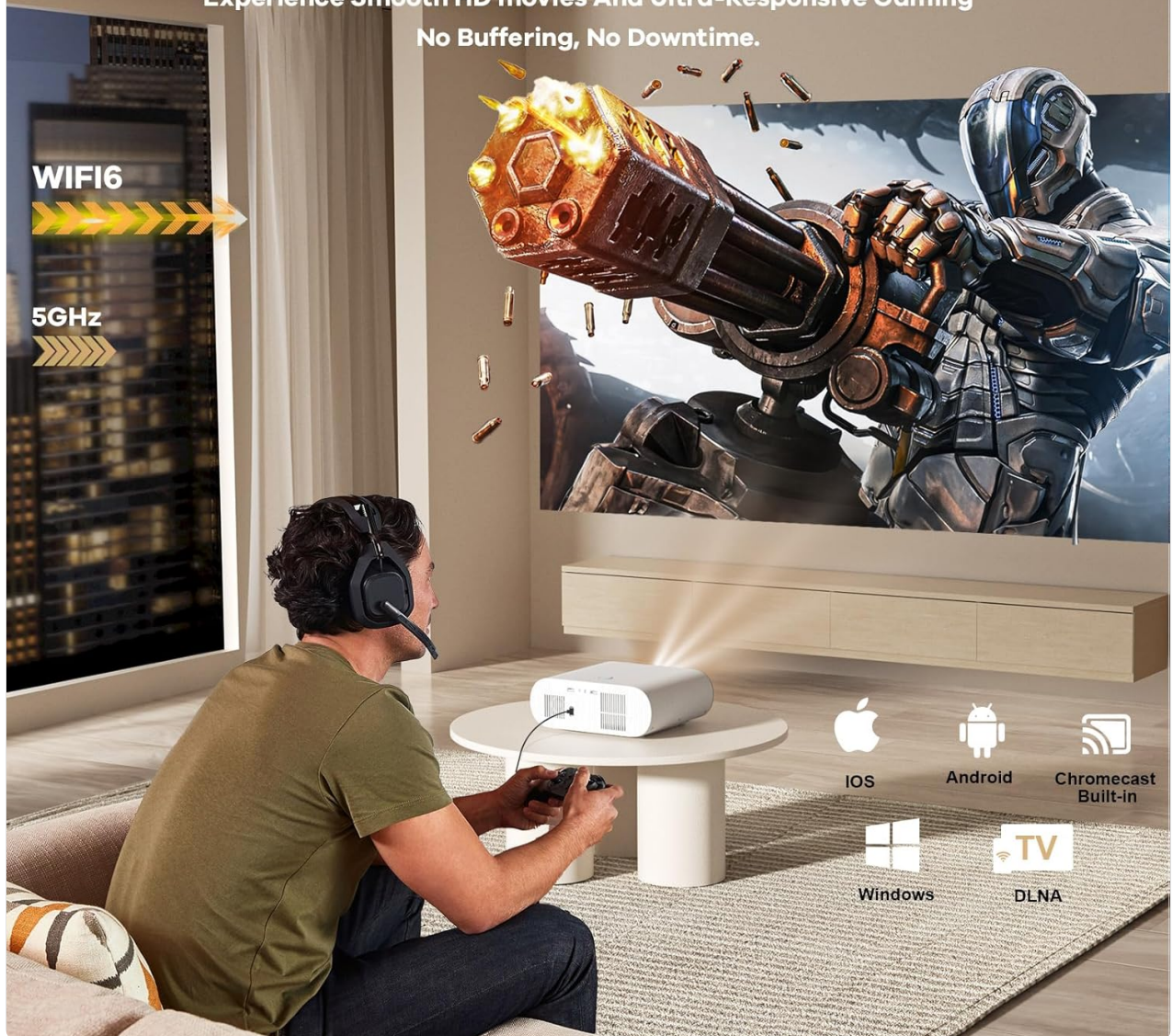
Figure 5.3: Enjoy lag-free streaming and gaming with Wi-Fi 6 and broad device compatibility.