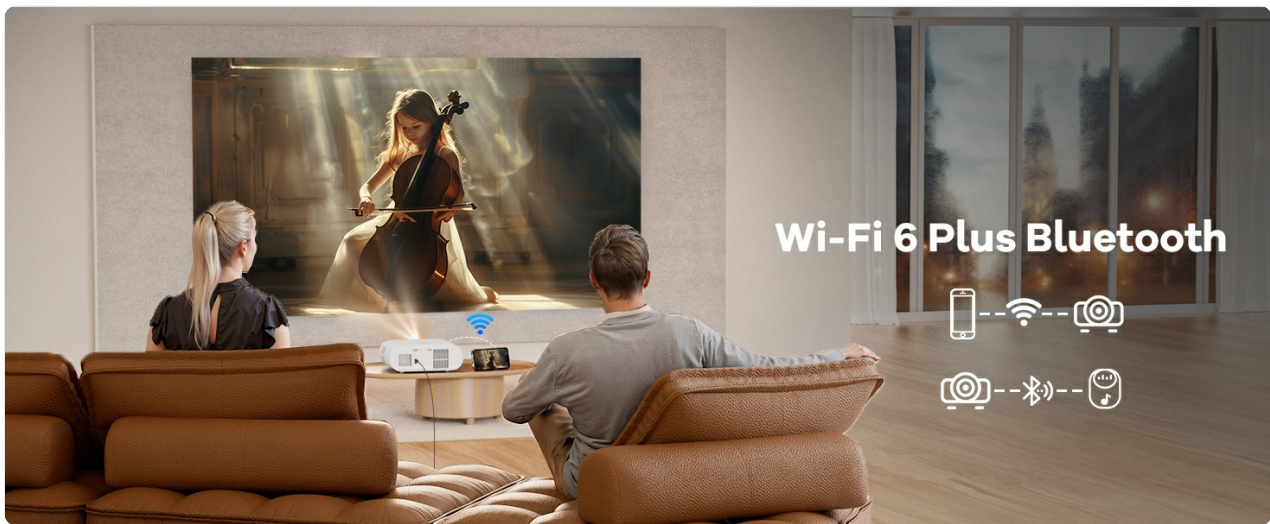
Figure 6.1: The projector receives seamless automatic updates via Wi-Fi.