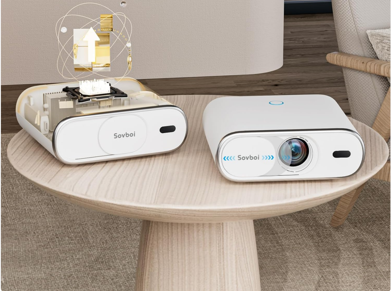
Figure 3.2: The Auto-Guard Smart System with an auto-retracting lens cover for protection.

Auto Lens Cover Plus Auto Seamless Updates One-Tap Protection