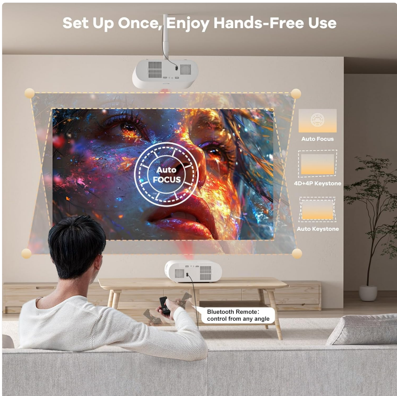
Figure 3.1: The E30Max features automatic focus and keystone correction for effortless setup.