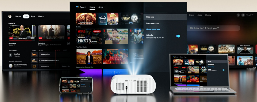
Figure 5.4: Control your projector using the Google Home app on your smartphone.