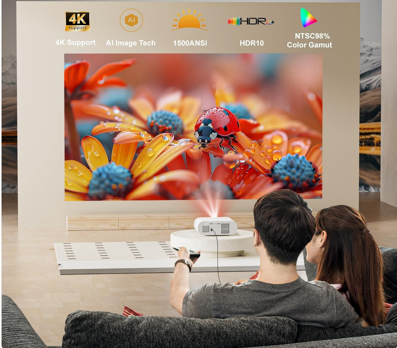
Figure 8.1: The E30Max delivers a high-quality visual experience with 4K support and 1500 ANSI brightness.