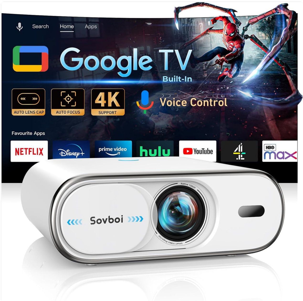
Figure 1.1: Sovboi E30Max Projector with Google TV interface displayed.