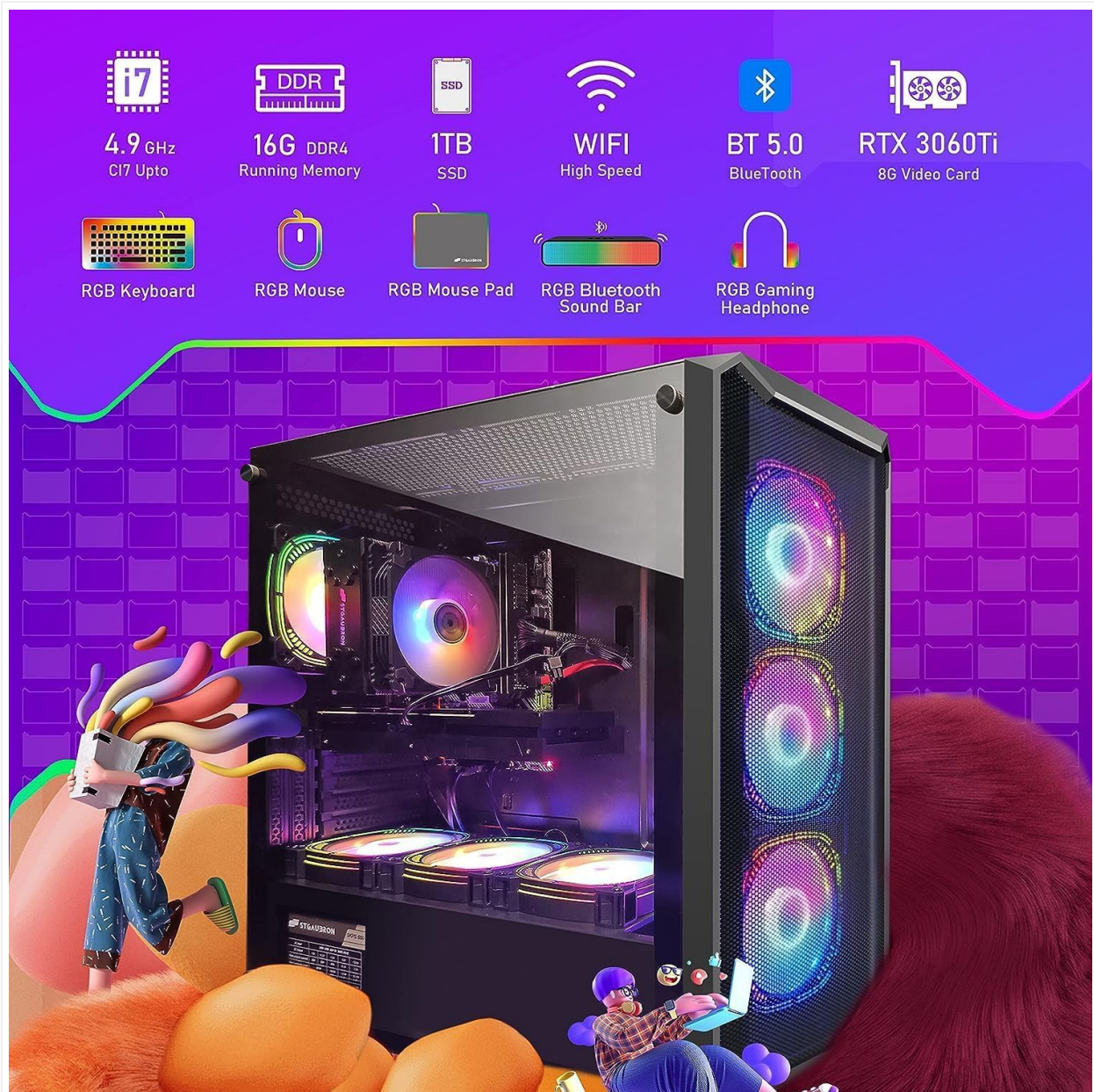
Image 8.1: A visual summary of the STGAubron Gaming PC's core specifications, including CPU, RAM, storage, connectivity, and graphics card.

Detailed technical specifications for your STGAubron Gaming PC Desktop.