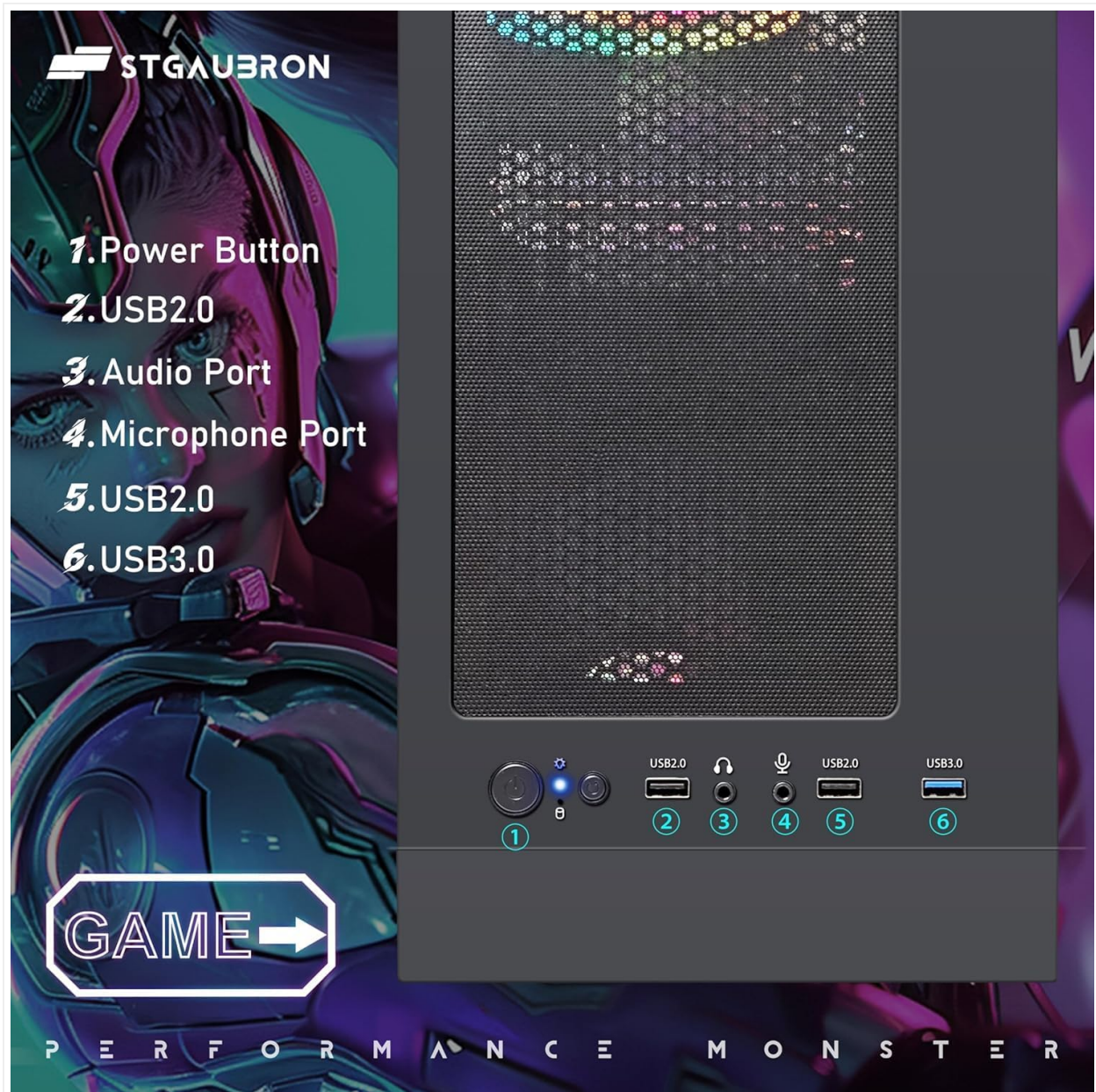
Image 3.2: Detailed diagram of the front panel, indicating the Power Button, USB 2.0 ports, Audio Port, Microphone Port, and USB 3.0 port.