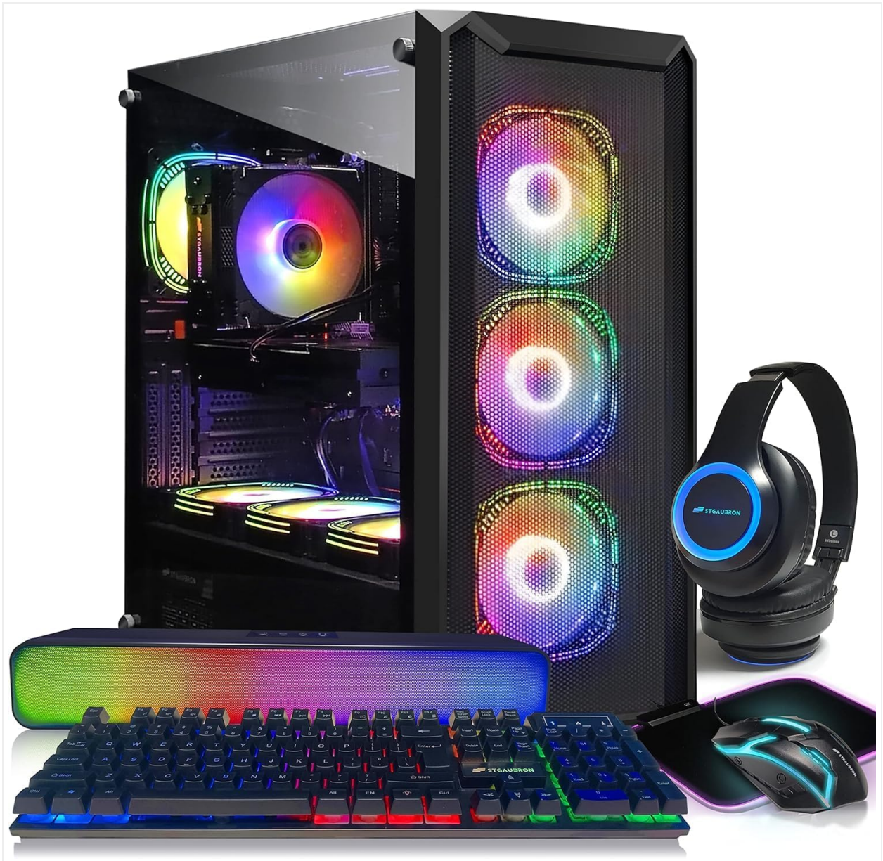
Image 2.1: The STGAubron Gaming PC Desktop shown with its full suite of included RGB accessories, including a keyboard, mouse, mouse pad, headphones, and sound bar.