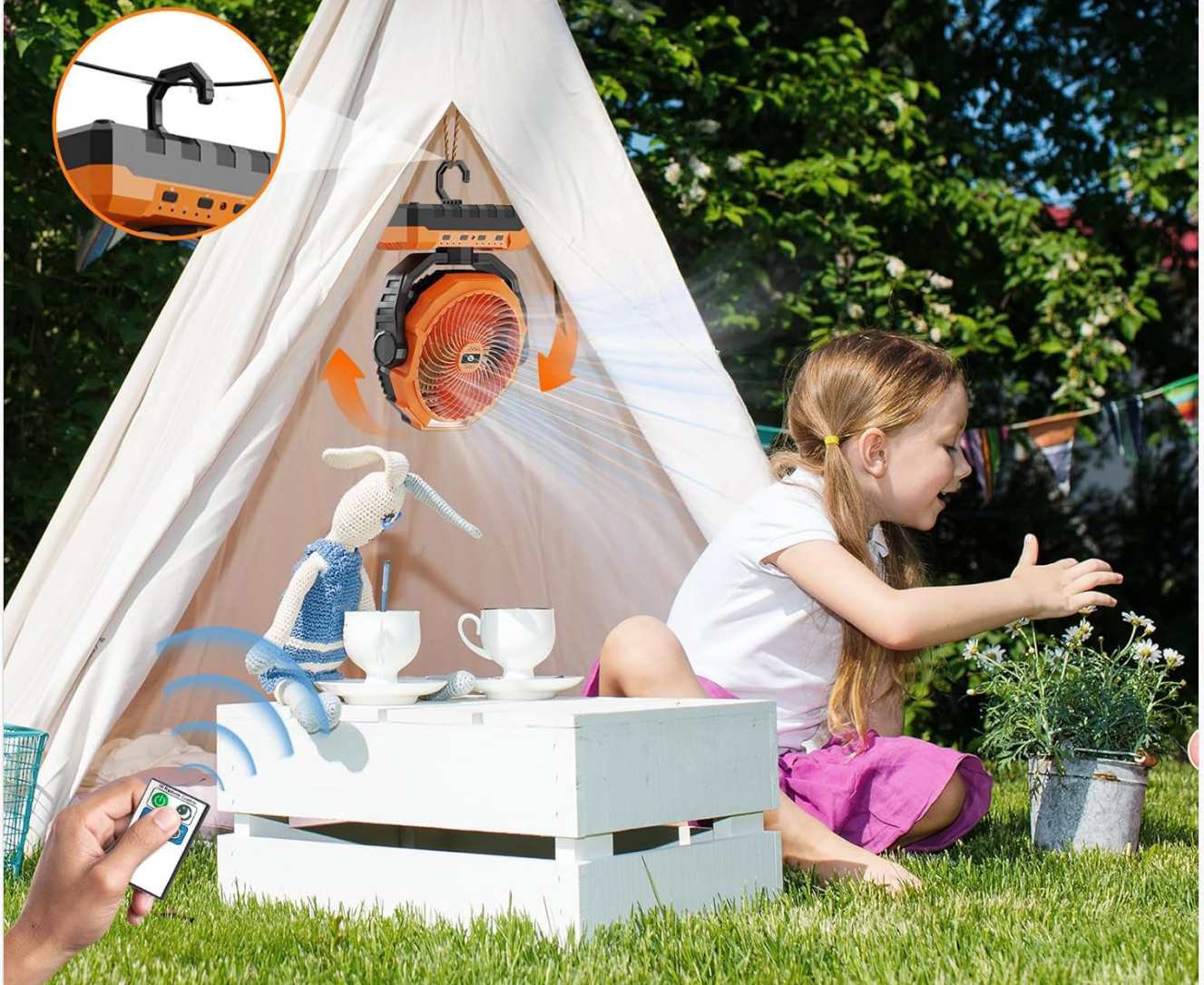
Image: The versatile FRIZCOL Camping Fan demonstrating its hidden hook for hanging and remote control functionality, allowing for customized airflow.