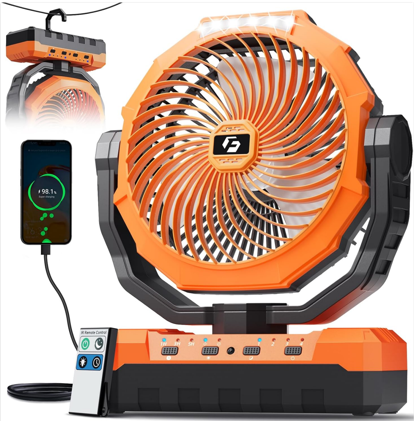
Image: The FRIZCOL 3-in-1 Camping Fan, showcasing its main features including the fan, remote control, and its ability to charge a mobile phone.