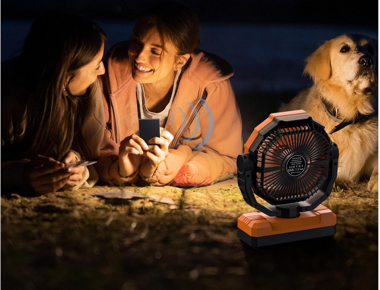
Image: The FRIZCOL Camping Fan providing 2 levels of LED ambient light, creating a comfortable nighttime atmosphere for users.