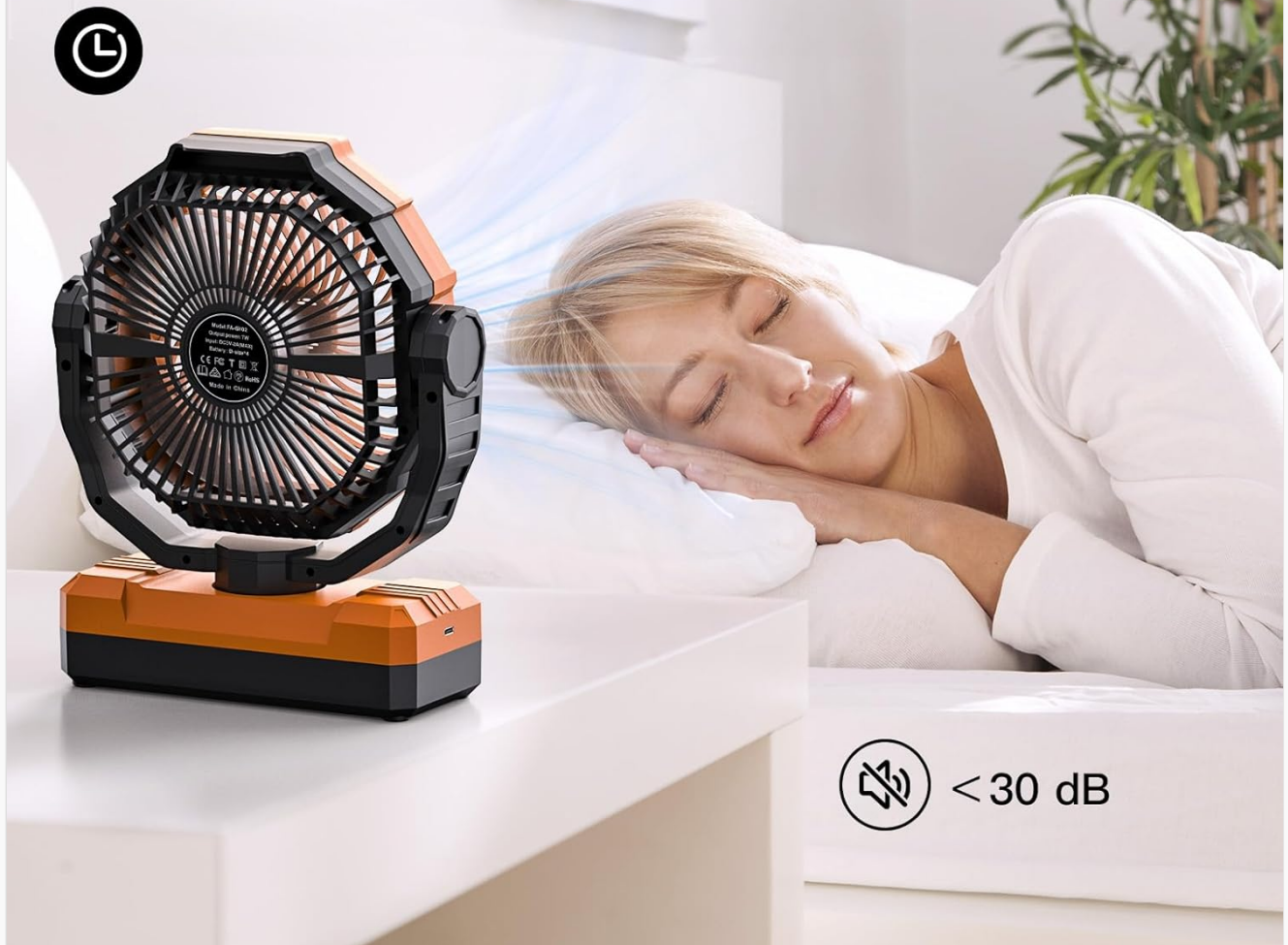
Image: The FRIZCOL Camping Fan operating quietly (under 30 dB) with its 3 timer settings (1, 3, and 5 hours) for peaceful sleep.

Set 1/3/5 Hr auto-off for peaceful sleep