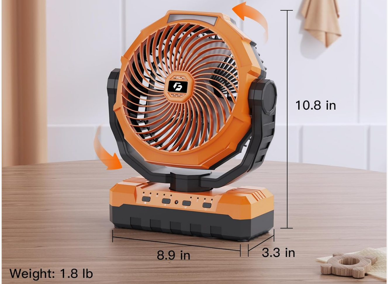
Image: The FRIZCOL Camping Fan highlighting its lightweight and compact design, along with its dimensions and weight for easy portability.