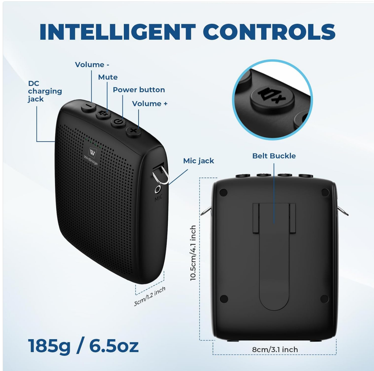
Image 4.1: Detailed view of the amplifier's controls and ports, including Volume -, Mute, Power button, Volume +, DC charging jack, Mic jack, and Belt Buckle.