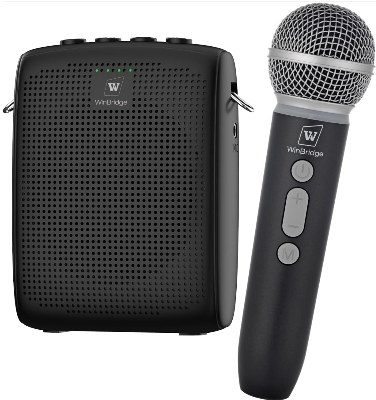
Image 1.1: The WinBridge WB009 Wireless Voice Amplifier and its accompanying handheld microphone.