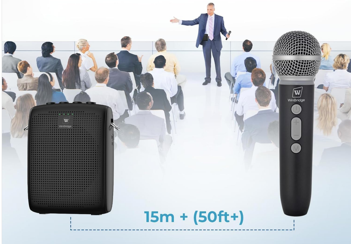
Image 6.1: The wireless microphone offers stable transmission over 15 meters (50 feet) for clear public speaking.