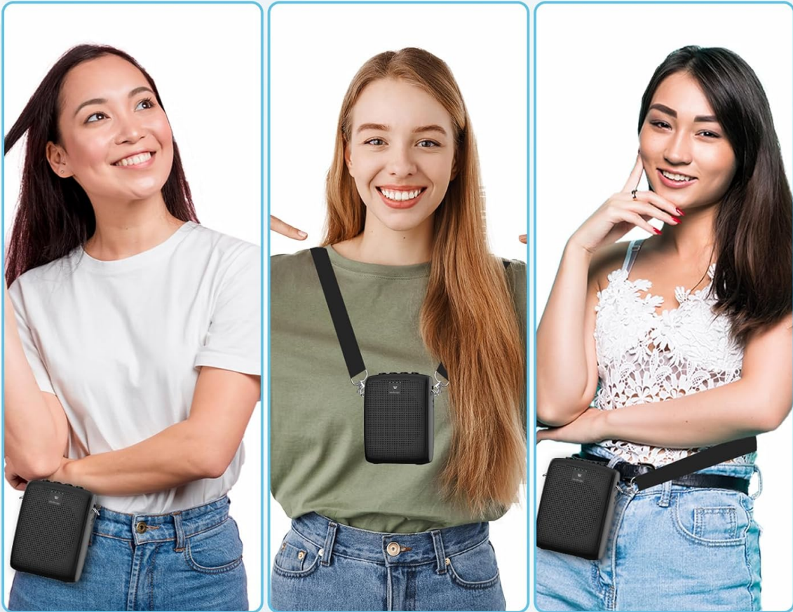
Image 6.4: Versatile wearing options ensure comfort and convenience for various activities.