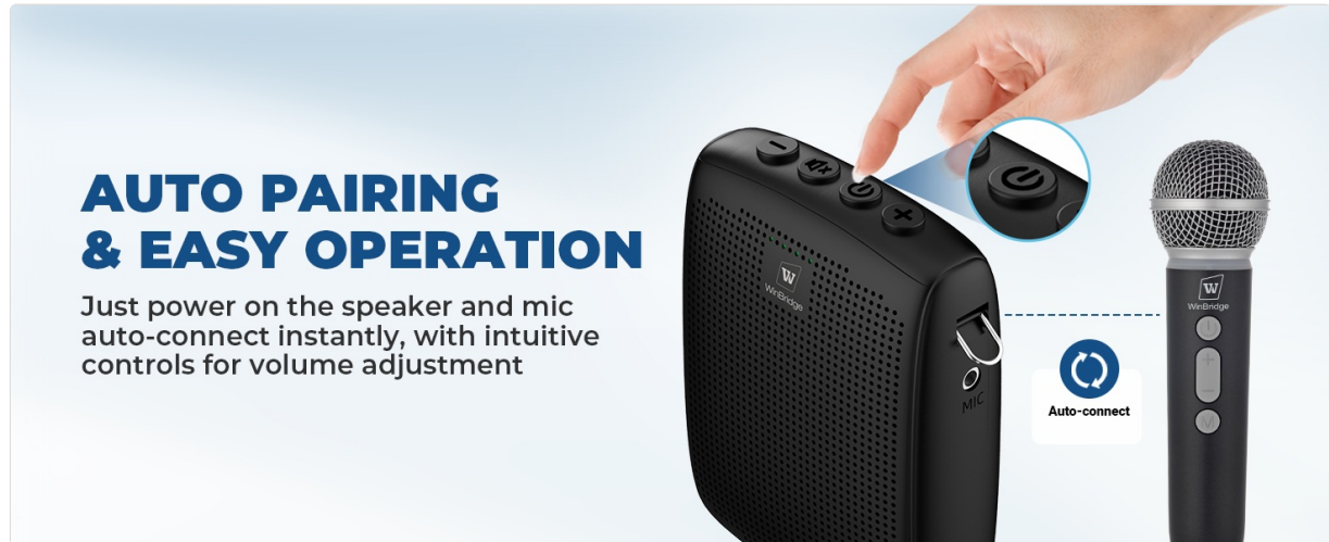
Image 5.2: The amplifier and microphone feature auto-pairing for quick and easy setup.