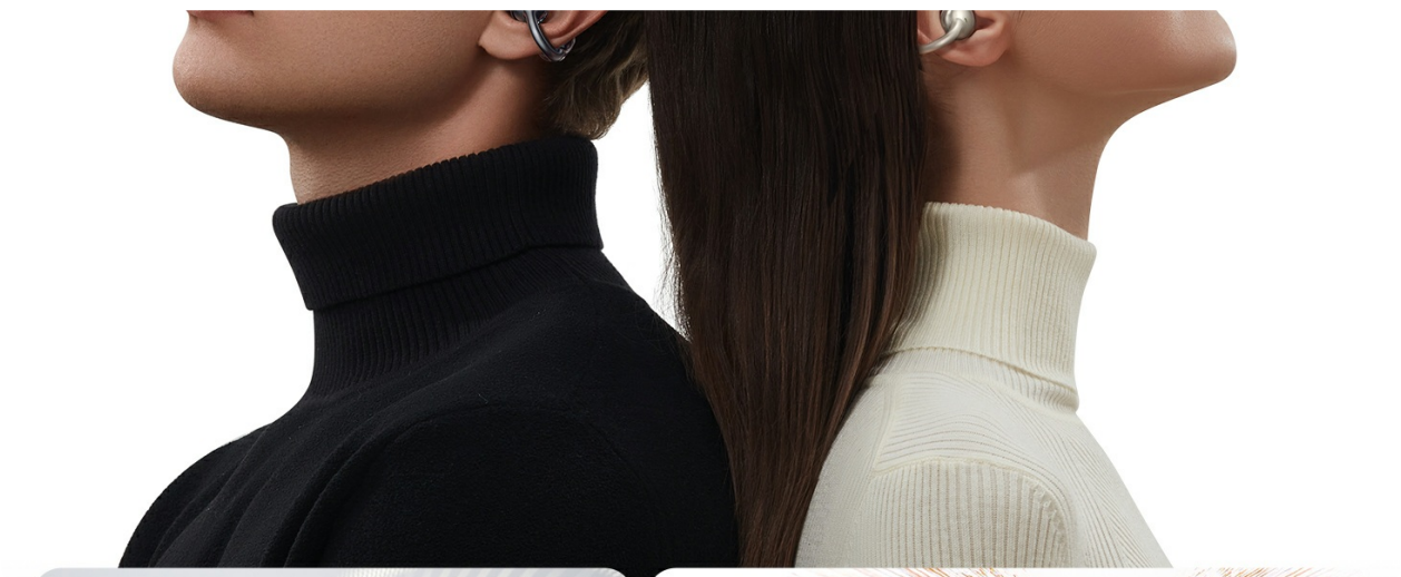
Figure 4: Omni-directional touch control allows for easy operation anywhere on the earbud surface.