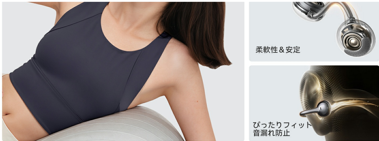
Figure 7: IPX4 water resistance for worry-free use during exercise and in light rain.

The earbuds are rated IPX4 water-resistant, protecting them from splashes and sweat. This makes them suitable for workouts and outdoor activities without worrying about light rain or sweat.