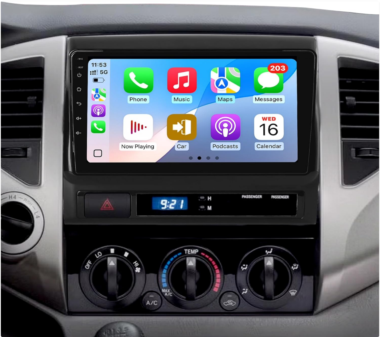
Figure 1.1: WonVon Car Stereo integrated into a Toyota Tacoma dashboard.