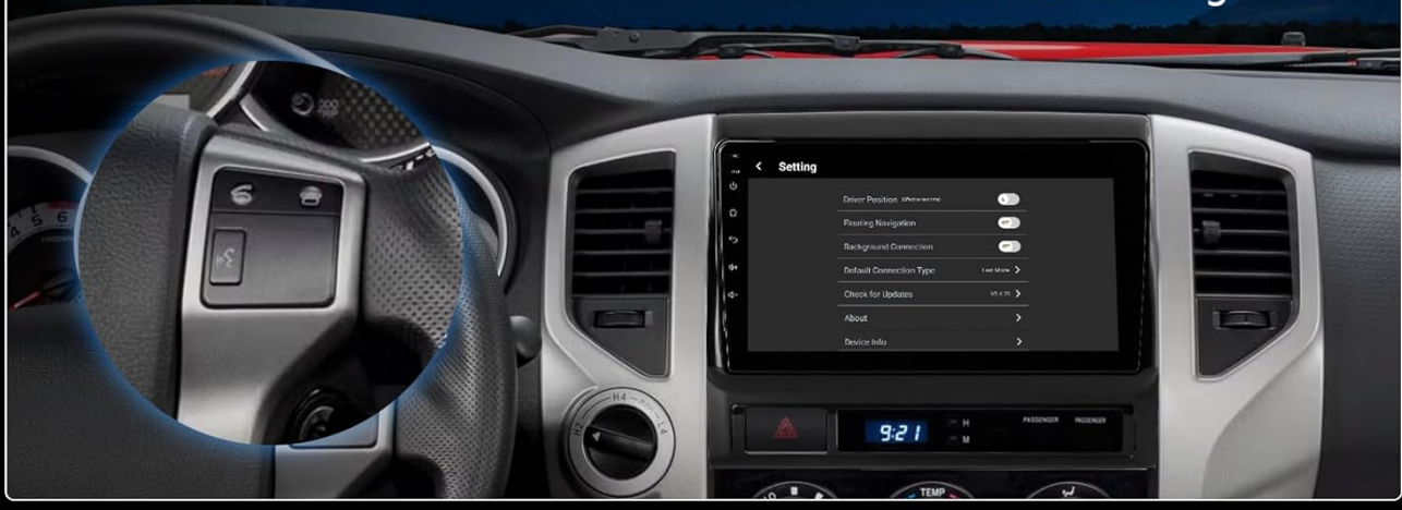
Figure 5.6: Steering wheel controls allow convenient operation of the head unit.

You can control the functions you need more conveniently with the steering wheel.