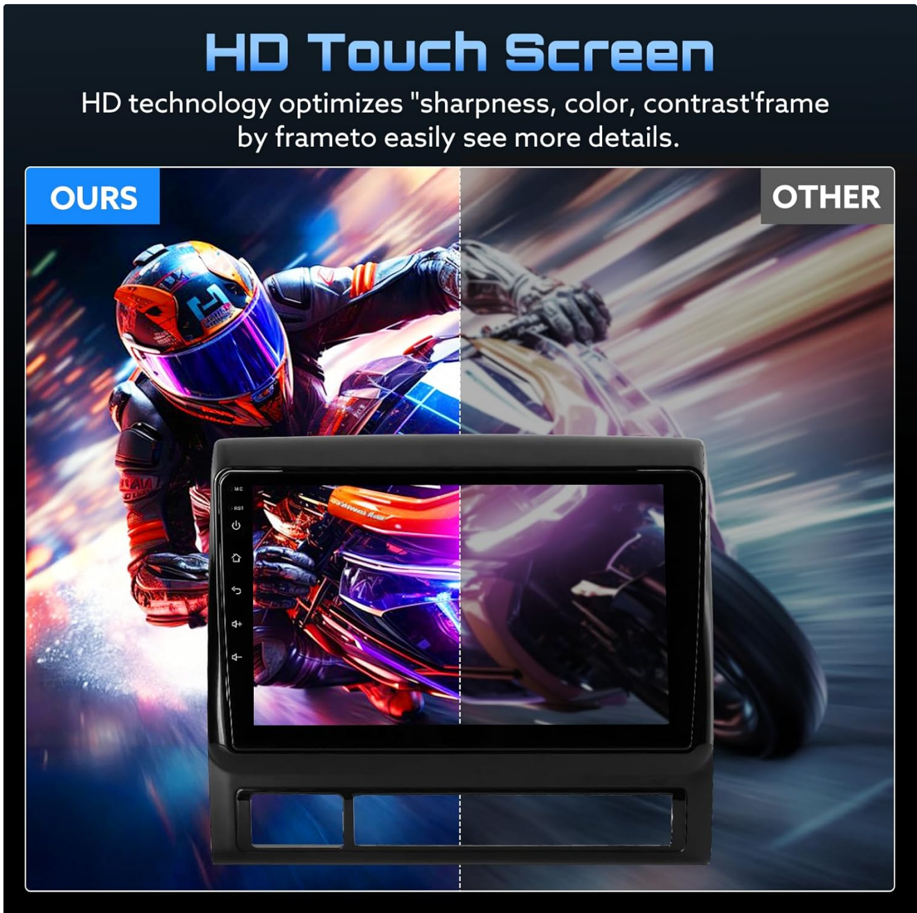
Figure 5.1: The HD touchscreen provides enhanced sharpness, color, and contrast for improved visibility.

The WonVon Car Stereo runs on Android 13, providing a familiar and intuitive interface. The 9-inch HD touchscreen offers clear visibility and responsive control. Navigate through menus by tapping icons and swiping across the screen.