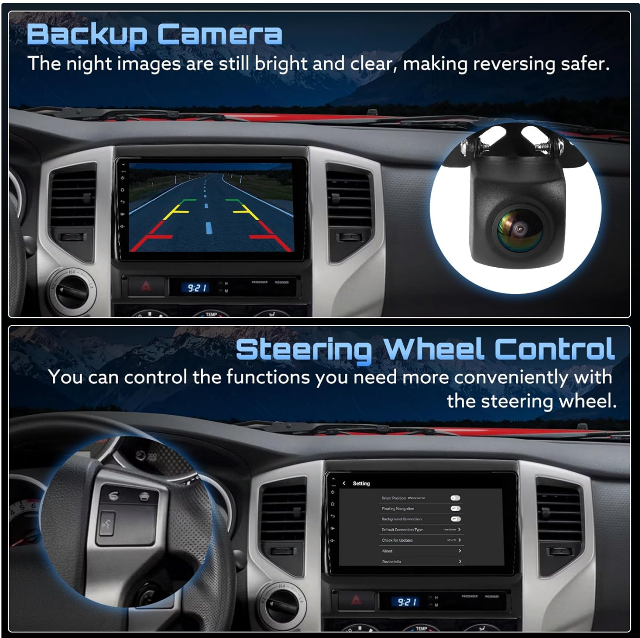
Figure 5.5: Backup camera display with parking guidance lines for safer reversing.

The unit is ready to connect to a rearview camera (sold separately). When connected, the display automatically switches to the camera view when the vehicle is in reverse, providing parking guidance with directional overlays.