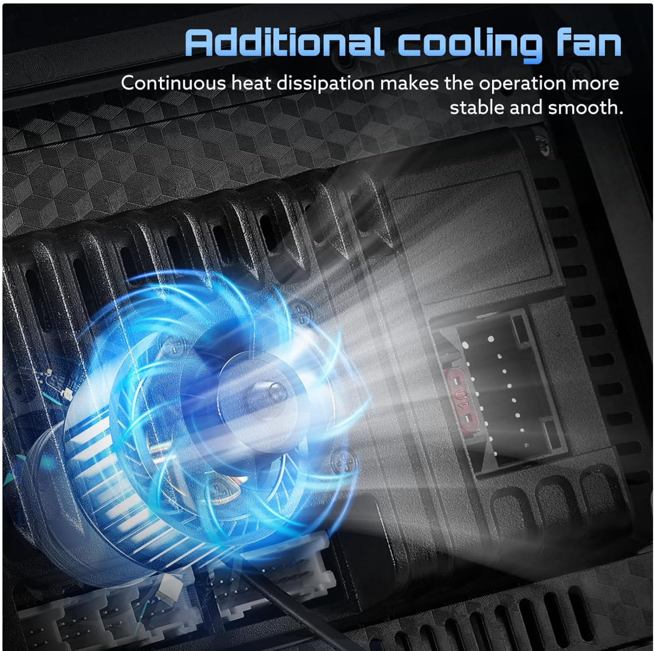
Figure 4.1: The integrated cooling fan ensures stable and smooth operation by dissipating heat.

Note: The unit features a built-in cooling fan to maintain stable operation. Ensure adequate ventilation around the unit during installation.