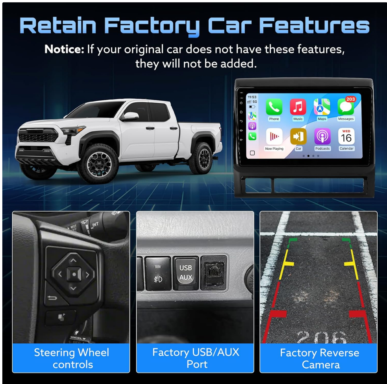
Figure 5.7: Examples of factory features that can be retained with the WonVon Car Stereo.

Important: If your original car did not have these features, they will not be added by installing this head unit.