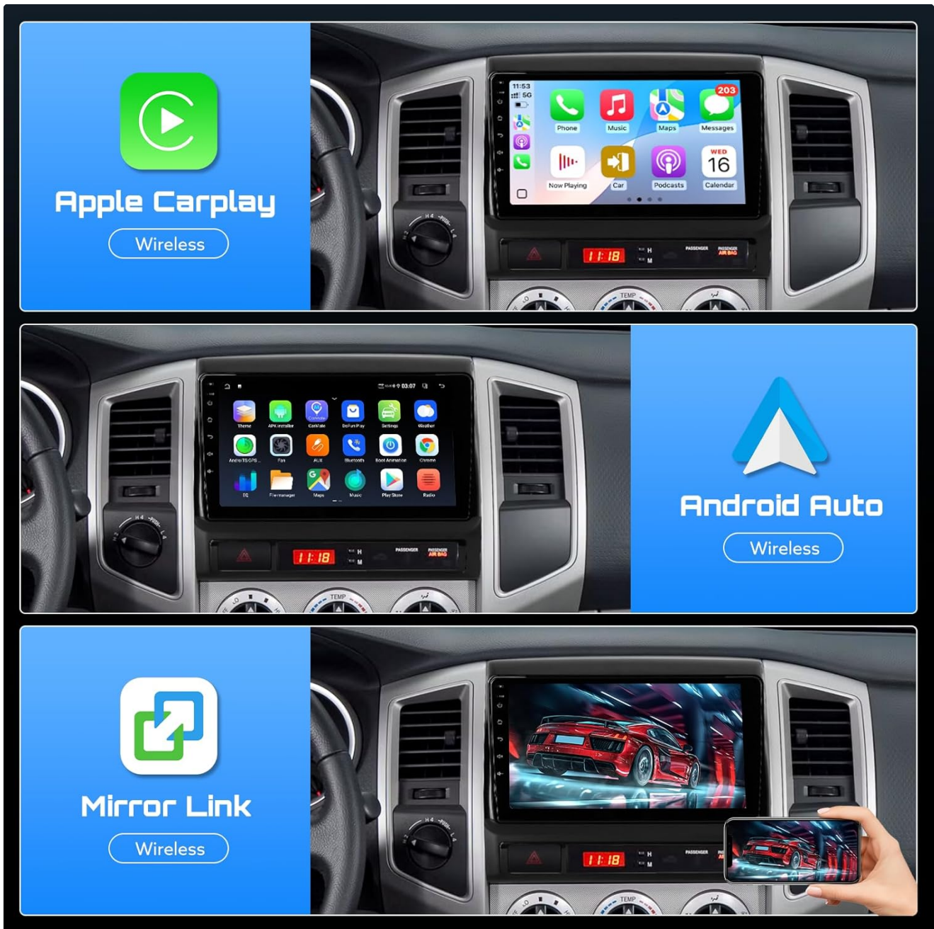
Figure 5.3: Wireless Apple CarPlay, Android Auto, and Mirror Link functionality.