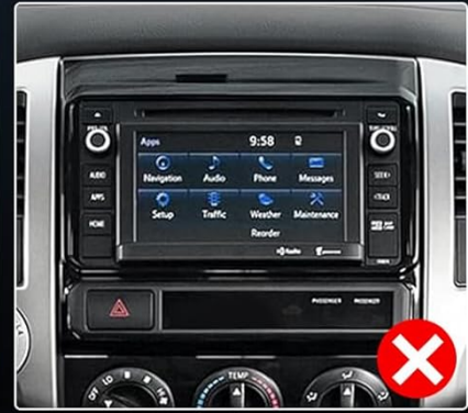
Not Fit Touch Screen