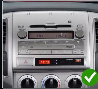
Compatible Type B