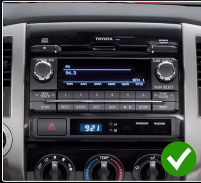
Compatible Type A