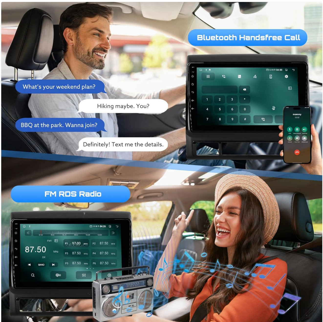
Figure 5.4: Bluetooth hands-free calling interface and FM RDS Radio display.