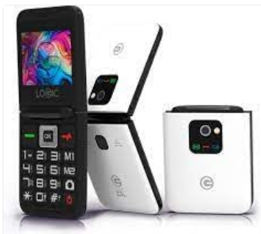
Image: The Logic Z3L flip phone in open position, alongside its charging dock. This image illustrates the phone and its primary accessory.