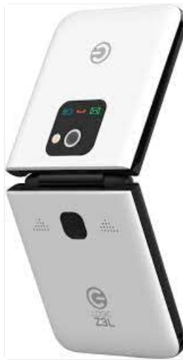
Image: The Logic Z3L flip phone in its closed, compact state. This view highlights the external display and camera module.