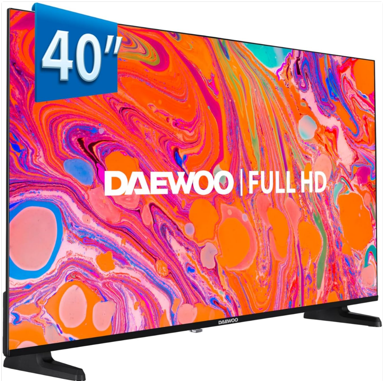
Image: Front view of the Daewoo 40DM85FV 40-inch Full HD Smart TV.