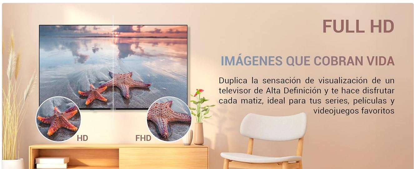
Image: Visual comparison demonstrating the enhanced clarity and detail of Full HD (FHD) compared to standard HD resolution.

The TV features Full HD resolution (1920x1080 pixels) for sharp and detailed images. It also supports HDR10, enhancing contrast and color accuracy for a more vibrant viewing experience.