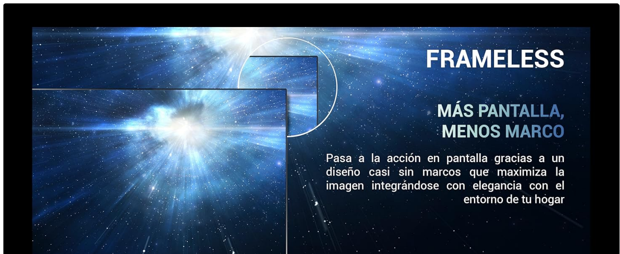
Image: Visual representation of the TV's frameless design, emphasizing the minimal bezel for an expansive viewing area.