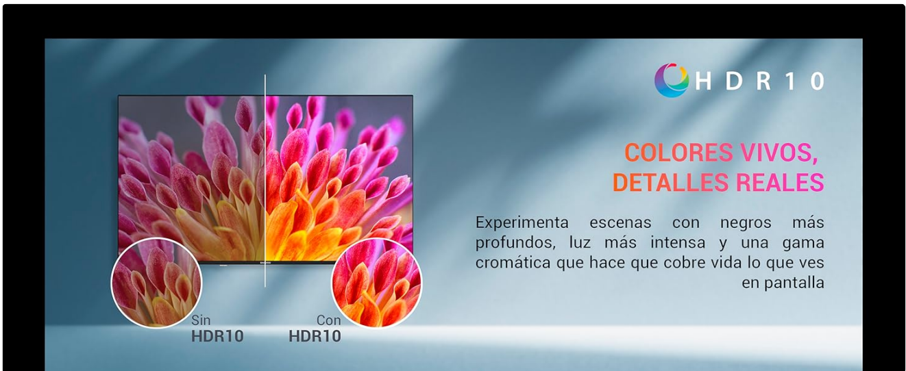
Image: Side-by-side comparison illustrating the deeper blacks, brighter highlights, and richer colors achieved with HDR10 technology.