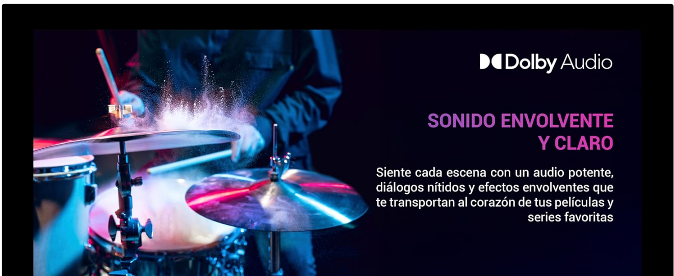
Image: Graphic illustrating the immersive sound experience provided by Dolby Audio, with sound waves emanating from a drum set.

Experience immersive and clear sound with Dolby Audio technology. Adjust sound modes (e.g., Standard, Music, Movie) through the TV's audio settings menu to optimize your listening experience.