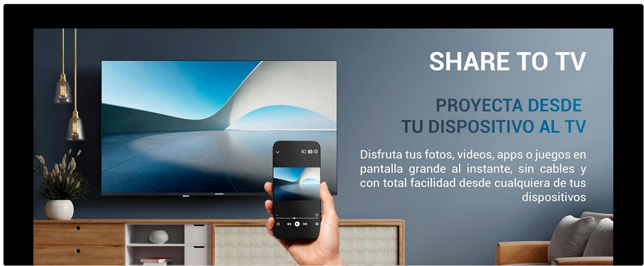
Image: Illustration of the "Share to TV" feature, showing a smartphone screen mirrored onto the television.