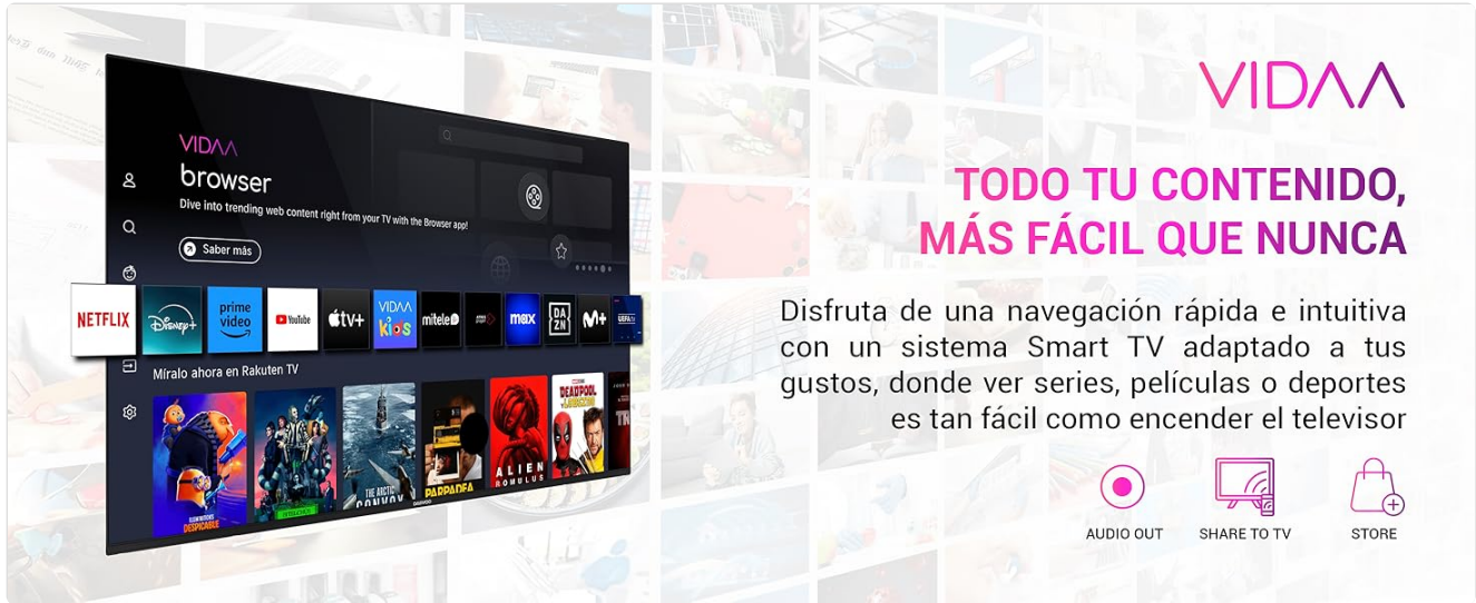
Image: Screenshot of the VIDAA Smart TV interface, displaying various streaming application icons and a browser option.

Your Daewoo TV runs on the intuitive VIDAA Smart TV operating system, providing access to popular streaming applications such as Netflix, YouTube, Movistar+, DAZN, MAX, and Prime Video. Connect your TV to the internet via Wi-Fi or Ethernet to access these features.