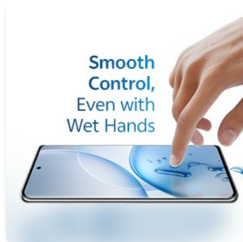
Figure 9: Smooth Control with Wet Hands