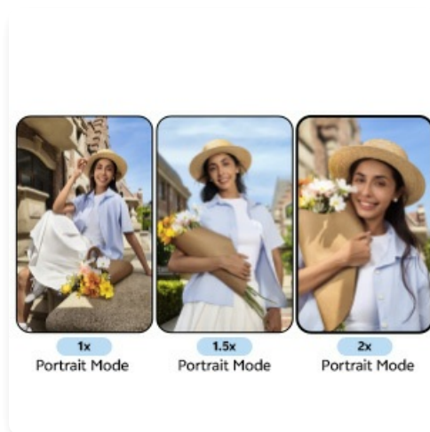
Figure 4: Portrait Mode Examples