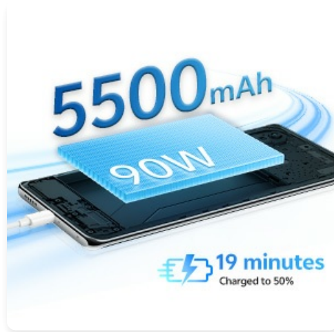
Figure 5: Battery and Fast Charging Capabilities