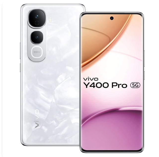
Figure 1: Vivo Y400 Pro 5G (Freestyle White) - Front and Back View

Welcome to the user manual for your new Vivo Y400 Pro 5G smartphone. This guide provides essential information on setting up, operating, maintaining, and troubleshooting your device. Please read this manual thoroughly to ensure optimal performance and longevity of your phone.