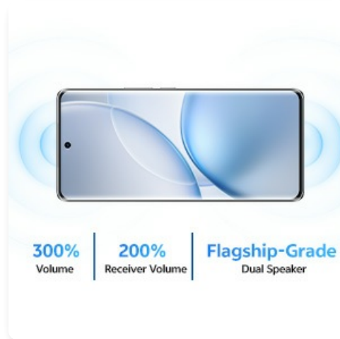
Figure 8: Flagship-Grade Dual Speakers