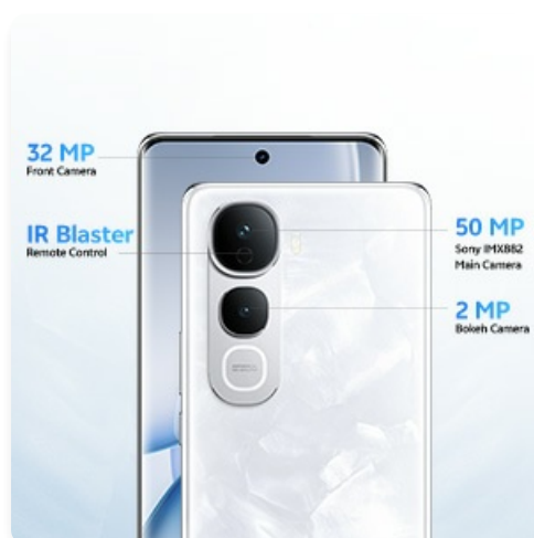
Figure 3: Vivo Y400 Pro 5G Camera System Overview