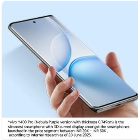
Figure 7: Slim 3D Curved Display