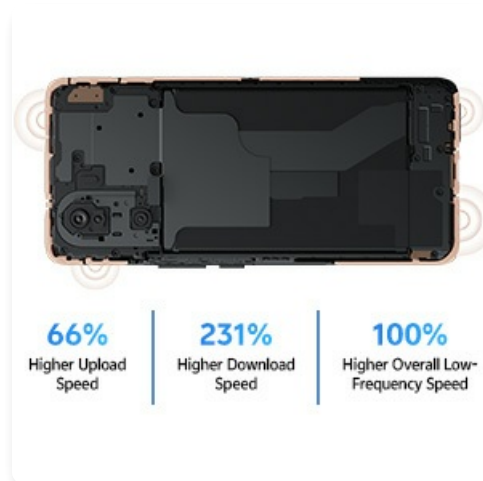
Figure 11: Enhanced Network Speeds