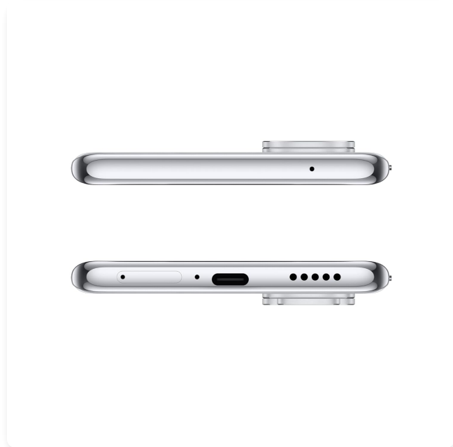
Figure 2: Vivo Y400 Pro 5G - Top and Bottom Ports