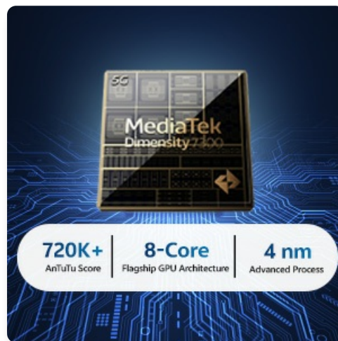
Figure 6: MediaTek Dimensity 7200 Processor Details