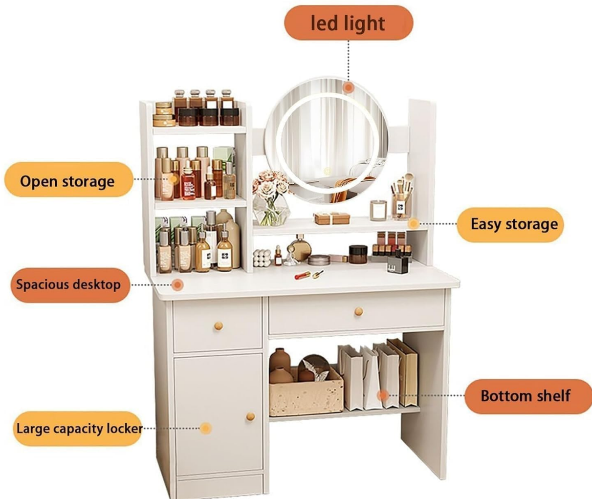
Image 4.1: Overview of the dressing table's storage features. This image highlights the various storage options, including open shelves, hidden drawers, and a locker, demonstrating the product's capacity for organizing cosmetics and other items.

Small footprint Multi-layer large-capacity storage Stable structure