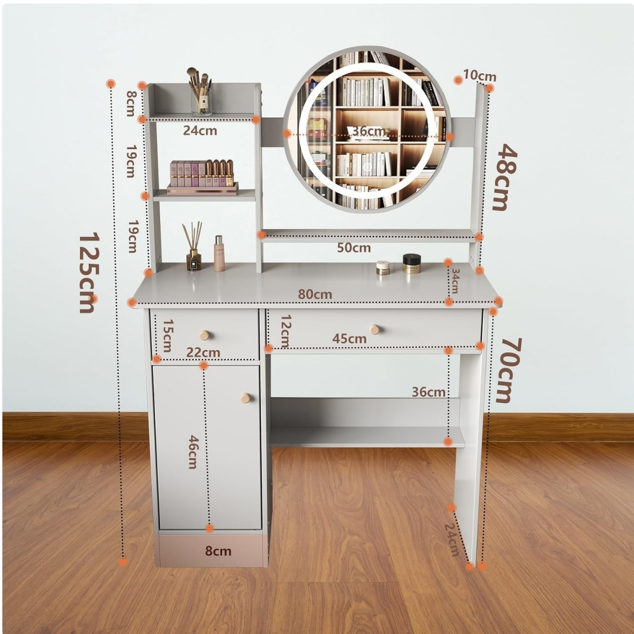
Image 3.1: Detailed dimensions of the dressing table. This image provides precise measurements for various sections of the vanity, including height, width, and depth of the desk, mirror, and storage compartments, useful for planning placement and understanding component sizes.