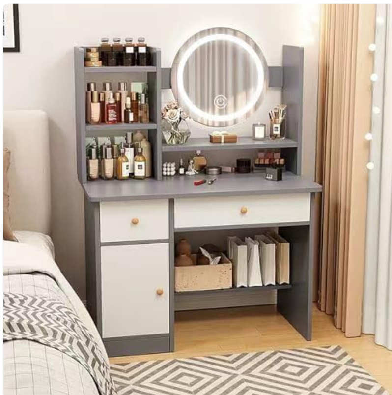
Image 1.1: Overall view of the MONGMON Dressing Table with LED Mirror. This image shows the complete vanity desk with

Thank you for choosing the MONGMON Dressing Table with LED Mirror. This versatile furniture piece is designed to enhance your bedroom or dressing area with its practical storage solutions, integrated LED lighting, and elegant design. Please read this manual carefully before assembly and use to ensure proper installation and safe operation.