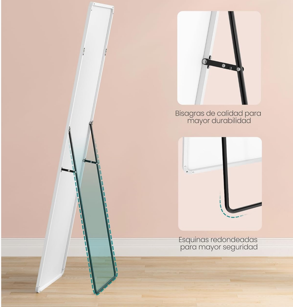
Figure 1.2: Stable U-shaped Stand. This image illustrates the mirror's U-shaped stand, emphasizing its stability, quality hinges for durability, and rounded corners for user safety.

Sujeta el espejo de forma segura sin que vuelque