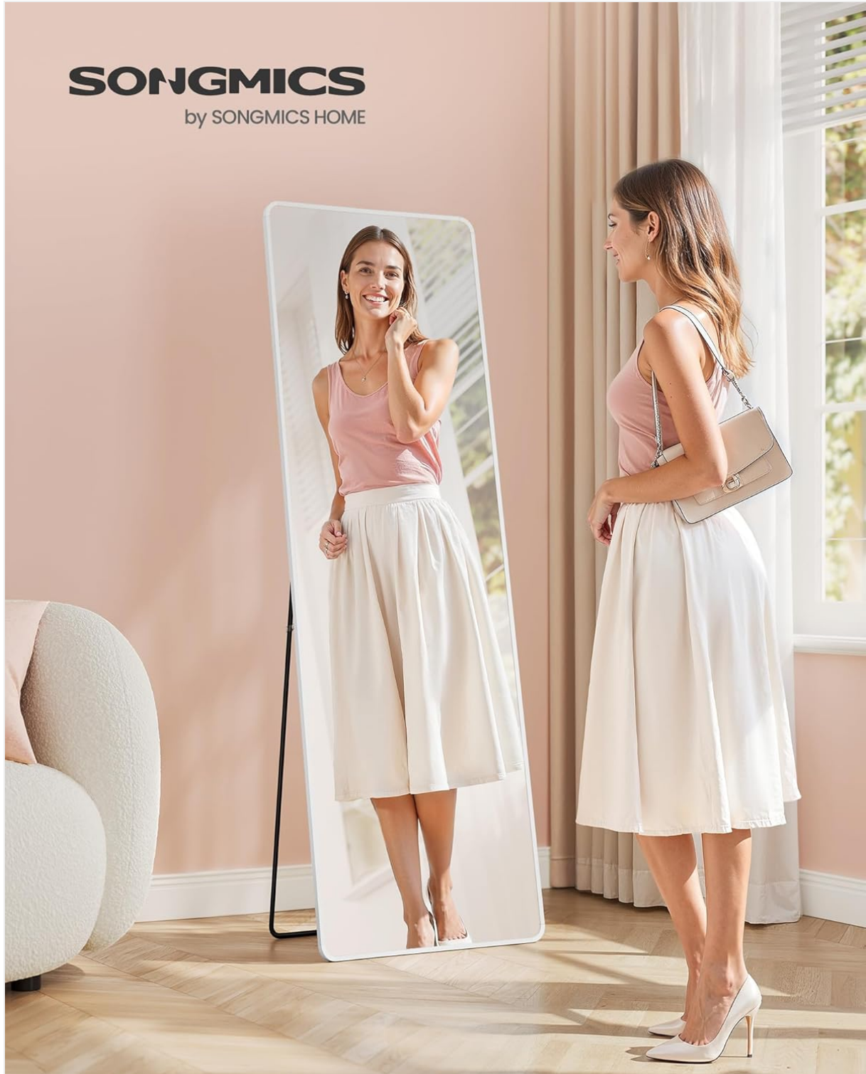
Figure 3.1: Freestanding Mirror in Use. This image shows a woman standing next to the SONGMICS full-length mirror, which is freestanding with its support open, demonstrating its typical use.