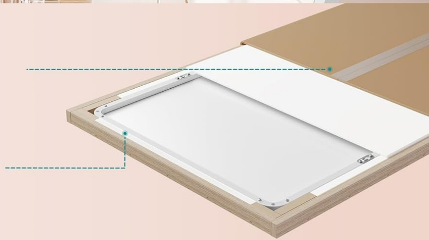
Figure 2.1: Robust Frame and Packaging. This image highlights the durable aluminum alloy frame of the mirror and its protective packaging, including impact-resistant cardboard and fully wrapped foam to ensure safe delivery.