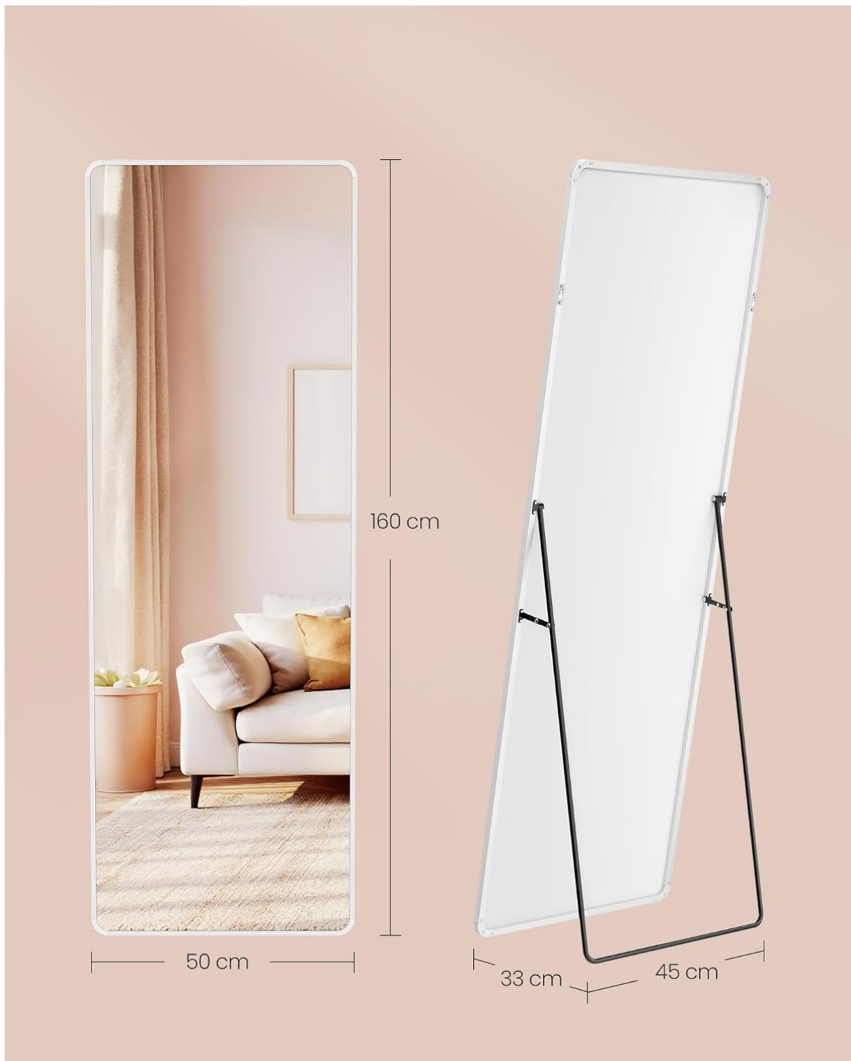
Figure 7.1: Product Dimensions. This image illustrates the overall dimensions of the mirror (160 cm height x 50 cm width) and the stand's footprint (33 cm depth x 45 cm width).