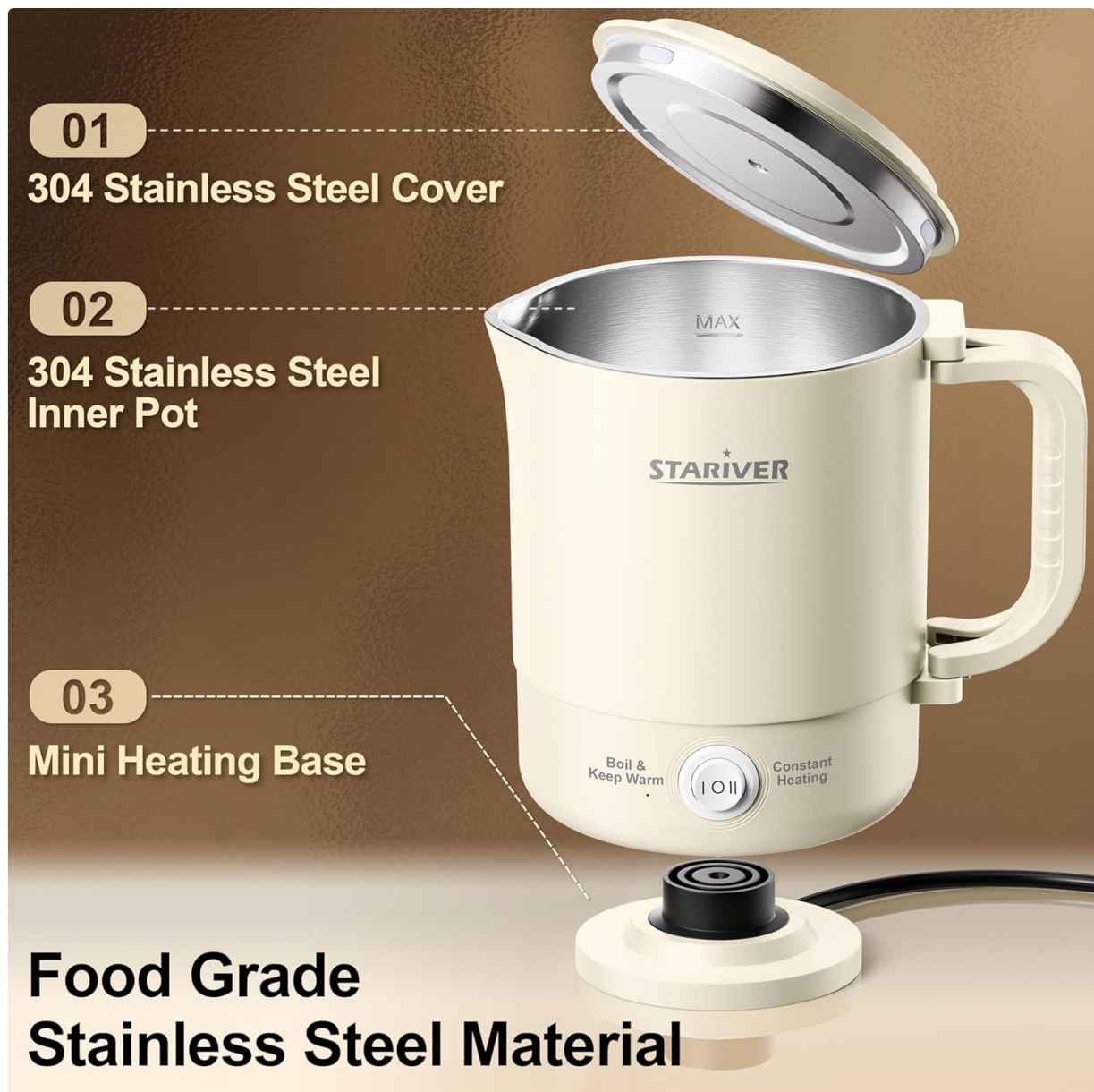
Figure 7: Food Grade Stainless Steel Components