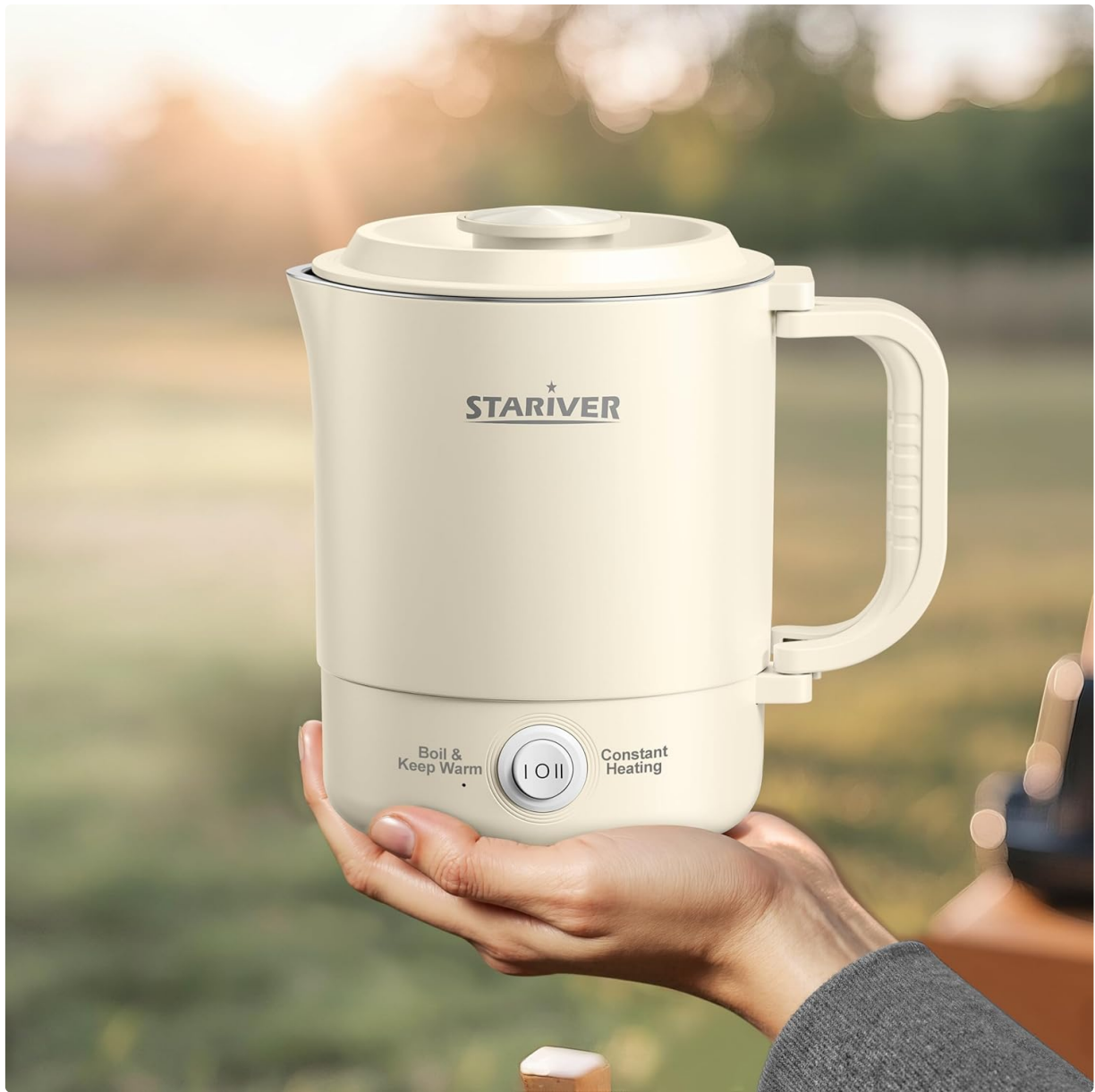
Figure 1: Stariver Portable Travel Kettle - Overview