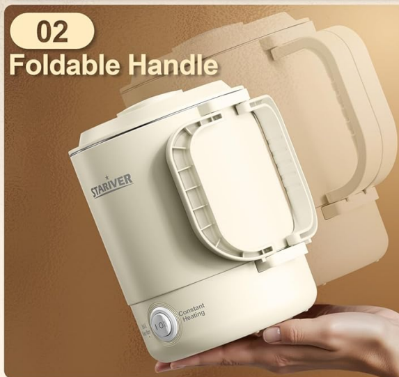
Figure 2: Portable Design Features