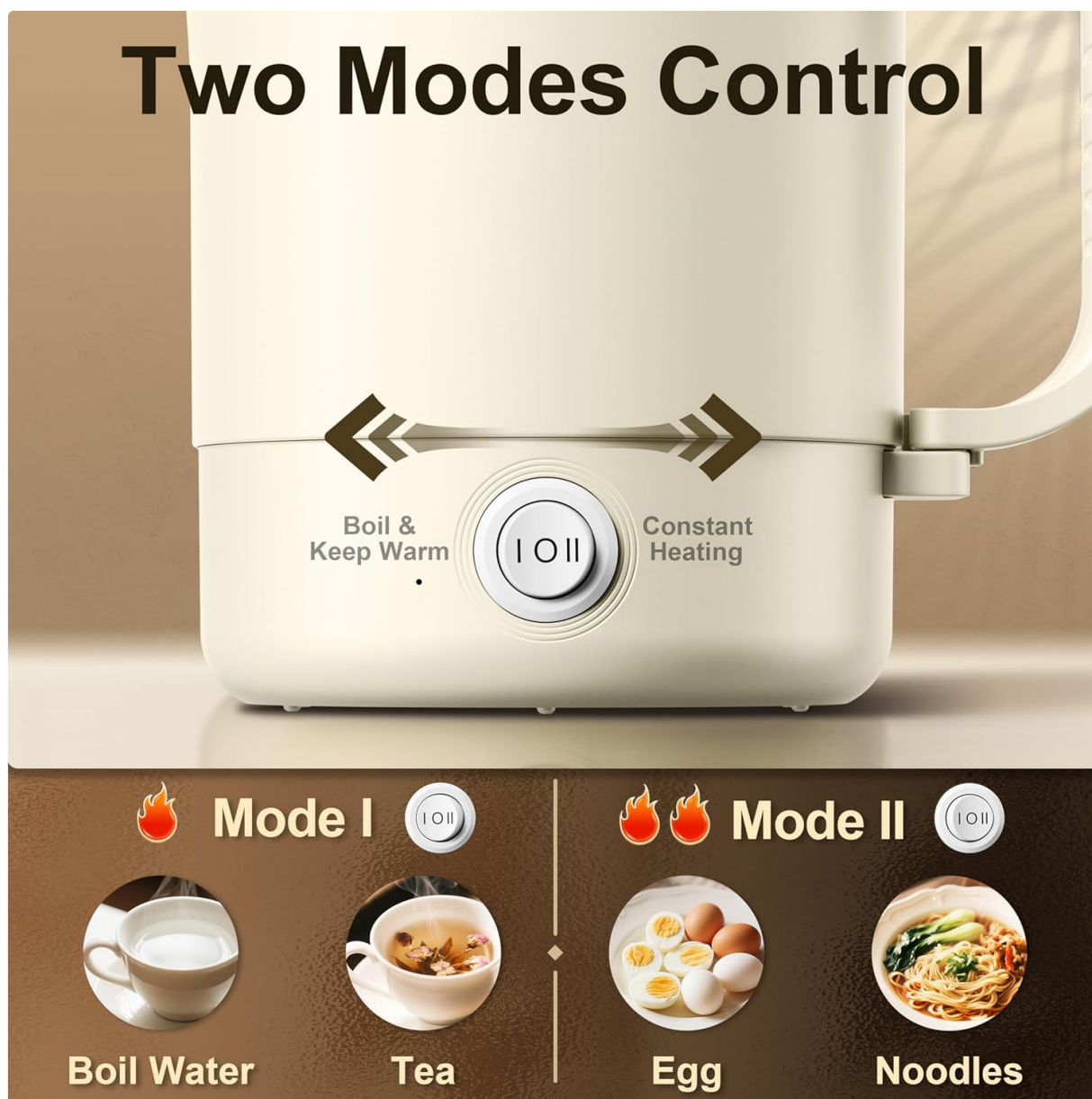
Figure 3: Dual Mode Control Panel