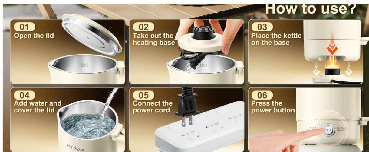
Figure 4: Initial Setup and Operation Steps