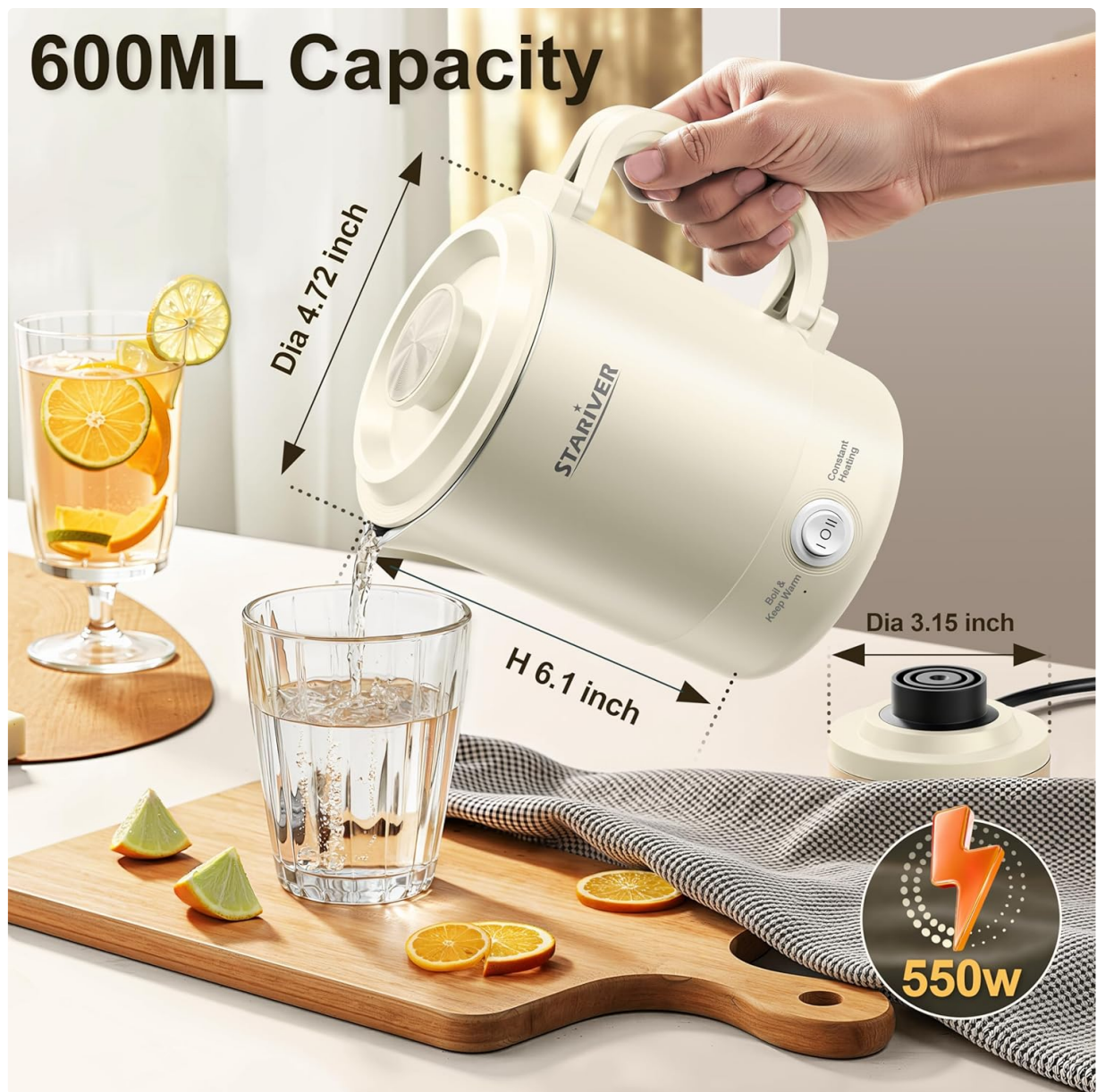
Figure 6: Kettle Dimensions and Capacity