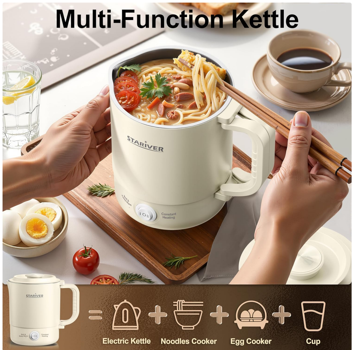
Figure 5: Multi-functional Use Cases