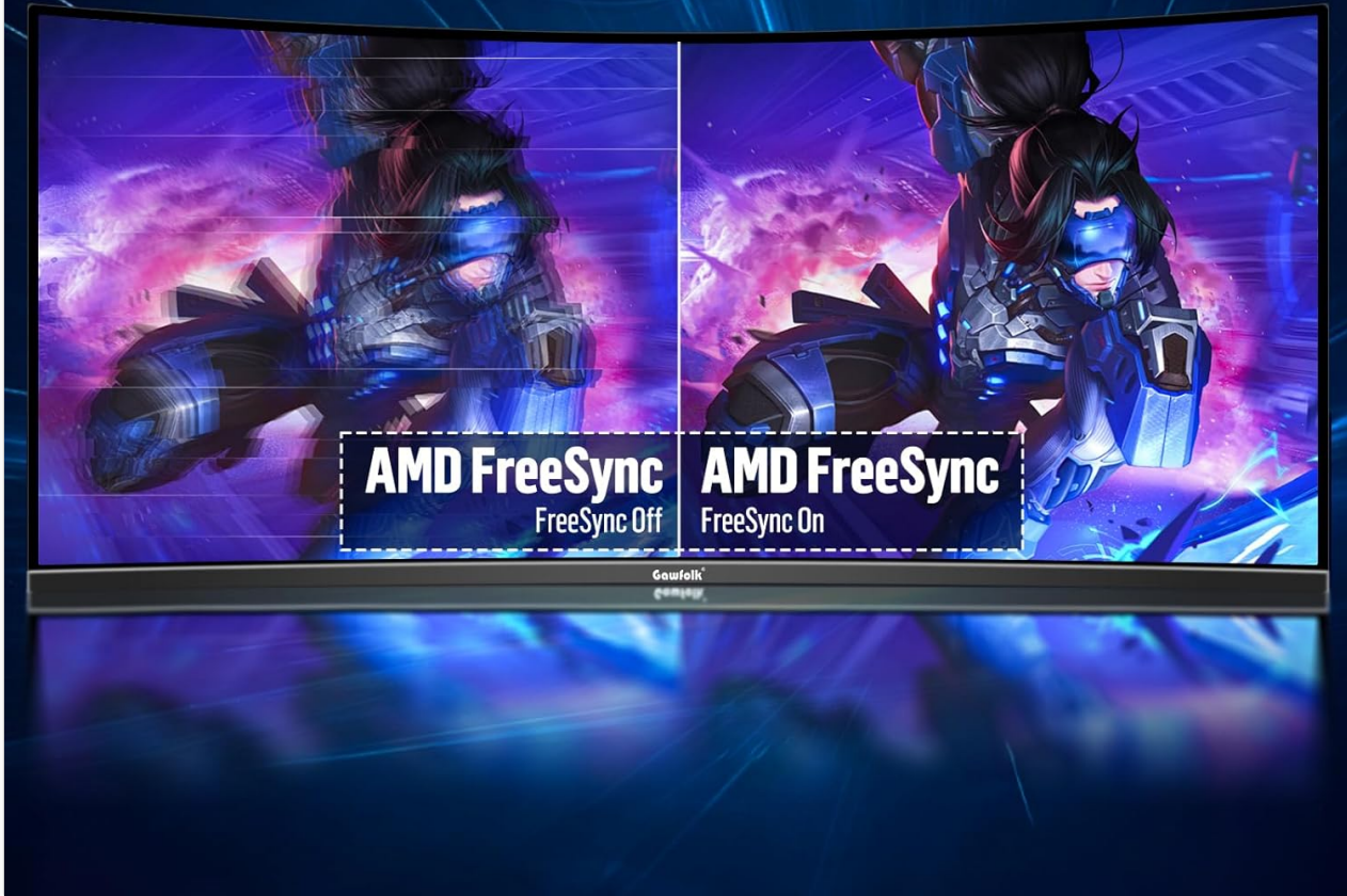
Figure 5: AMD FreeSync Technology. This image visually demonstrates the effect of AMD FreeSync, showing a clear, tear-free image on the 'On' side compared to a distorted image on the 'Off' side.

Can help you solve blur and lag in fast-moving operations as well as screen tearing