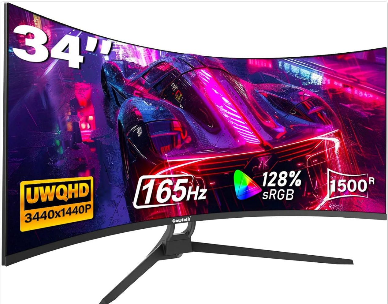
Figure 7: Experience the feeling of world racing. This image depicts a user engaged in a racing game on the curved monitor, emphasizing how the 1500R curvature enhances immersion and concentration.