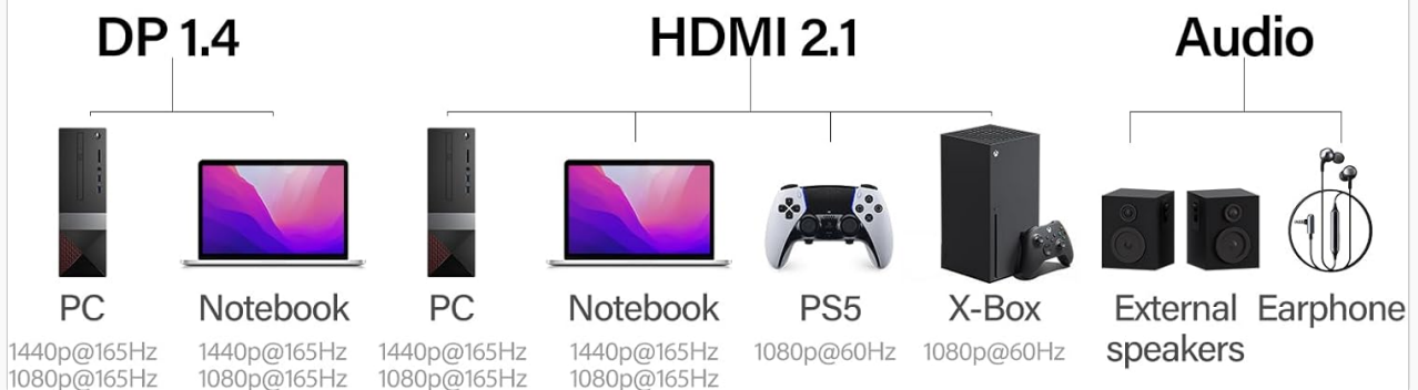
Figure 4: Product Application Diagram. This diagram illustrates various connection scenarios for the monitor, including PCs, notebooks, PS5, and Xbox, showing compatible resolutions and refresh rates for each port type.