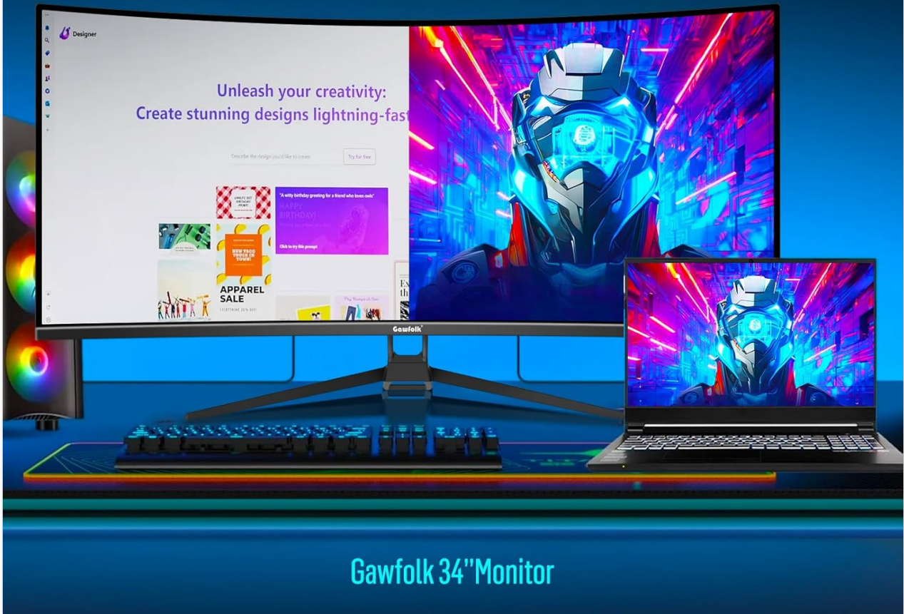
Figure 8: More Space for Multi-Tasking. This image shows the ultrawide monitor displaying multiple applications side-by-side, demonstrating its capability for enhanced productivity and multitasking.