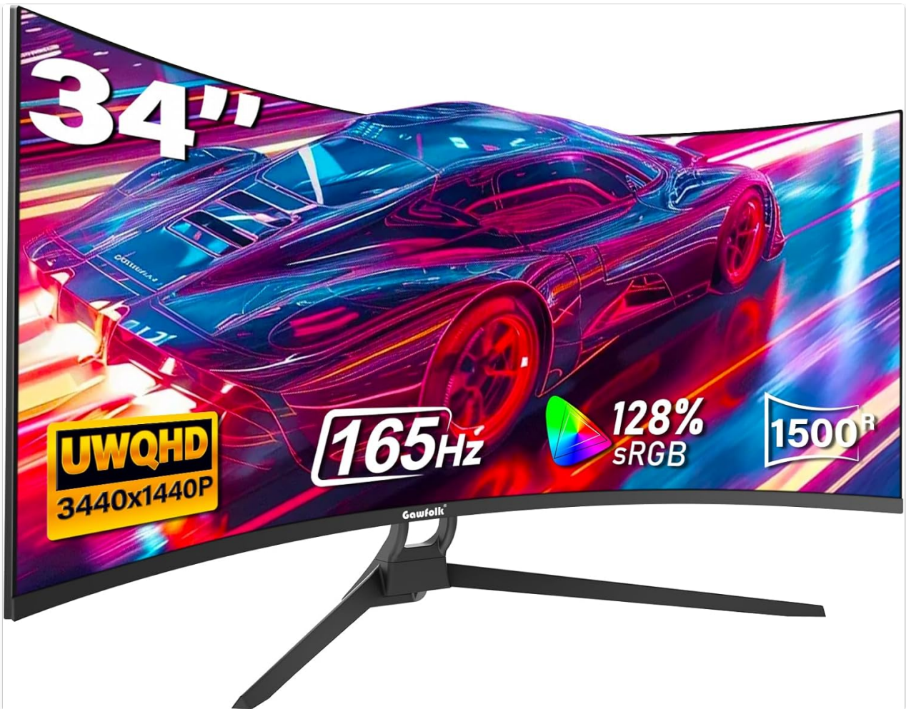
Figure 1: Gawfolk 34-Inch Ultrawide Curved Gaming Monitor. This image displays the front view of the curved monitor, highlighting its ultrawide aspect ratio and sleek design.