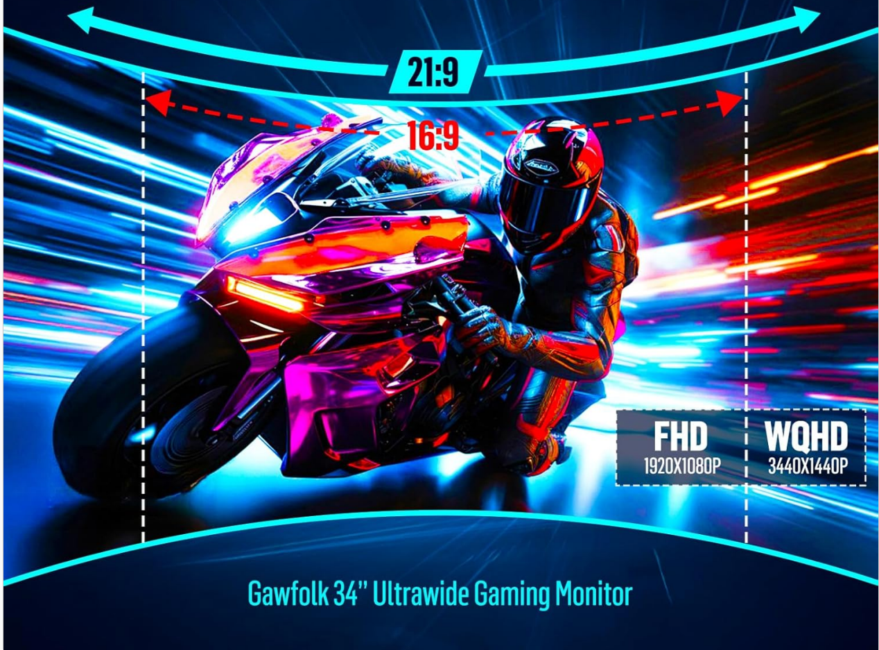
Figure 2: 21:9 WQHD Giant Screen. This image illustrates the expanded screen space of the 21:9 ultrawide monitor compared to a traditional 16:9 display, emphasizing the increased horizontal viewing area.

The 21:9 Ultra-wide ratio is 34% wider than the traditional 16:9 display, and the image quality