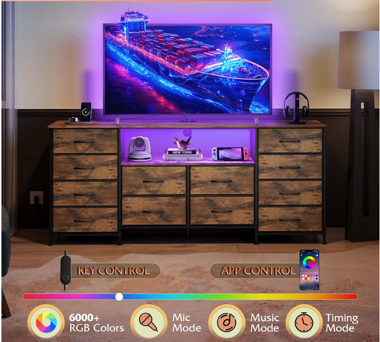
Figure 2: LED Light features and control options.