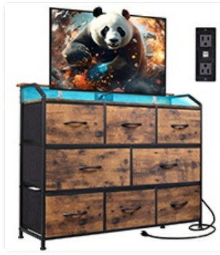
Figure 4: Water-resistant wood surface for easy cleaning.