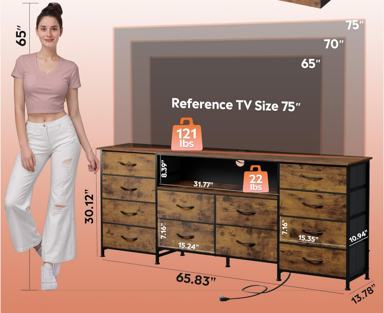
Figure 5: Product dimensions and TV size compatibility.

Your browser does not support the video tag.