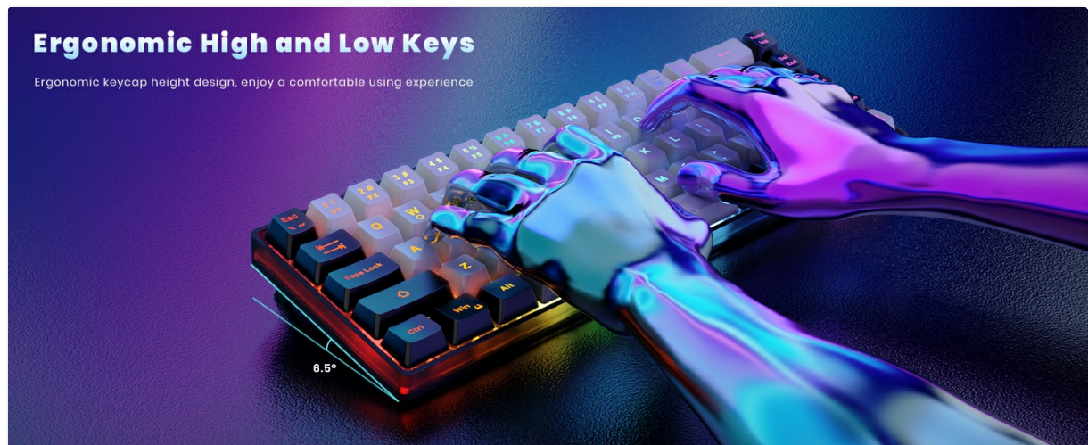
Image: A close-up view of the keyboard demonstrating its ergonomic high and low keycap design for comfortable long-term use.