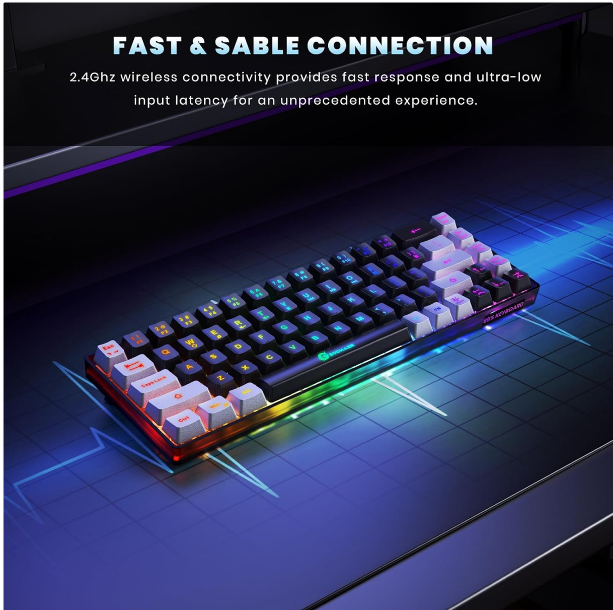
Image: The keyboard positioned on a desk, illustrating its wireless connectivity and compact form factor for an organized workspace.