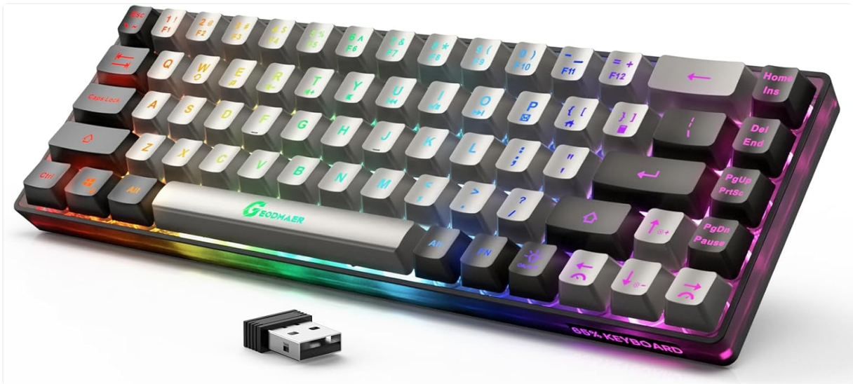
Image: The GEODMAER 65% Wireless Gaming Keyboard in Gray-Black, showcasing its compact layout and included USB receiver.

Thank you for choosing the GEODMAER 65% Wireless Gaming Keyboard. This ultra-compact keyboard is designed for both gaming and office use, offering a reliable 2.4G wireless connection, LED backlighting, and a long-lasting rechargeable battery. This manual provides detailed instructions to help you get the most out of your new keyboard.