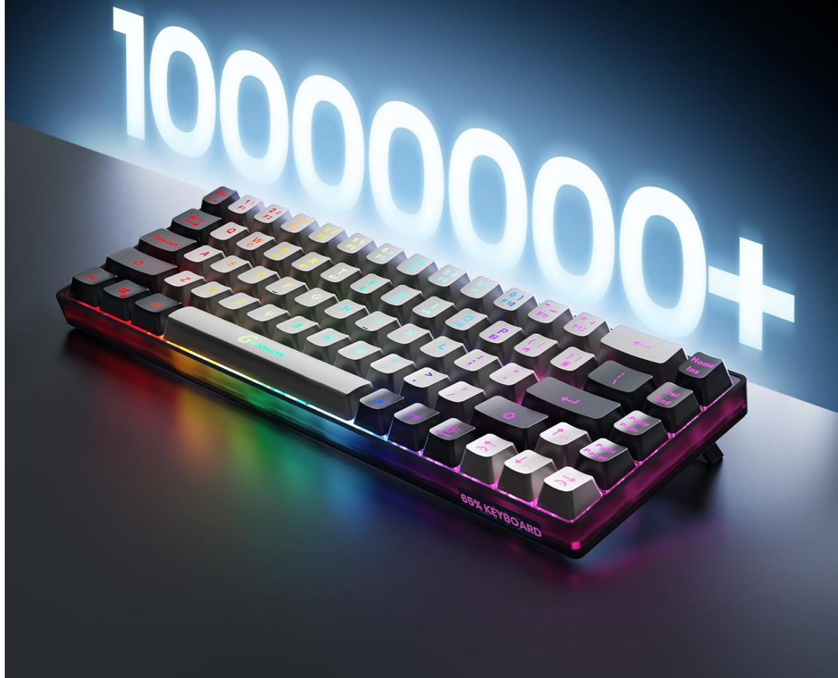
Image: The keyboard highlighting its durable construction, designed for a working life of over 10 million keystrokes.

Working life of more than 10 million keystrokes