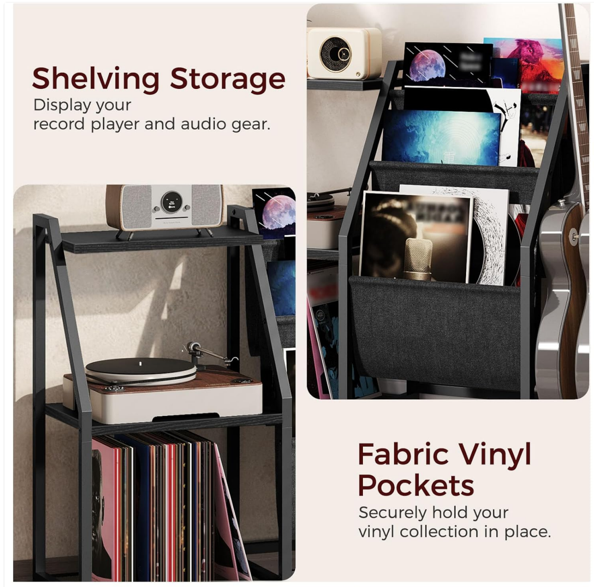
Figure 5.2: A close-up illustrating the shelving storage area, featuring a record player on the top shelf, and the fabric vinyl pockets below, securely holding a collection of records.