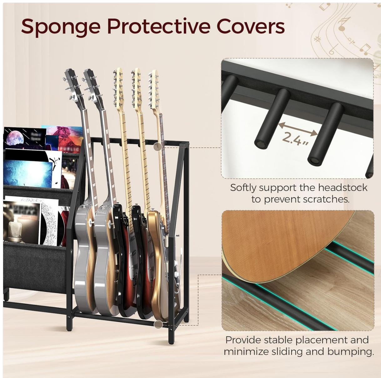
Figure 5.1: Detailed view of instruments placed in the stand. The image highlights the sponge protective covers (2.4" spacing) on the headstock supports to prevent scratches, and the EVA protective covers at the base for stable placement and to minimize bumping.