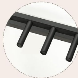
EVA Protective Covers