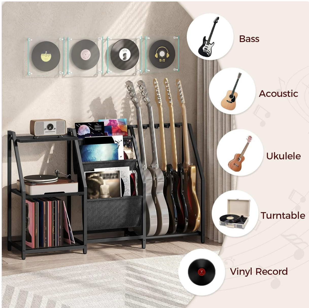
Figure 2.1: The MAHANCRIS GSBK10501 Multi-Instrument Stand, showcasing its capacity to hold multiple guitars (bass, acoustic, ukulele), a turntable, and vinyl records. This image illustrates the stand's comprehensive storage capabilities for a music setup.