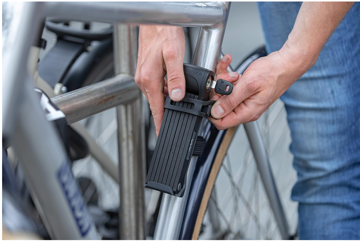
Figure 5: A user demonstrating the process of locking a bicycle to a fixed structure.