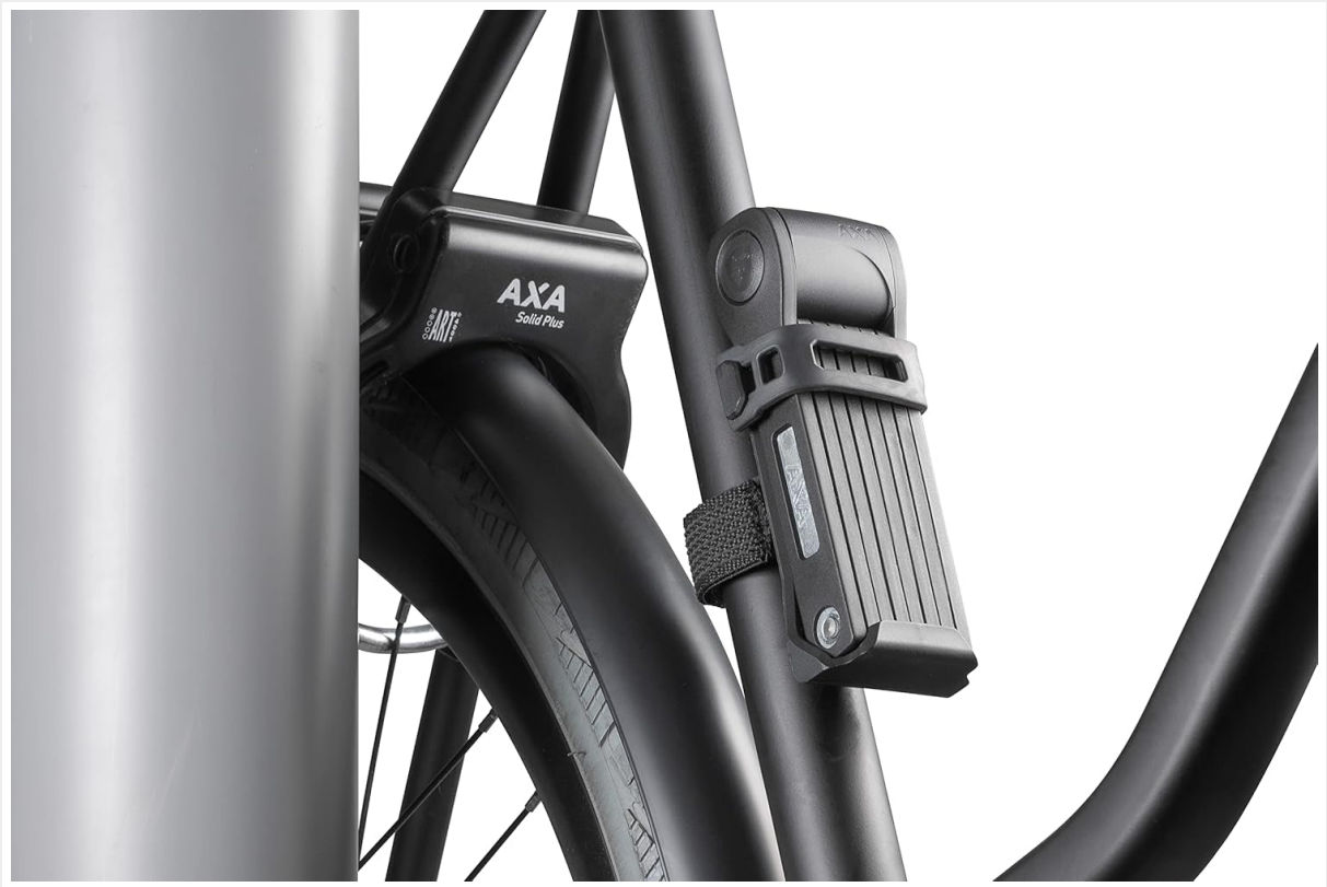
Figure 3: The mounting bracket attached to a bicycle frame, ready to hold the lock.