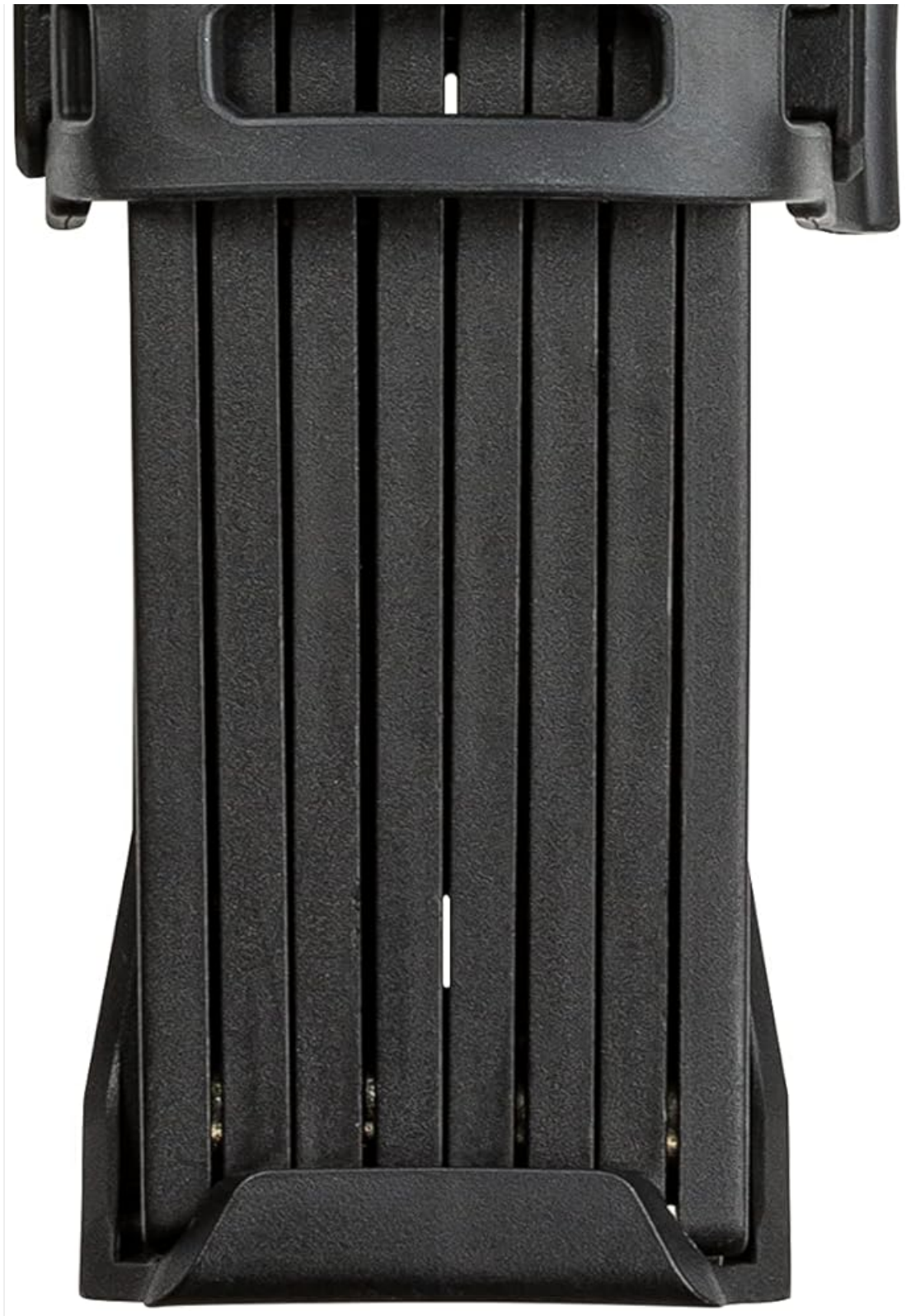
Figure 1: The AXA Fold Lite 80 folding bicycle lock in its unfolded state, ready for use.