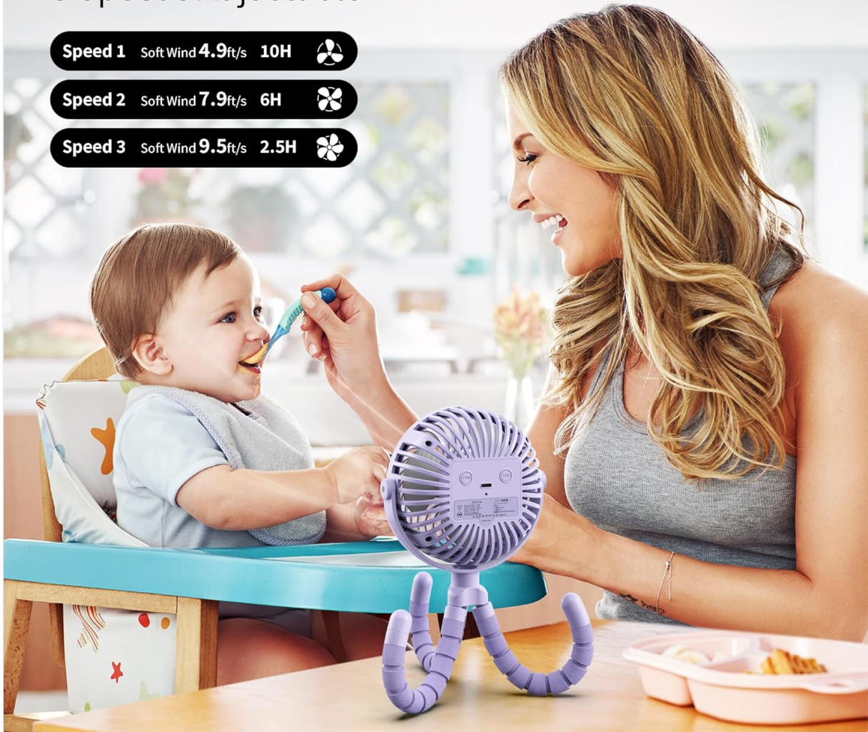
Figure 5: Visual representation of the three adjustable fan speeds and their approximate battery life durations.