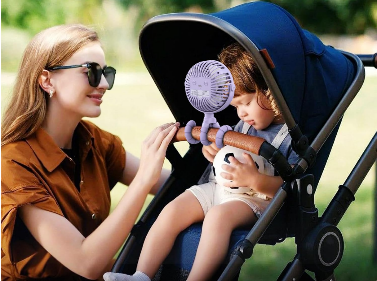
Figure 3: The fan securely attached to a stroller, providing a cooling breeze for a child. This demonstrates the fan's use for all-day outings.