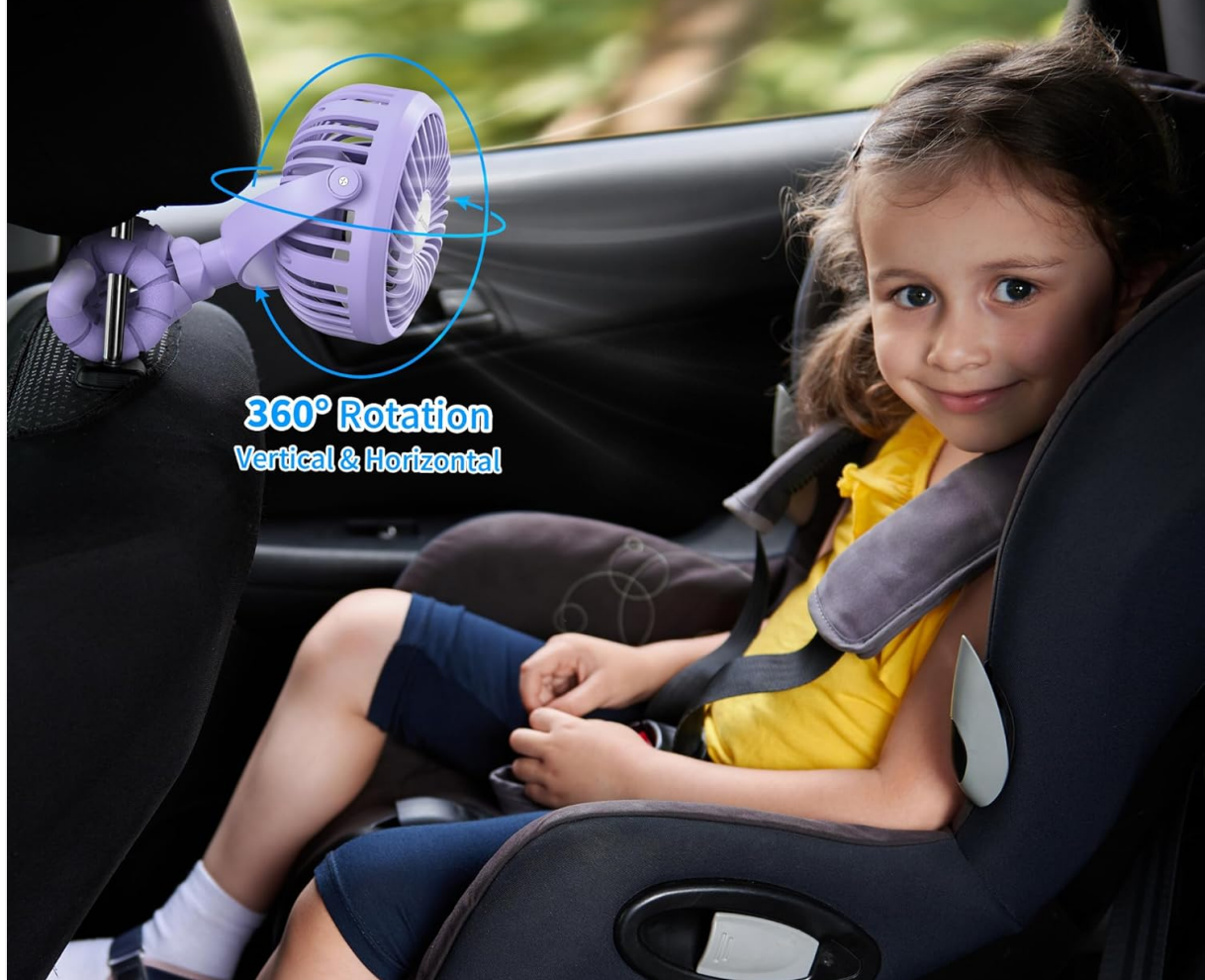
Figure 4: The fan positioned to provide 360-degree air circulation for a child in a rear-facing car seat, highlighting its adaptability for various angles.