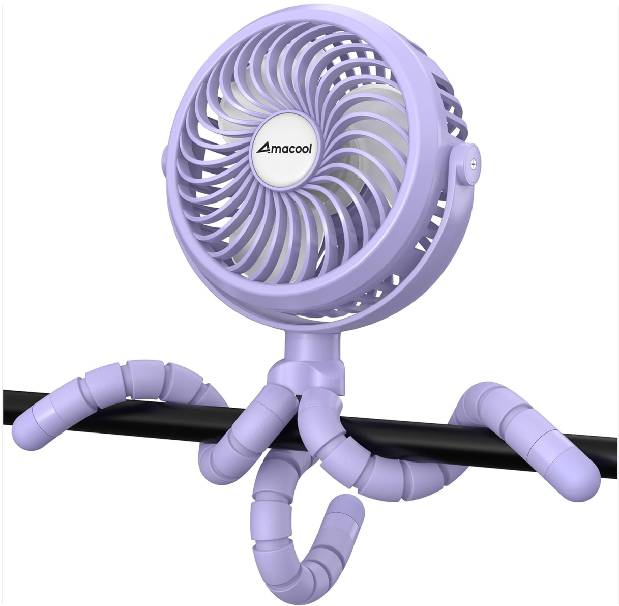
Figure 1: Front view of the AMACOOOL Stroller Fan in purple, showcasing its flexible tripod legs wrapped around a bar. The fan head features the AMACOOOL logo.