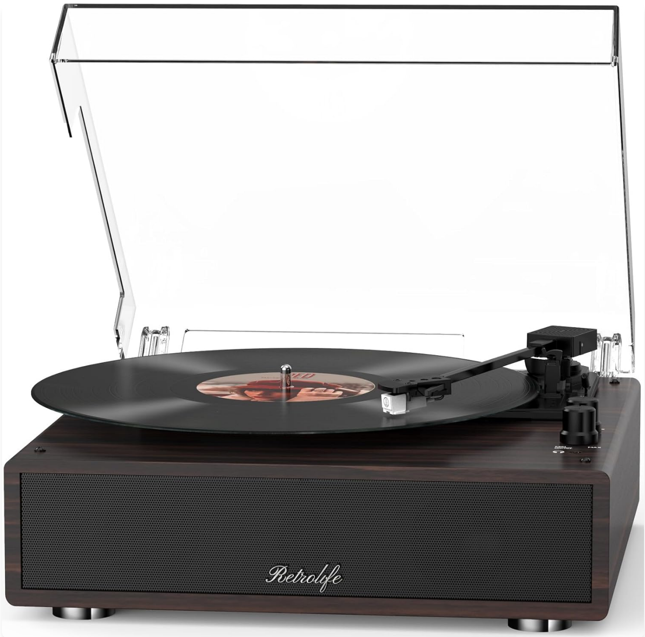
Figure 1.1: The Retrolife HQ-KZ009 Record Player, showcasing its dark walnut finish, built-in speakers, and clear dust cover. A vinyl record is placed on the platter, ready for playback.