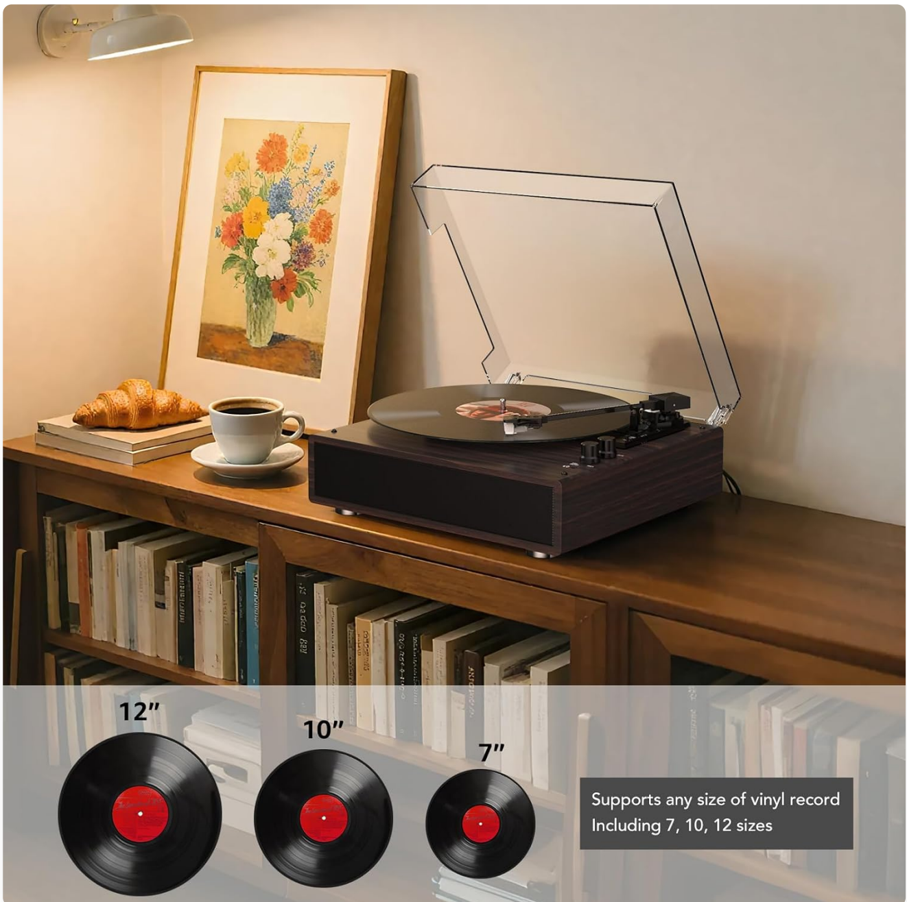
Figure 6.1: The record player supports all standard vinyl record sizes: 7-inch, 10-inch, and 12-inch, and plays them at their respective speeds.