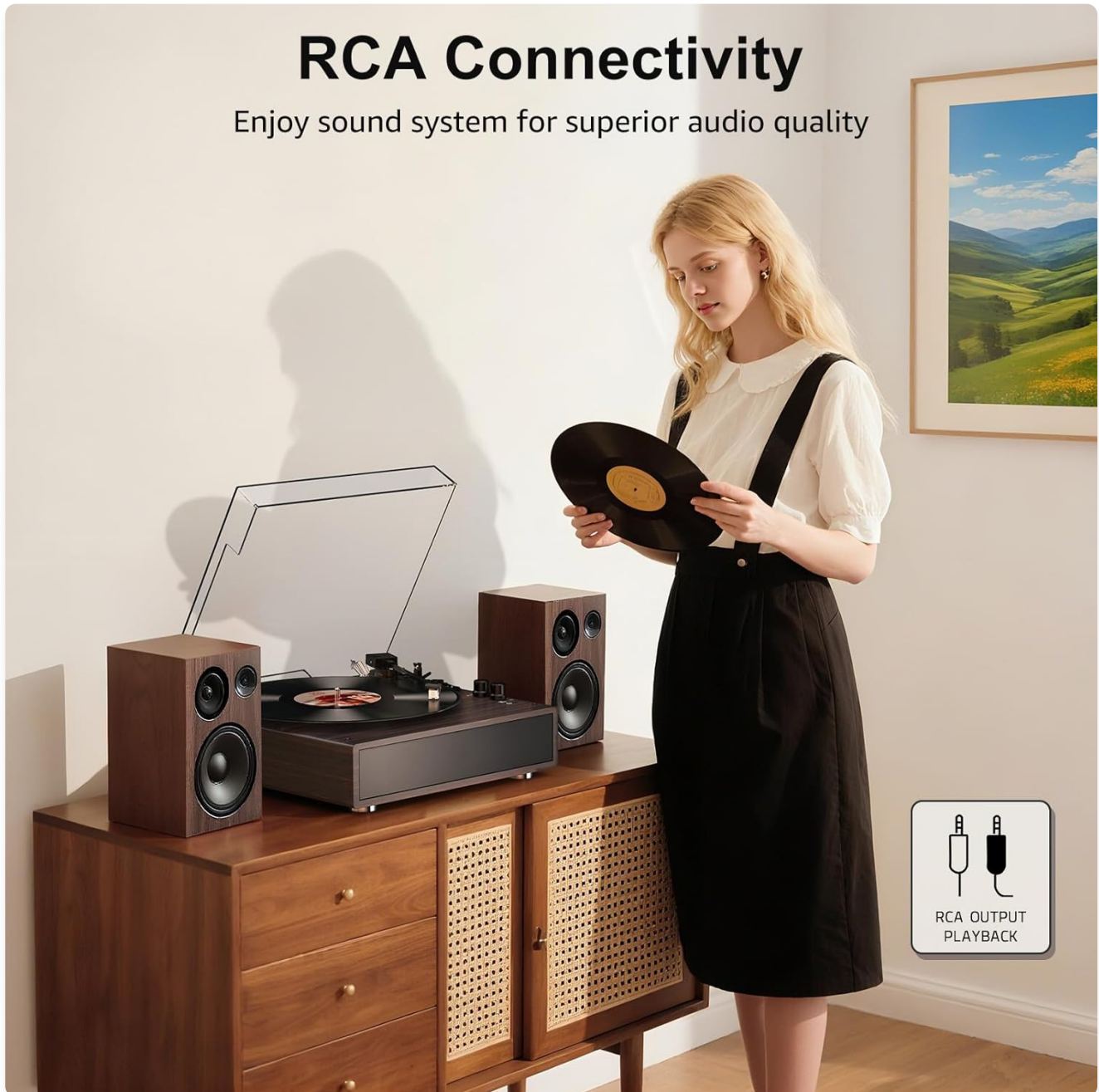
Figure 6.3: The RCA Line Out feature allows connection to external active speakers, providing an option for superior audio quality and a more expansive sound system.

The RCA Line Out allows you to connect your record player to external active speakers or an amplifier for a more powerful and customized audio experience.