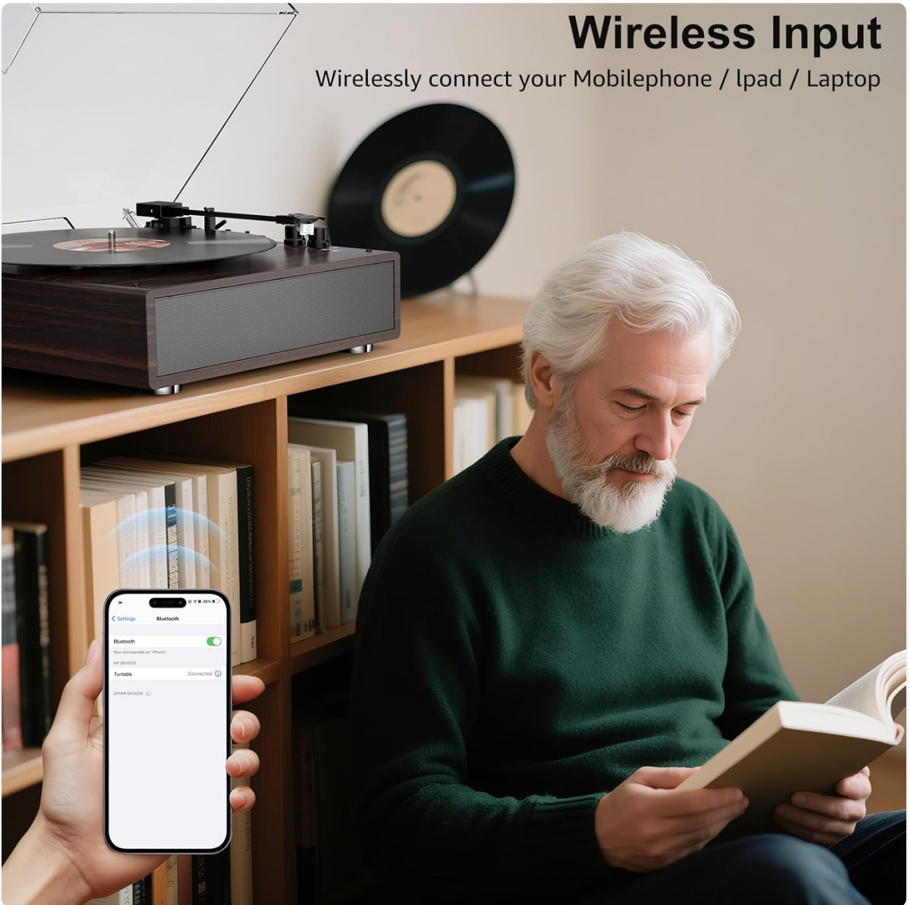
Figure 6.2: The record player supports wireless input, allowing seamless connection with mobile phones, iPads, laptops, and other Bluetooth-enabled devices for audio streaming.

Wirelessly connect your Mobilephone / Ipad / Laptop