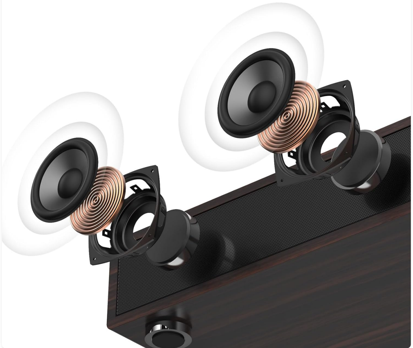
Figure 4.2: Illustration of the internal speaker configuration, highlighting the two bass speakers and one tweeter speaker designed to deliver balanced and high-fidelity stereo sound.