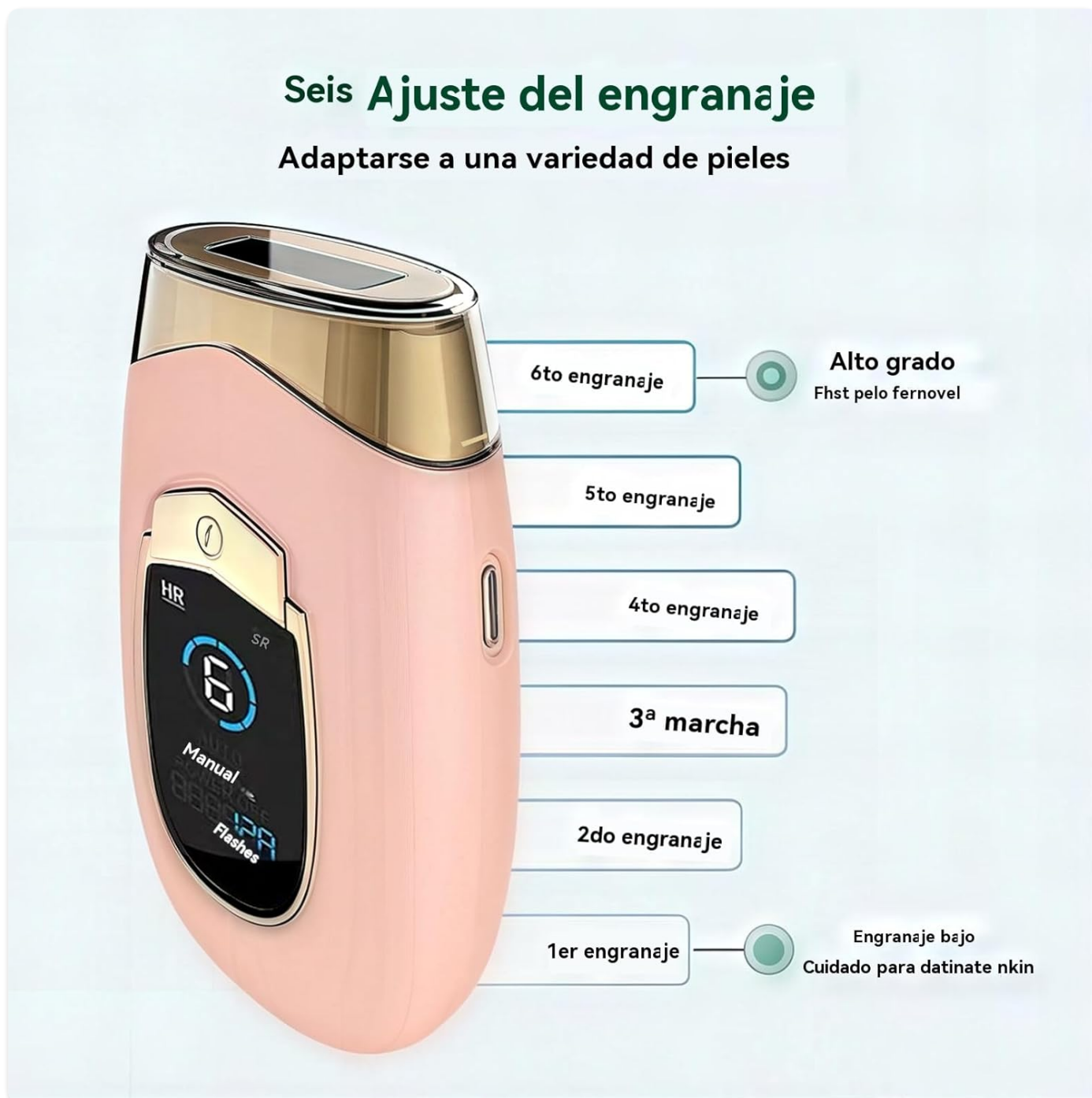
Figure 5: Intensity level adjustment on the device.

The device features 6 intensity levels. Start with a lower intensity level (e.g., Level 1) and gradually increase it based on your comfort and skin reaction.