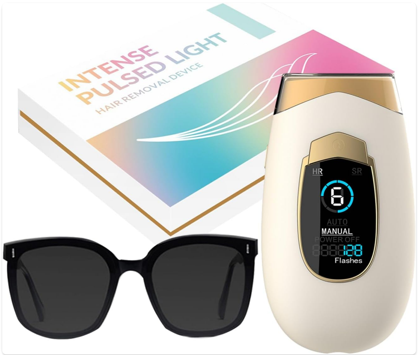
Figure 1: Lumisilk Luminia IPL Epilator and accessories.