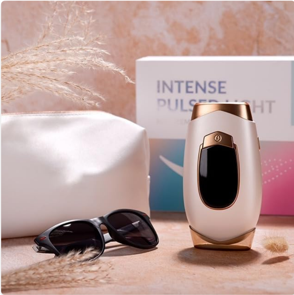
Figure 2: Contents of the Lumisilk Luminia IPL Epilator kit.