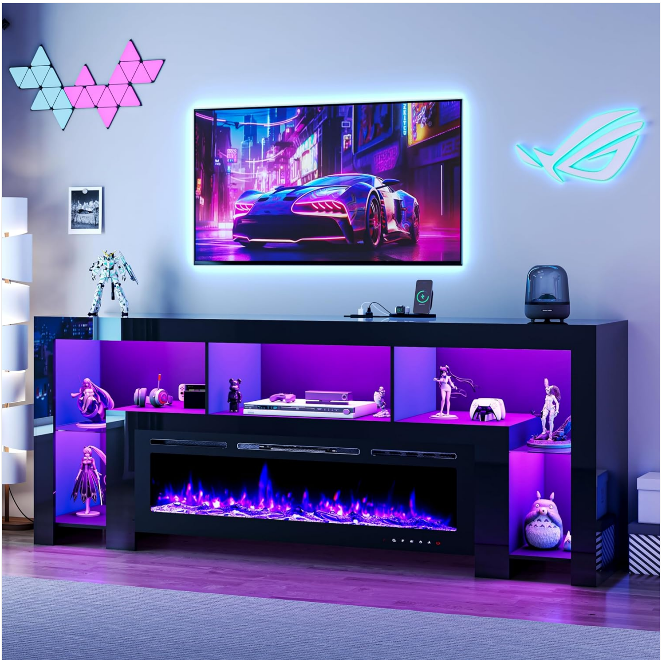
Figure 2.1: The CayugaCrekrd 94.5" Fireplace TV Stand in a living room setting, showcasing its integrated LED lighting and electric fireplace. The stand is designed to support large televisions and offers multiple storage compartments.