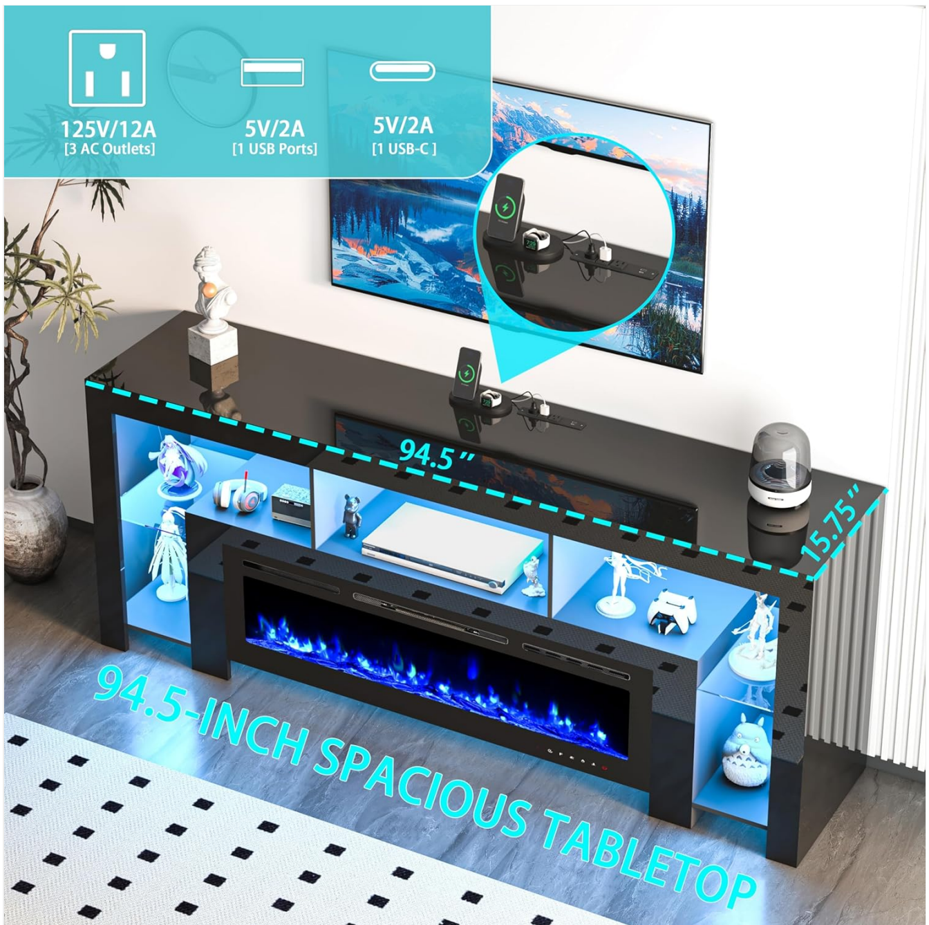
Figure 4.3: Detail of the integrated charging station, featuring three AC outlets, one USB-A port, and one USB-C port for convenient device charging. The image also emphasizes the spacious 94.5-inch tabletop.