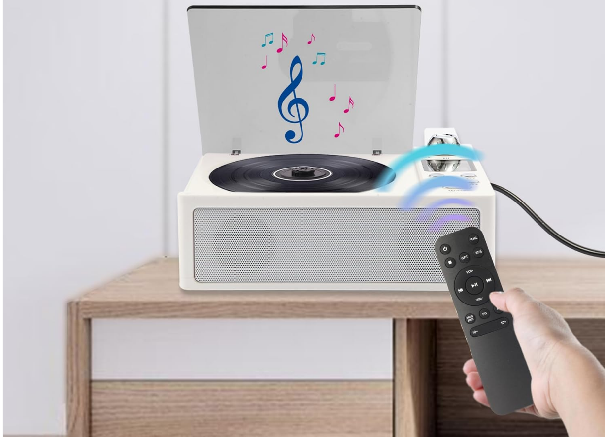
Image 5: The M-Amazup L-CD211 CD Player highlighting its extended FM reception capabilities, supporting a full band from 76Hz to 108MHz.

Control your music easily with the provided remote