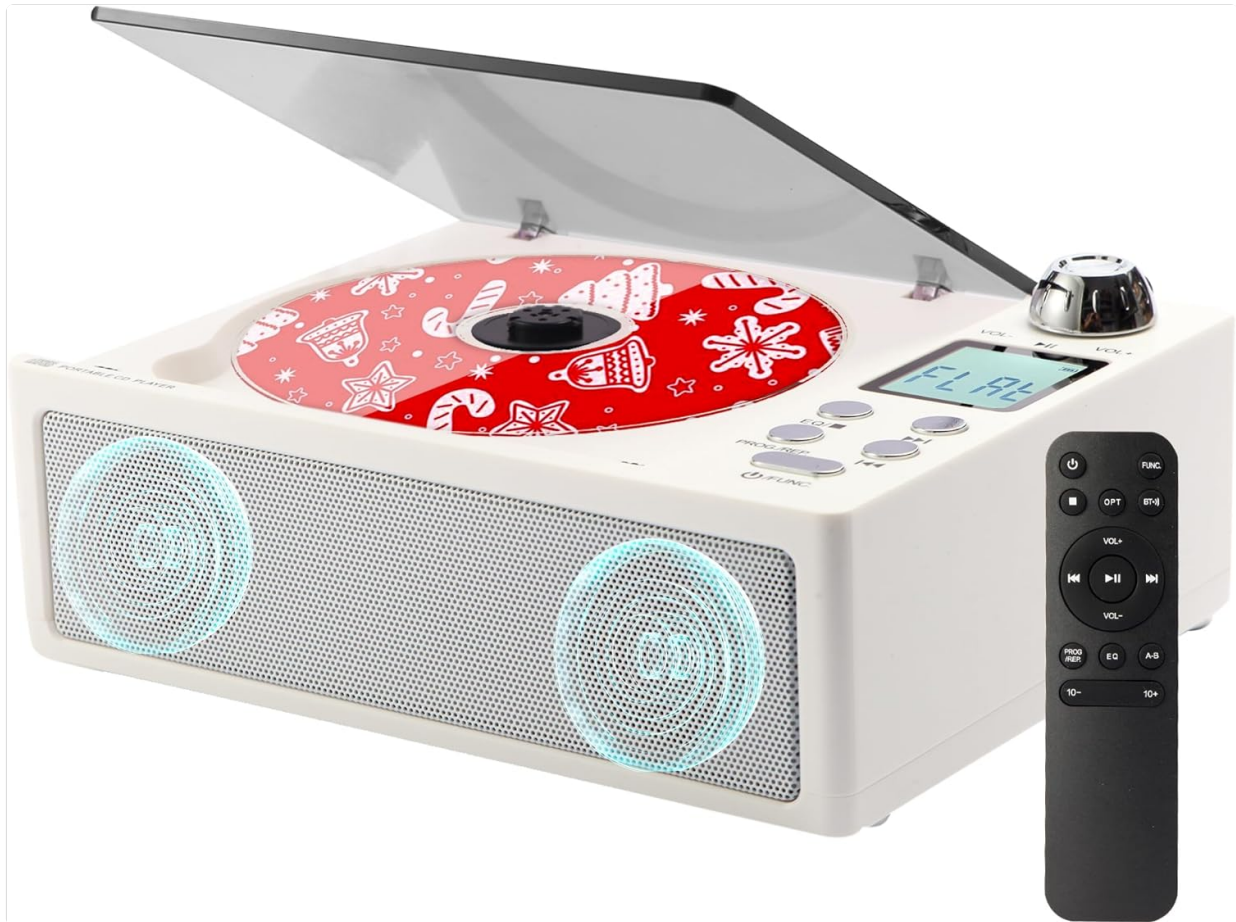
Image 3: The M-Amazup L-CD211 CD Player with a CD inserted and playing, demonstrating its primary function.