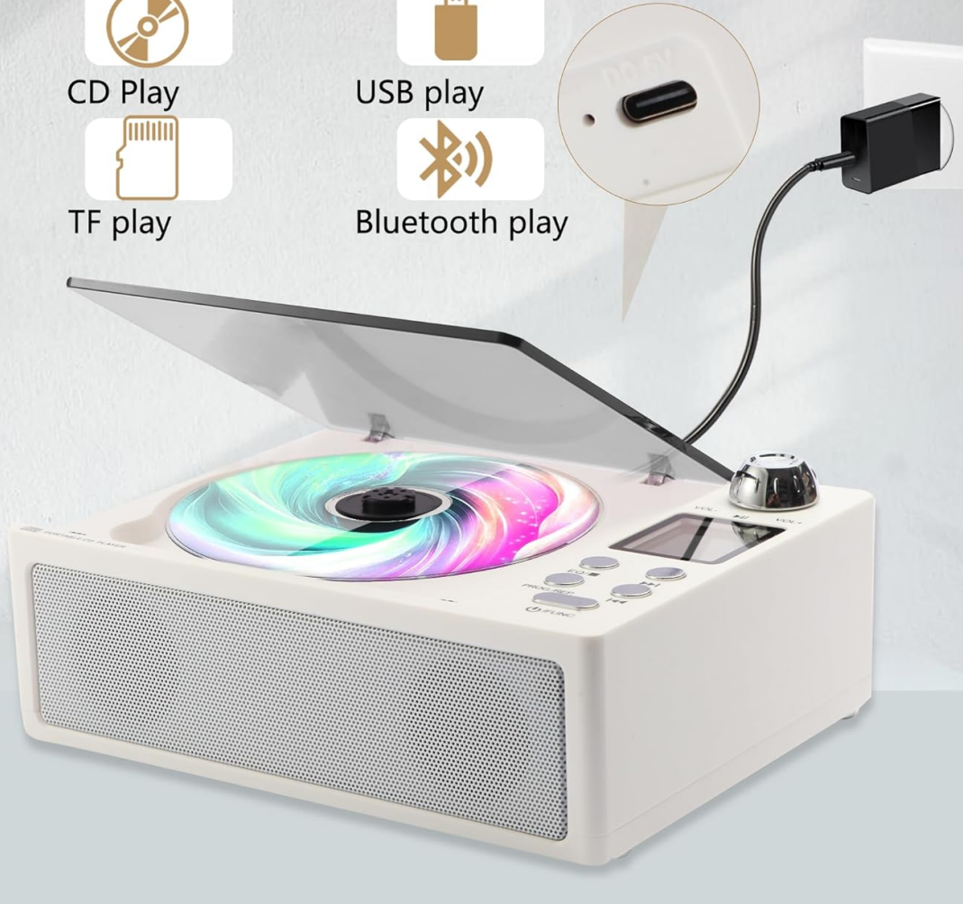
Image 2: The M-Amazup L-CD211 CD Player showcasing its various playback modes including CD, AUX, FM Radio, USB, Bluetooth, and 3.5mm Audio Input/Output.